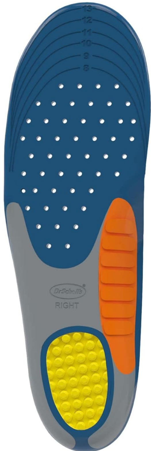
Image: Dr. Scholl's Heavy Duty Support Insole showing the size markings for precise trimming to fit various shoe sizes.