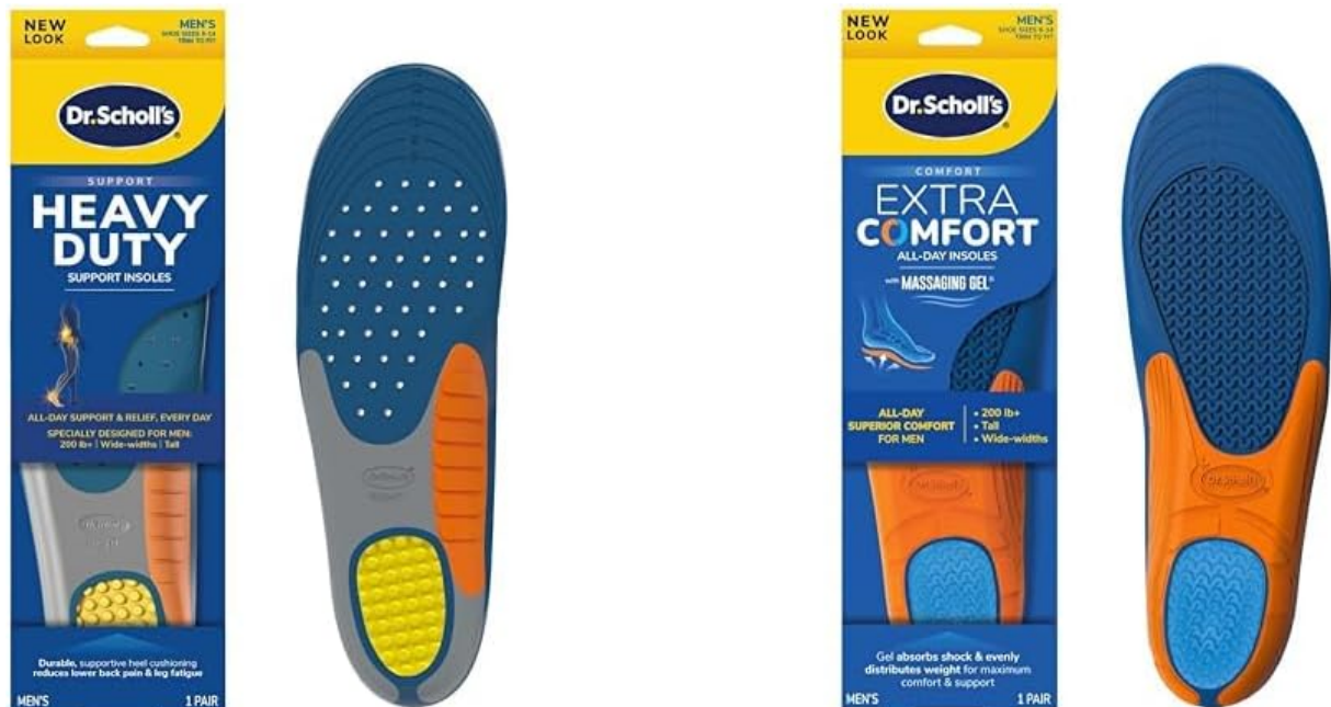
Image: Dr. Scholl's Heavy Duty Support Insoles and Extra Comfort All-Day Insoles shown in their respective packaging.

Dr. Scholl's Heavy Duty Support Insoles and Extra Support Insoles are engineered to provide superior comfort and support for individuals requiring enhanced foot care. These insoles are designed to reduce lower back pain, leg fatigue, and absorb shock, distributing pressure evenly across the foot. They are particularly beneficial for men over 200 lbs, tall individuals, or those with wide feet, offering all-day relief and support.