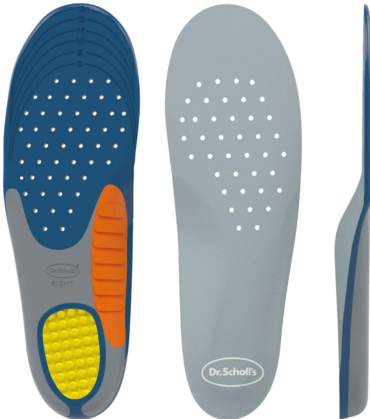
Image: A detailed view of the Dr. Scholl's Heavy Duty Support Insole, displaying its top, bottom, and side profiles to highlight its ergonomic design and cushioning layers.

Duty Insoles work to absorb impact and distribute pressure, reducing strain on your feet and lower body. For optimal performance, ensure the insoles are correctly placed in your footwear. If you experience any discomfort, re-adjust their position or re-trim if necessary. It may take a few days for your feet to fully adapt to the new support.