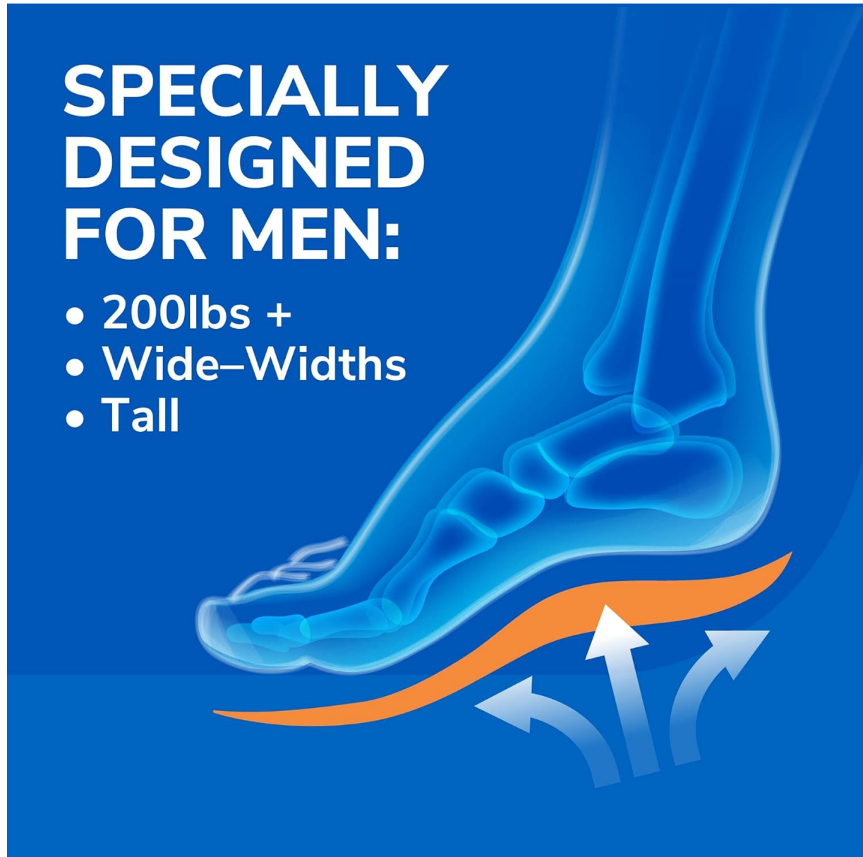
Image: A diagram showing how Dr. Scholl's insoles provide arch support and distribute pressure across the foot.