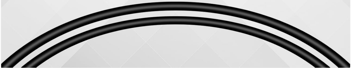
Image: Visual representation of the product's key features, including food-grade silicone, reliability, heat resistance, tear resistance, stretchability, and long service life.