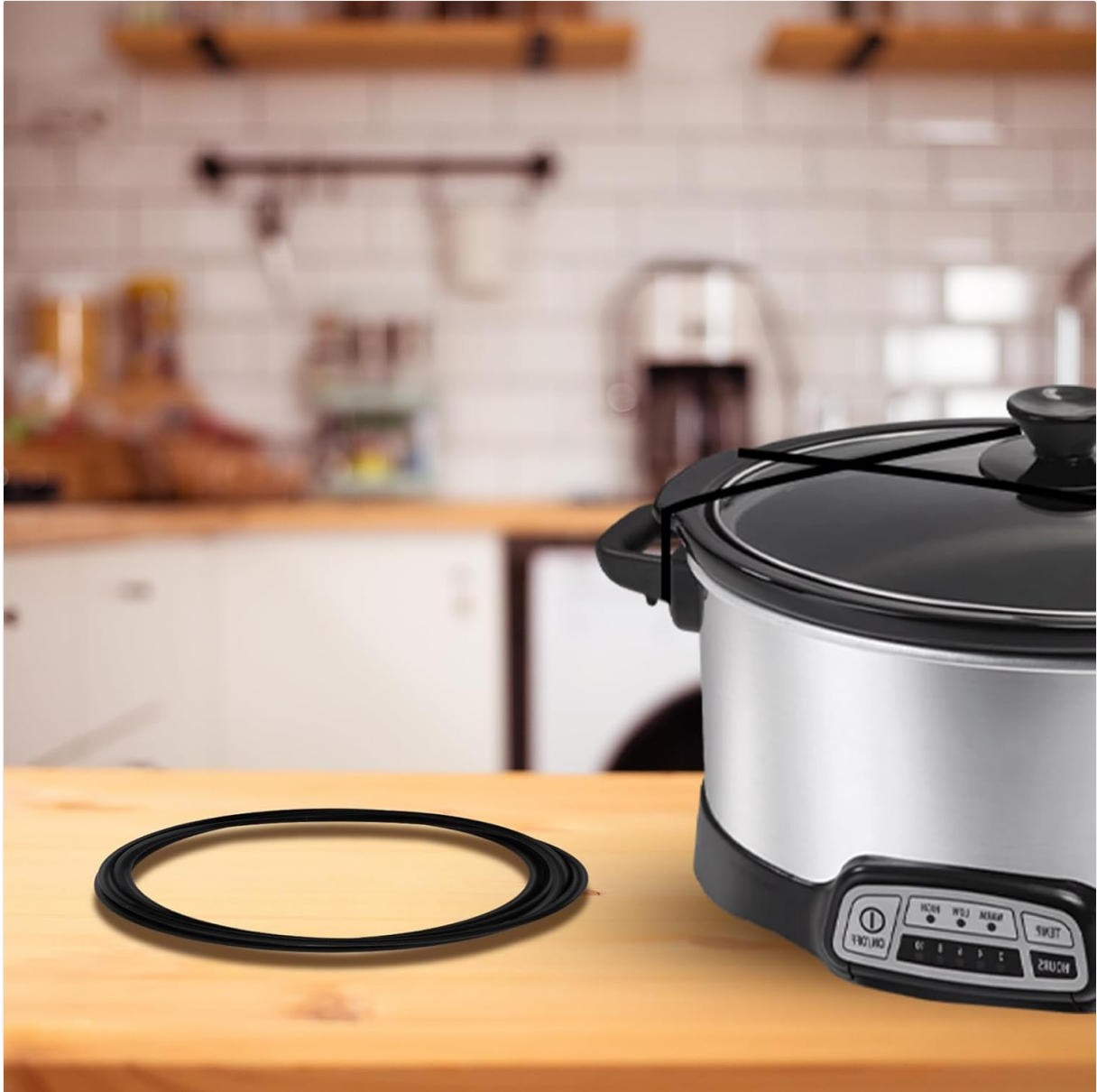
Image: The lid latch strap in use, securing a slow cooker lid to prevent spills and maintain a tight seal.