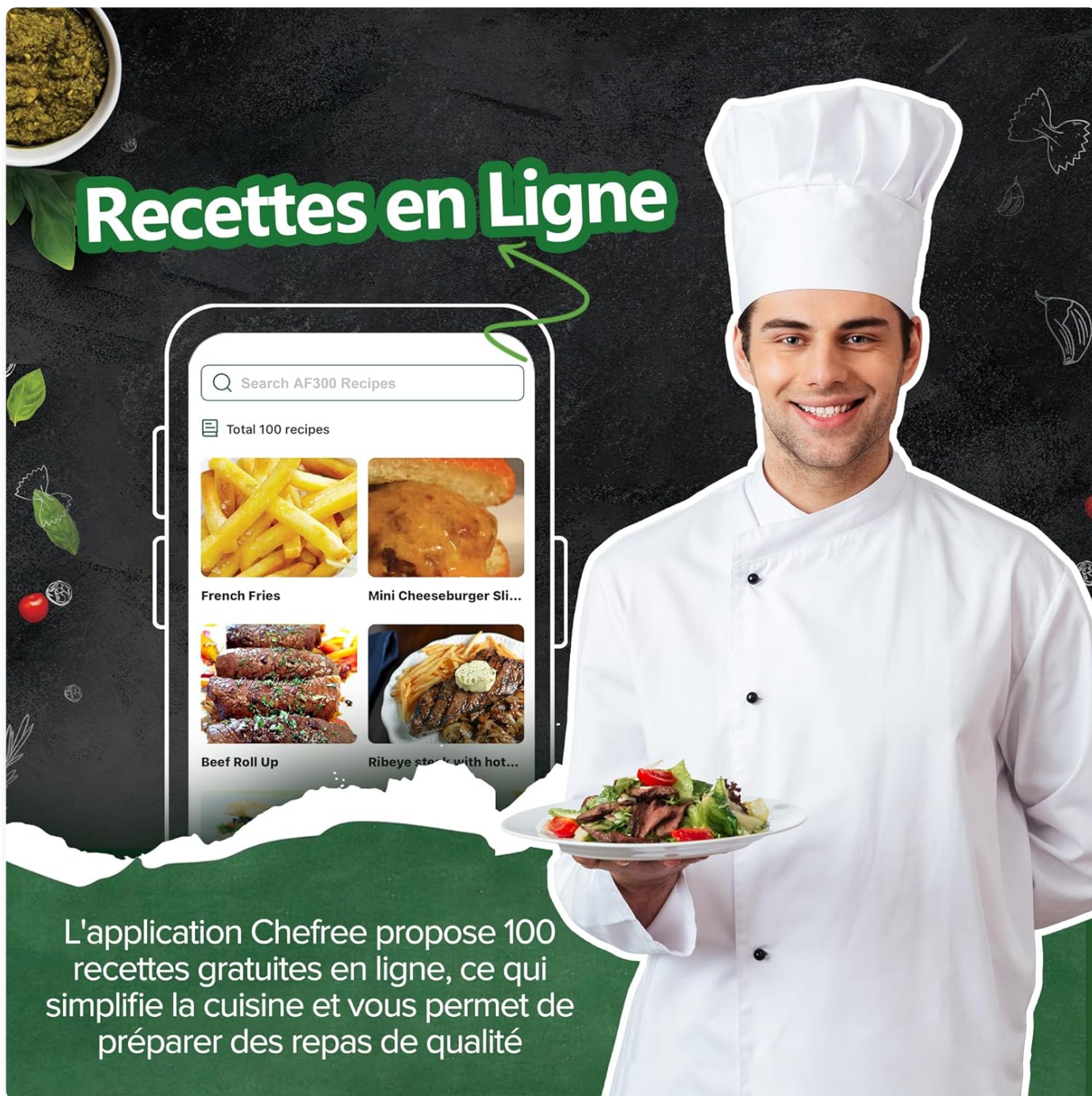
Image: The CHEFREE app offers a collection of 100 free online recipes, providing culinary inspiration and guidance.