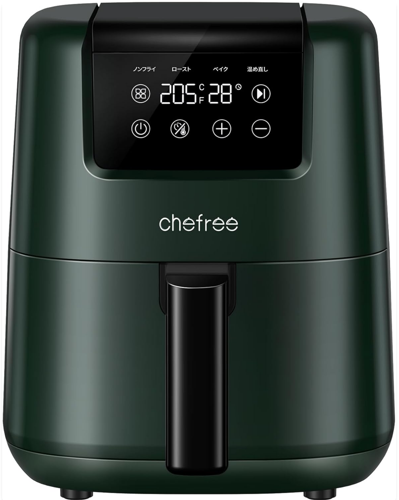
Image: Front view of the CHEF FREE AF300 Air Fryer, showcasing its sleek dark green design and intuitive digital control panel.