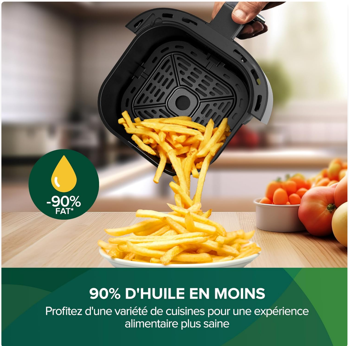
Image: The air fryer's ability to cook with up to 90% less oil, promoting healthier eating habits.