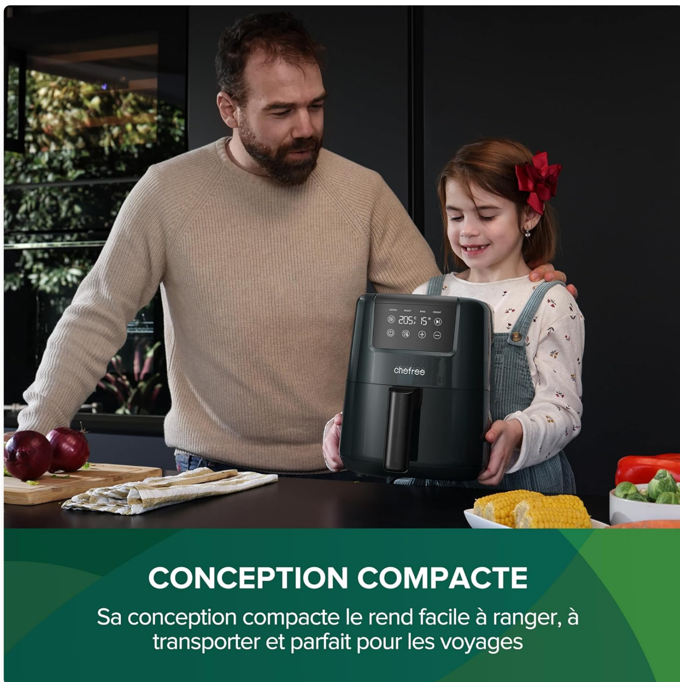
Image: The compact design of the CHEF FREE AF300 Air Fryer, demonstrating its small footprint suitable for various kitchen spaces.