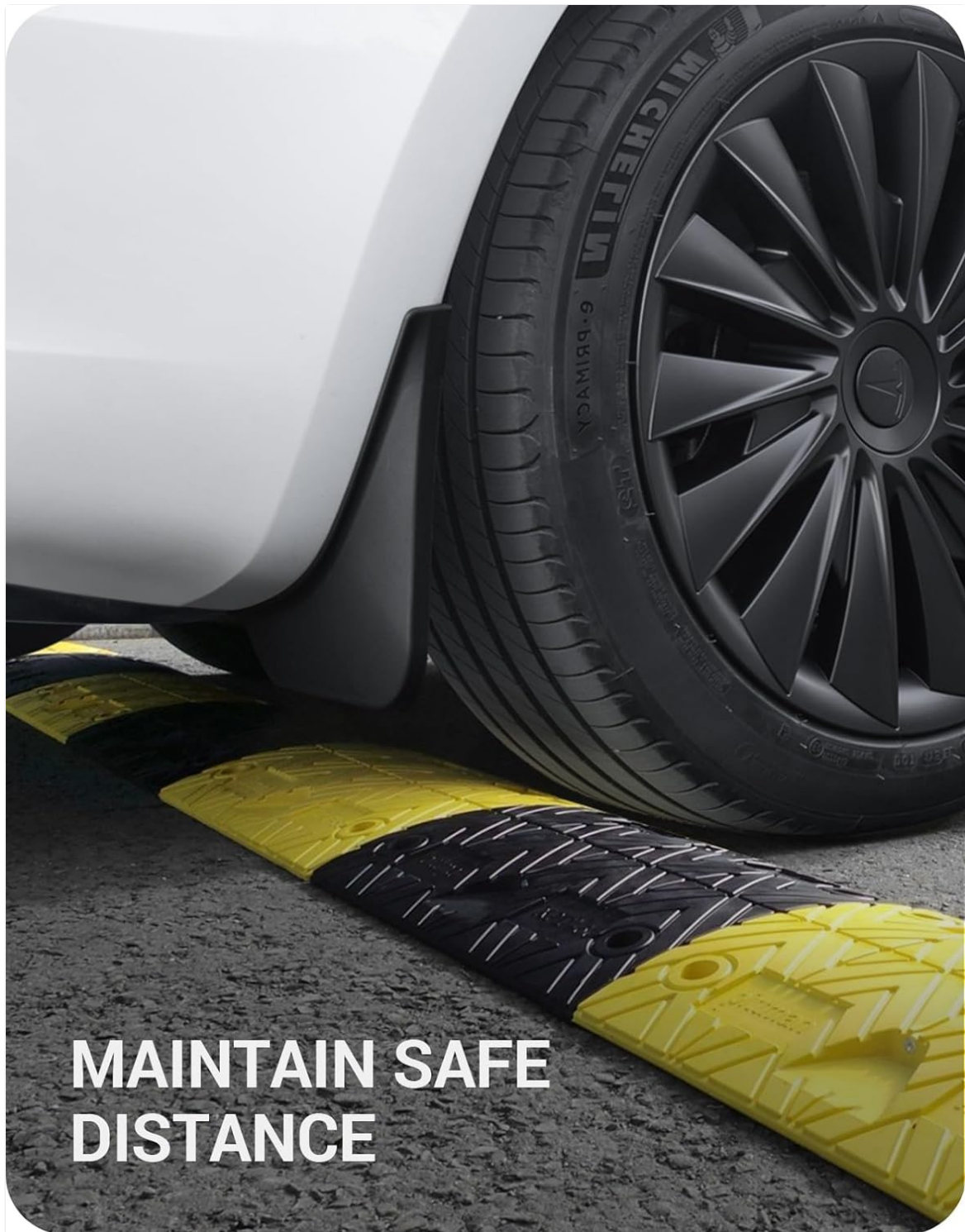
Figure 6: Mud flaps maintaining safe distance from the ground.