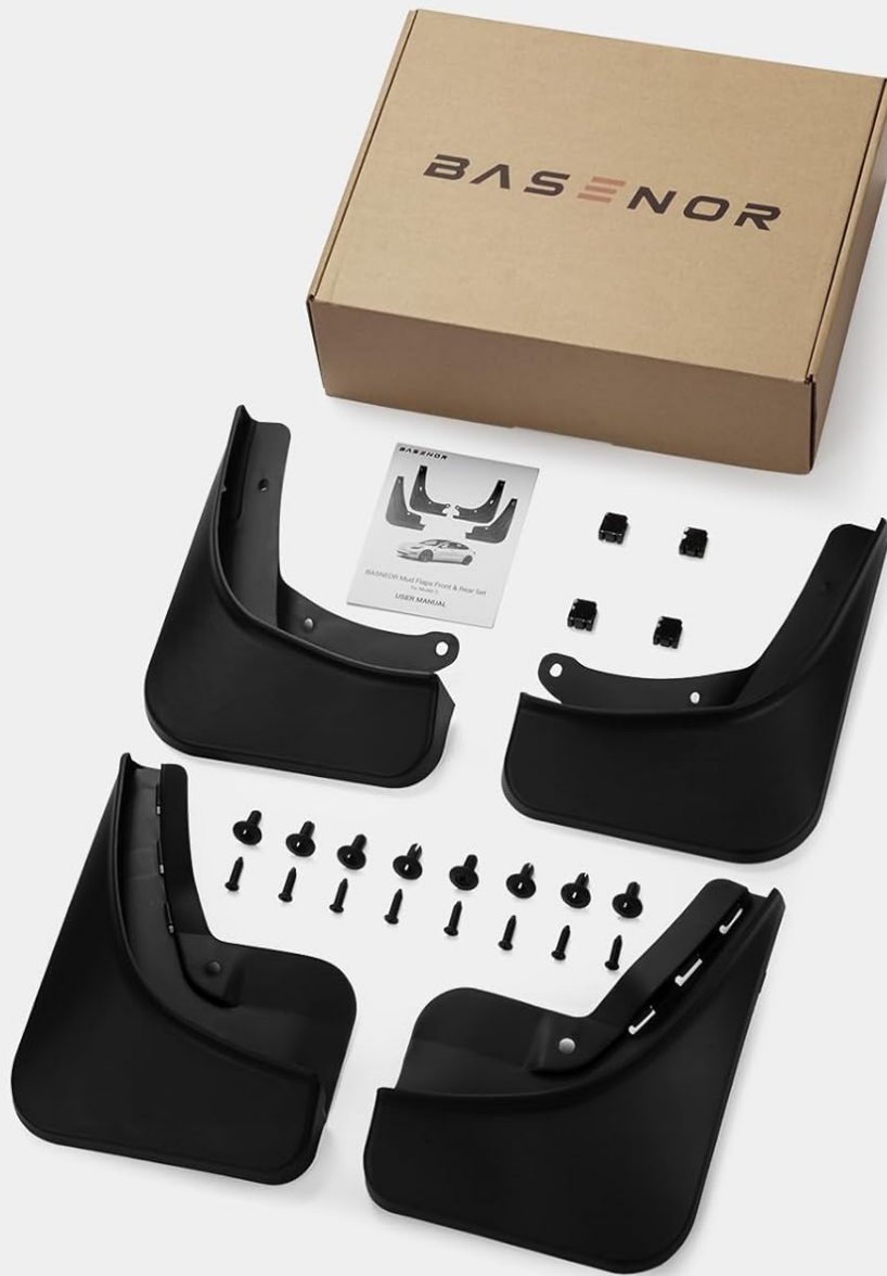
Figure 2: Package Contents.