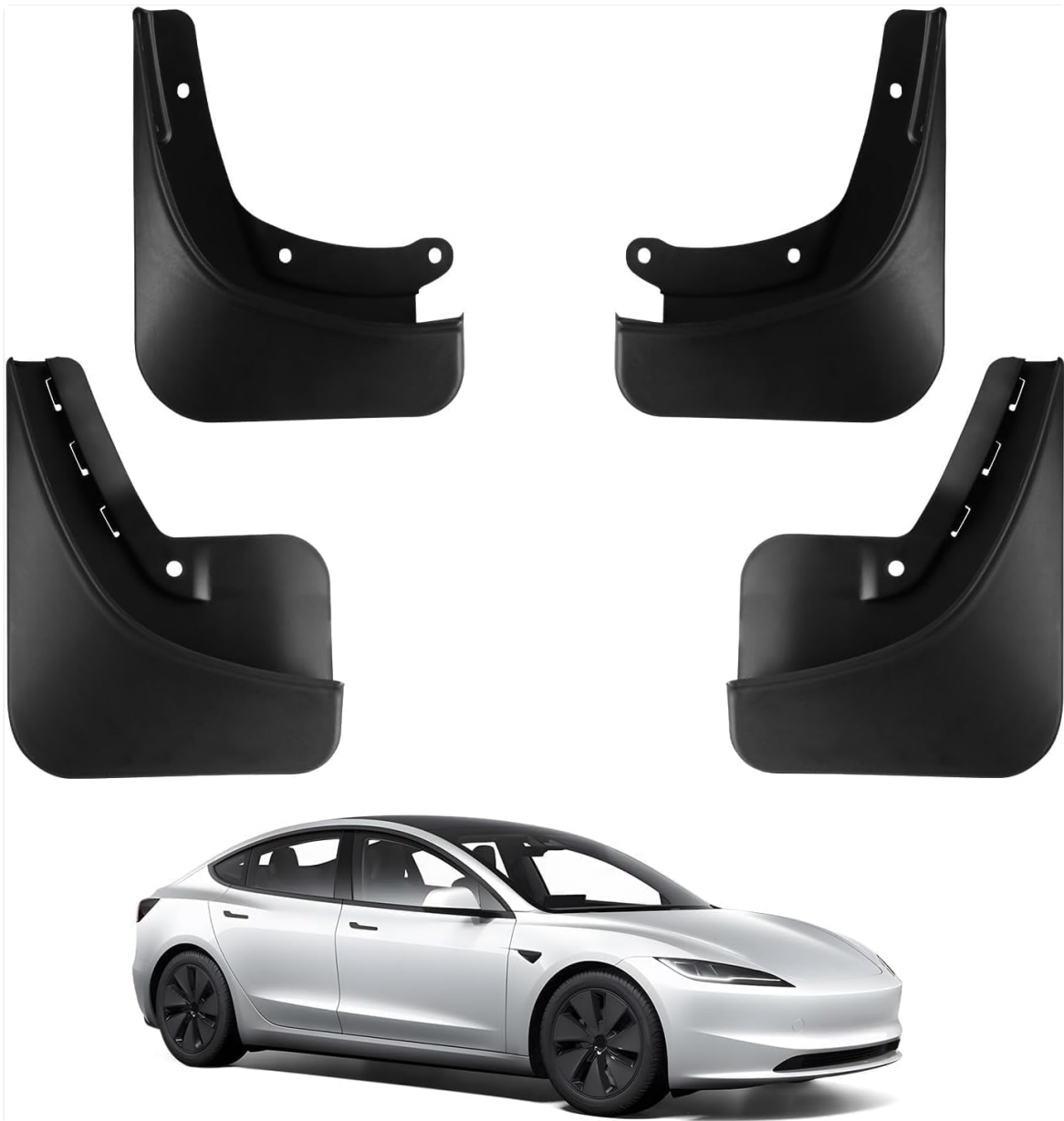
Figure 1: BASENOR Mud Flaps for Tesla Model 3 Highland.