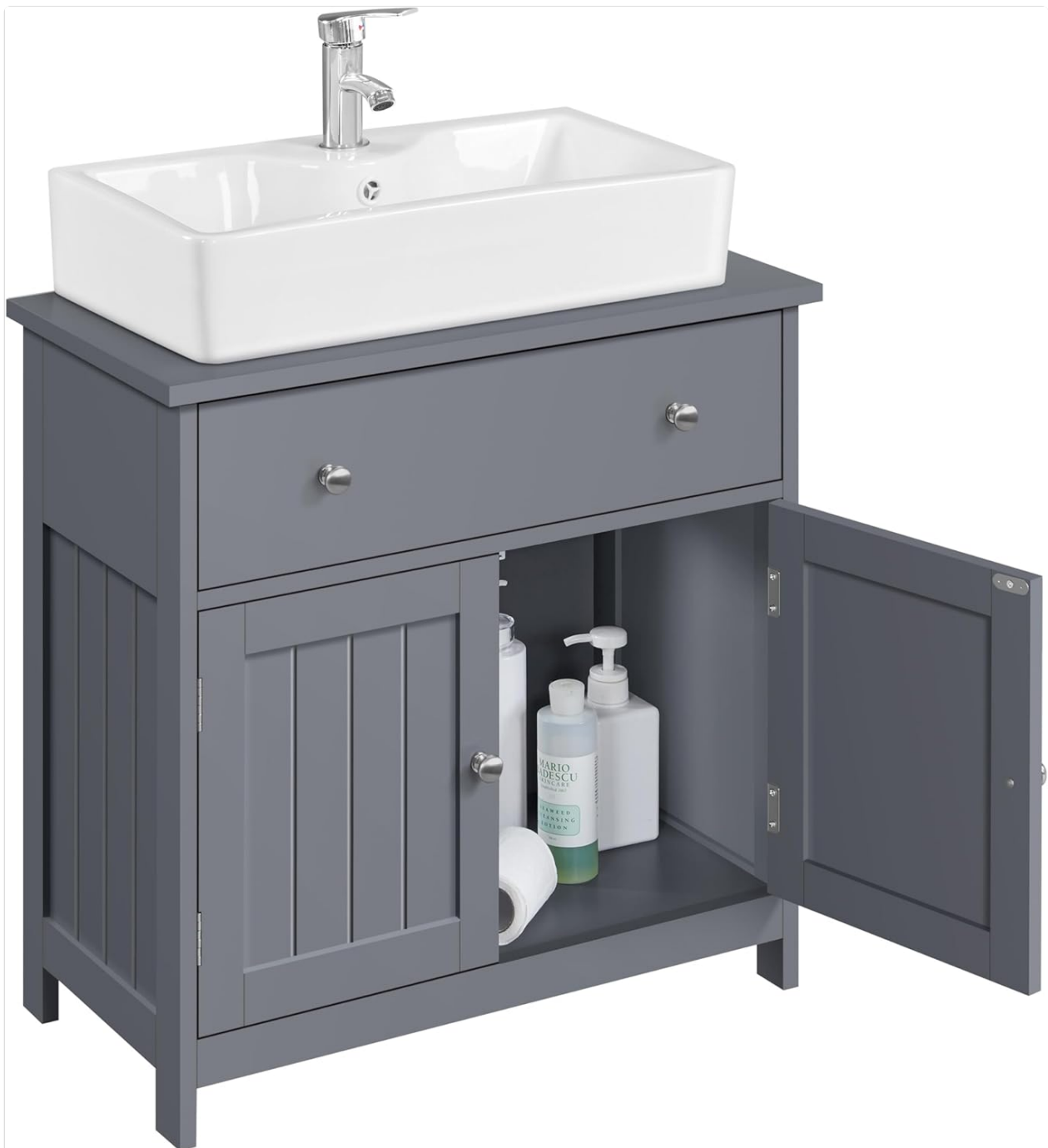
Image 1.1: The Yaheetech Bathroom Vanity Unit, shown with a sink installed (sink not included).