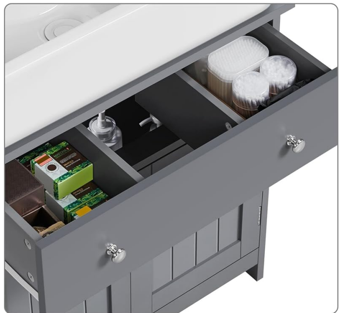
Image 5.1: The drawer interior, demonstrating its capacity for organized storage of various bathroom essentials.