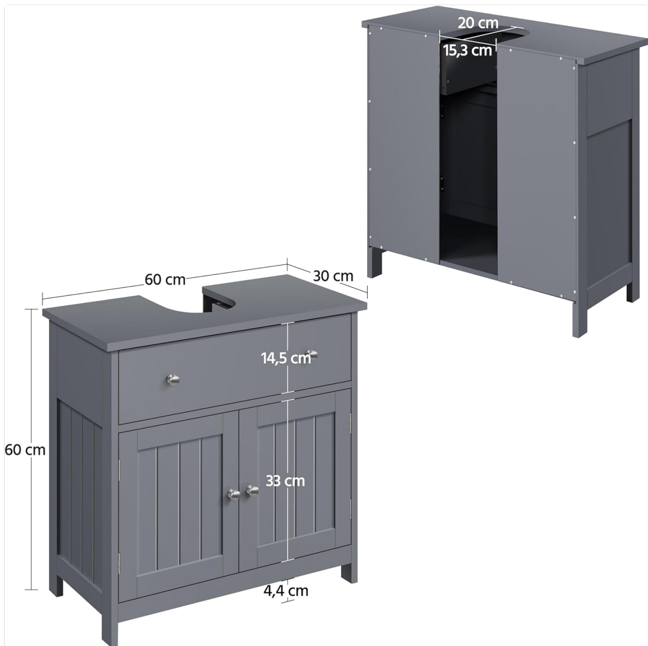
Image 3.1: Detailed dimensions of the vanity unit, including the siphon cut-out.