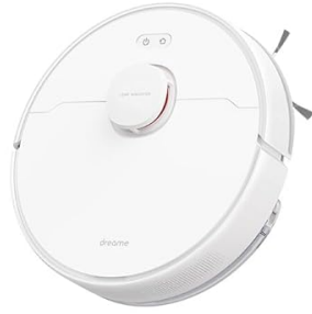
Robot x 1