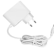
Charger x 1