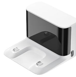
Charging Dock x 1