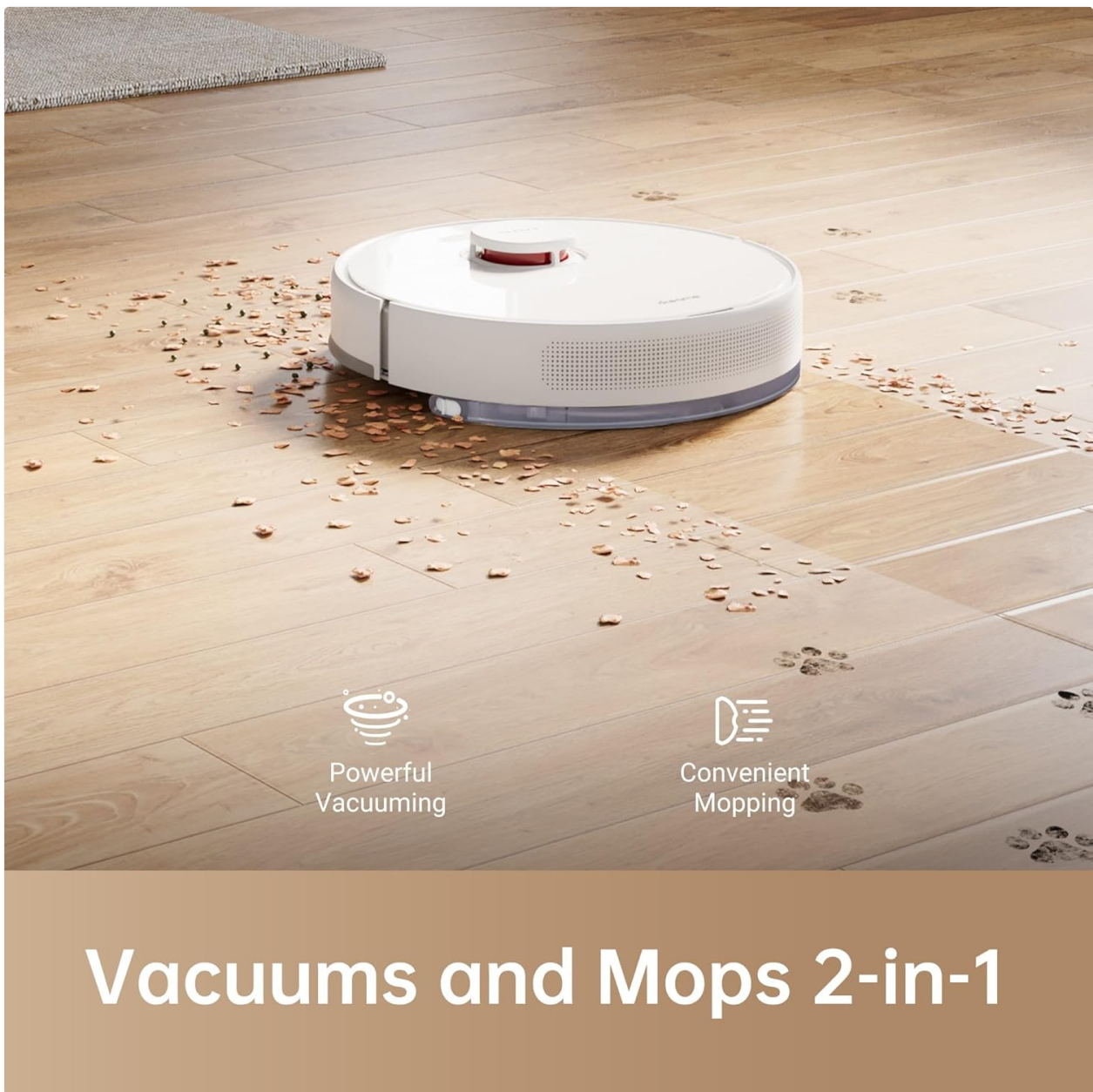
Image: The DREAME F9 Pro operating in its 2-in-1 vacuuming and mopping mode.