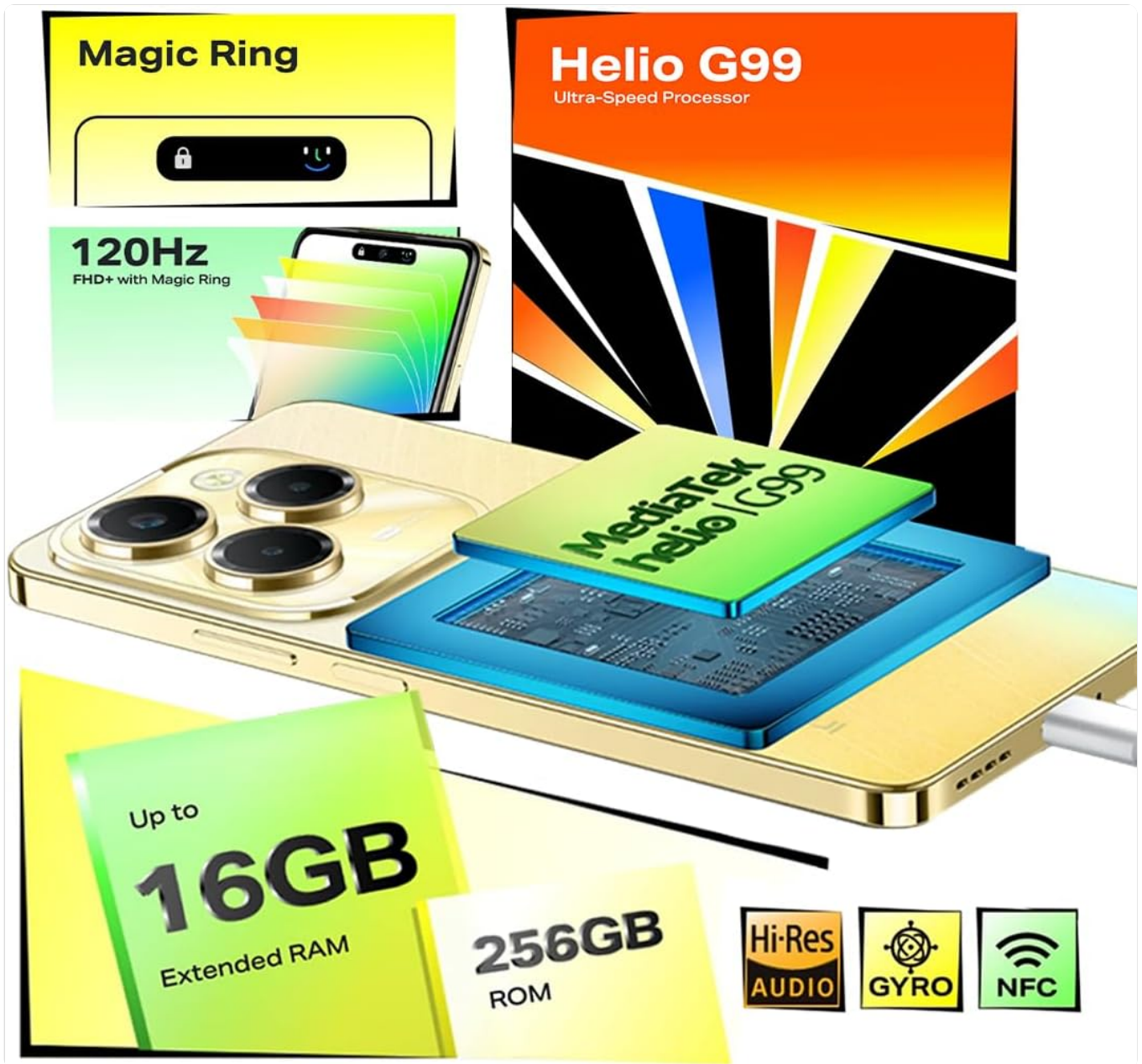
Figure 3.2.7: Helio G99 Processor and Memory. An infographic highlighting the Helio G99 Ultra-Speed Processor, up to 16GB Extended RAM, and 256GB ROM, along with Hi-Res Audio, Gyro, and NFC capabilities.