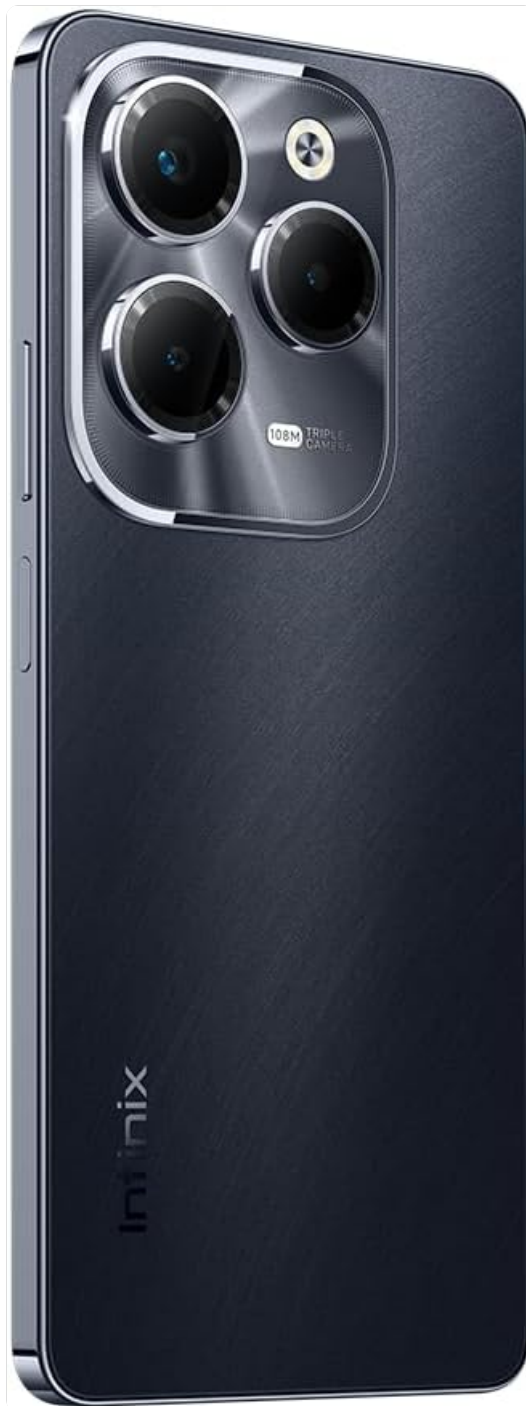
Figure 3.2.3: Rear Camera Module. A close-up view of the triple AI camera setup on the back of the phone, highlighting the 108MP main sensor.