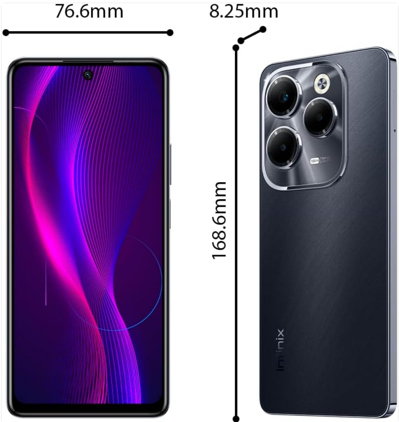
Figure 3.2.2: Infinix Hot 40 Pro Dimensions. This image illustrates the precise measurements of the device, including its length (168.6mm), width (76.6mm), and thickness (8.25mm).