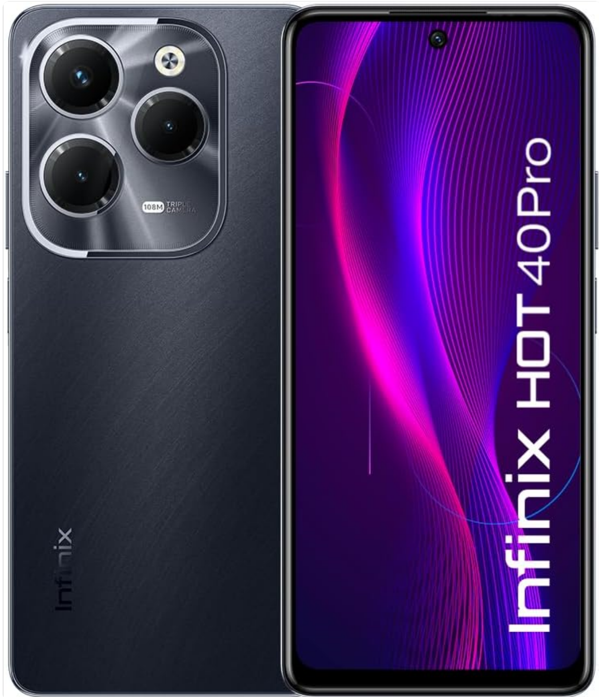
Figure 3.2.1: Front and Back View of Infinix Hot 40 Pro. This image displays the phone from both the front, highlighting its punch-hole display, and the back, showcasing the camera module and the Infinix branding.

Familiarize yourself with the physical aspects and components of your Infinix Hot 40 Pro.