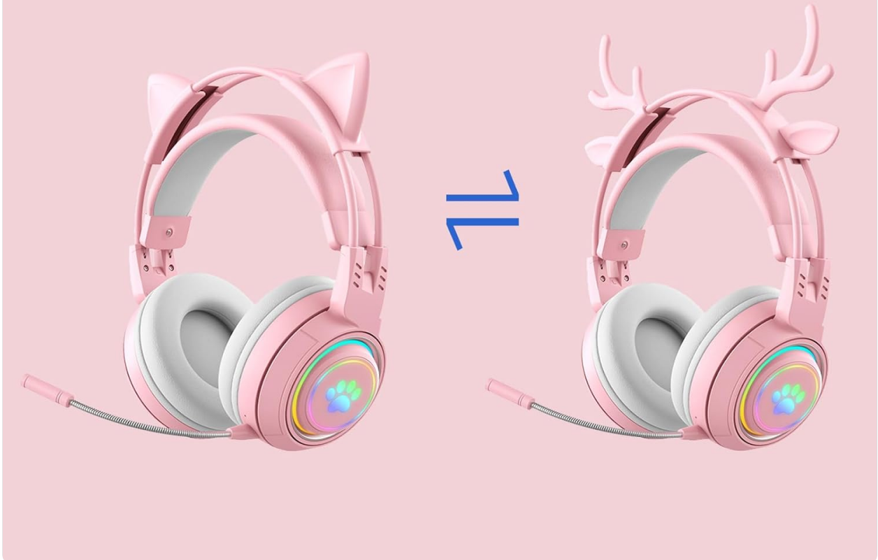
Figure 6: Interchangeable Cat and Deer Ears.

The box comes with both cat ears and deer ears, which you can change freely.