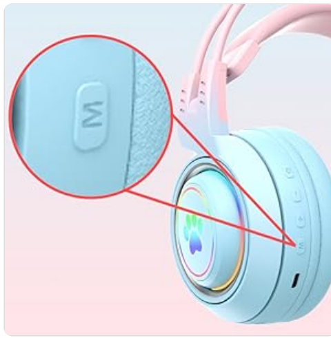
Figure 14: Mode Switch Button ('M').