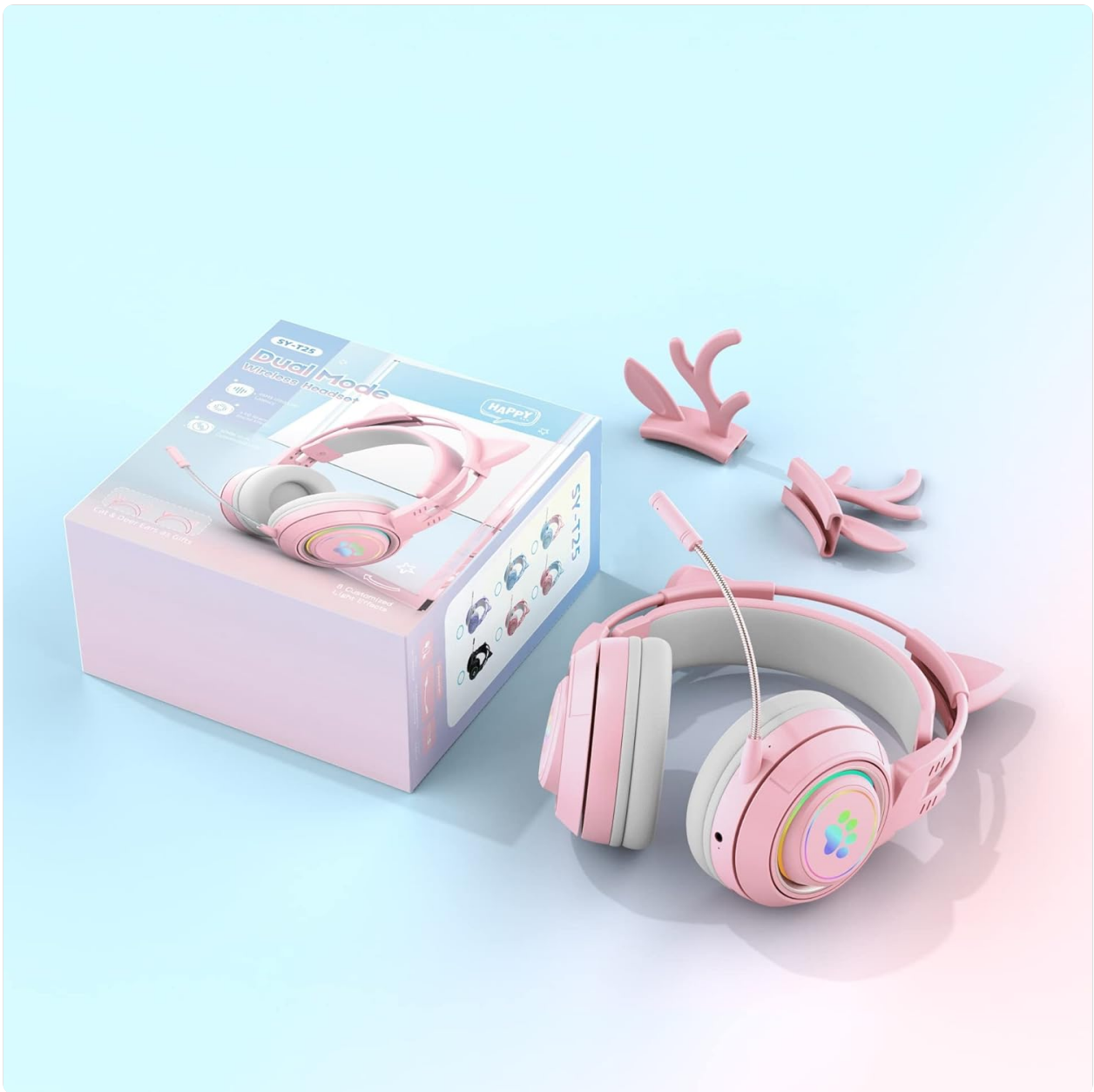
Figure 2: Headset and included accessories.