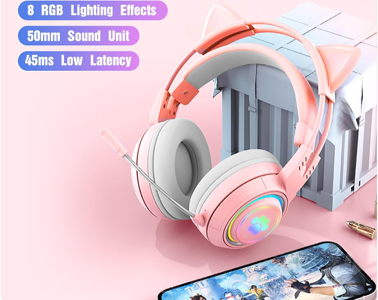
Figure 1: Lomilusk SY-T25 RGB Cat Ear Wireless Headset.