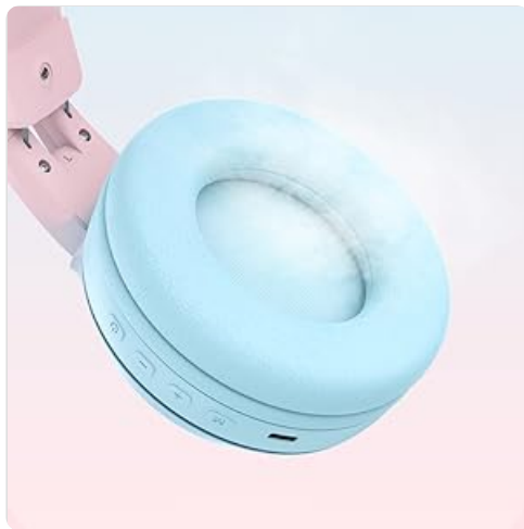
Figure 4: Comfortable Earmuffs.