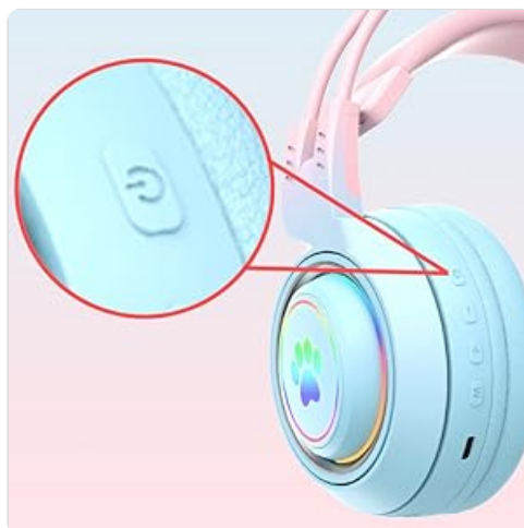
Figure 9: Power Button.

To power on the headset, press and hold the power button until you hear the prompt sound "Power on" and the indicator light flashes red and blue alternately. To power off, press and hold the power button until the headset turns off.