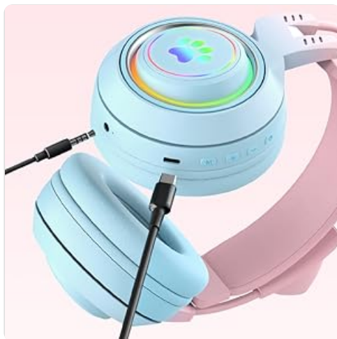
Figure 5: Charging Port and Audio Jack.