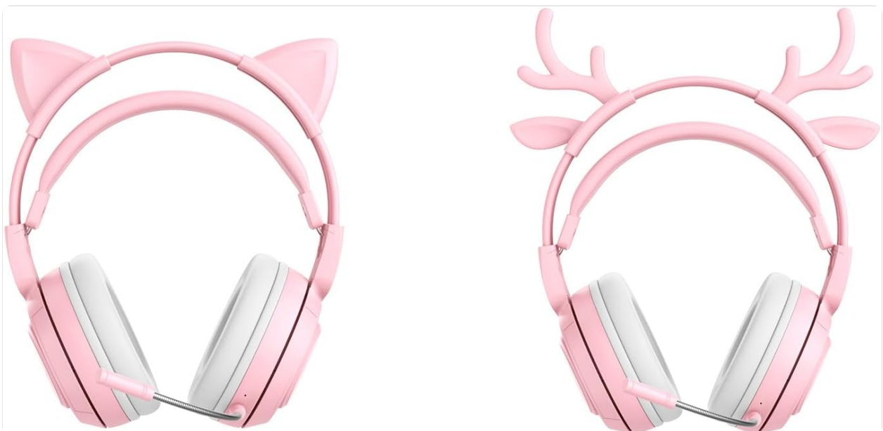
Figure 7: Cat Ears vs. Deer Ears.