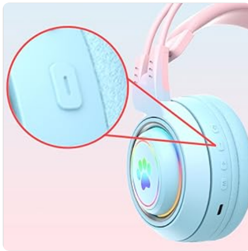
Figure 12: Volume Down Button.