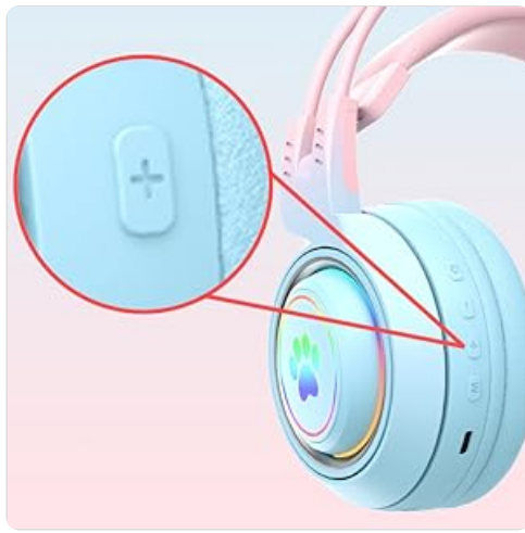
Figure 11: Volume Up Button.