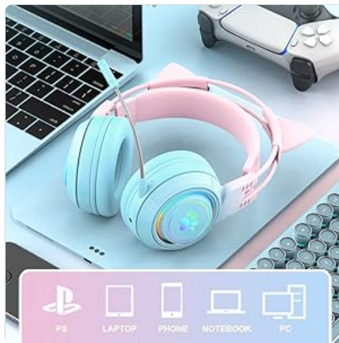
Figure 10: Wide Device Compatibility.

Note: When using a 3.5mm audio cable, the microphone is unavailable. The headset can still be charged in wired mode.