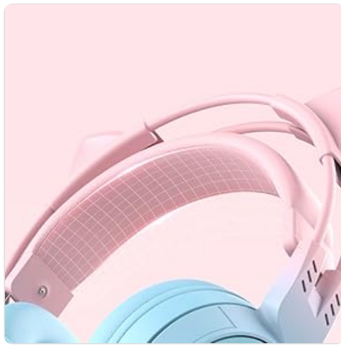
Figure 3: Adjustable Headband.