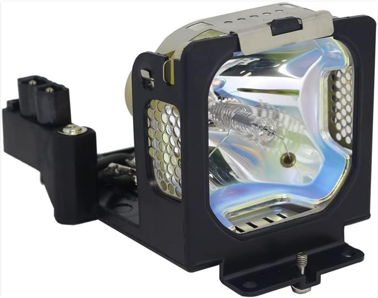
Figure 1: Front view of the Waaiyawa LV-LP18 / 9268A001AA Projector Lamp Assembly.