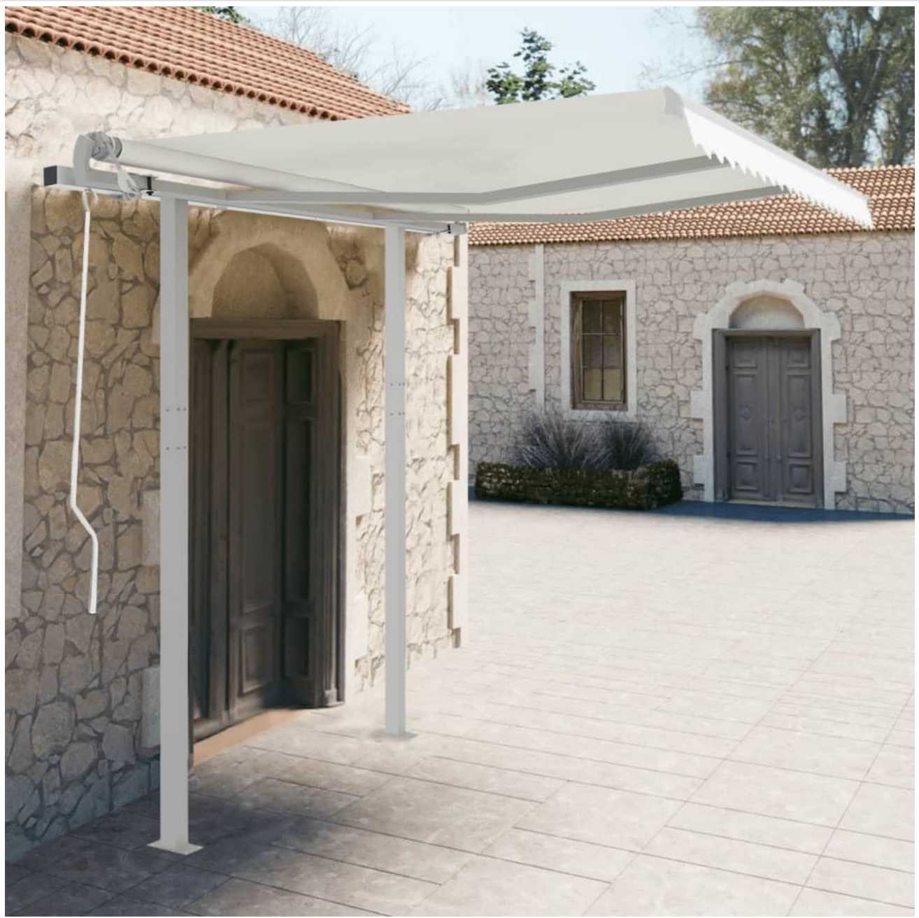
Image 2: The awning post set installed, supporting an awning in an outdoor setting.