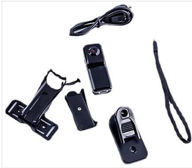
Figure 2.1: All components included in the MD80 Mini Camera package.