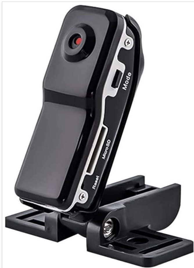
Figure 3.1: Front and side view of the MD80 Mini Camera, highlighting the Micro SD slot, Mode button, and Reset button.