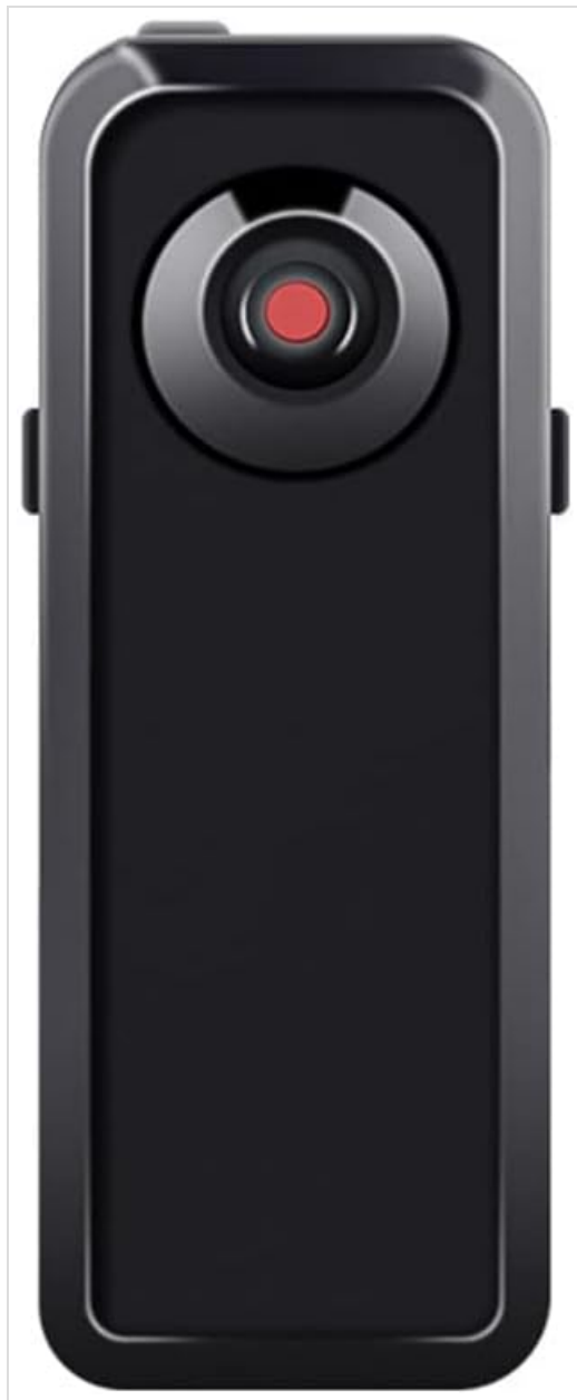
Figure 3.3: Frontal view of the MD80 Mini Camera, highlighting the lens.