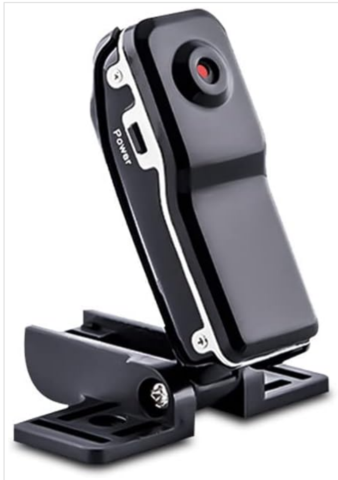
Figure 3.2: Side view of the MD80 Mini Camera, showing the Power button and USB port.