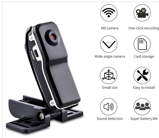
Figure 3.4: Visual representation of the MD80 Mini Camera's key features.