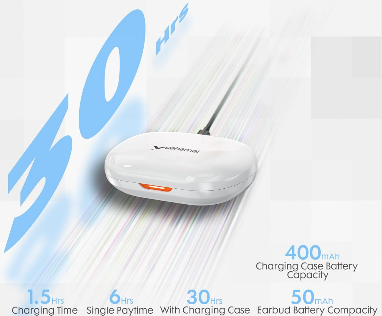
Image: The charging case displaying its battery capacity (400mAh) and earbud battery capacity (50mAh), along with charging times: 1.5 hours for charging, 6 hours single playtime, and 30 hours with the charging case.