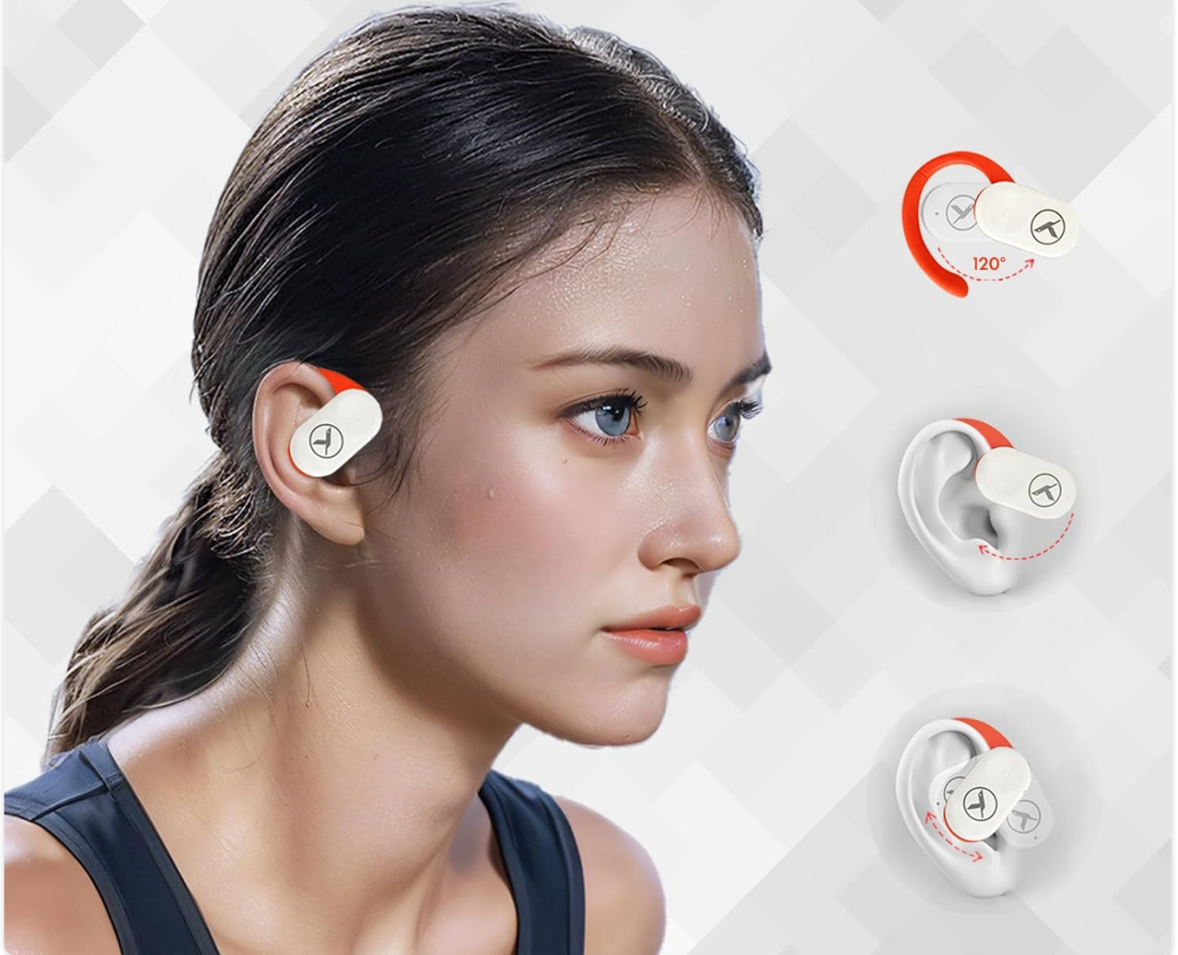
Image: A diagram illustrating the ergonomic design of the open-ear earbuds and how the 120° adjustable silicone ear hook provides a secure and comfortable fit around the ear.

Light Weight, Soft Silicone, 120 Degree Rotating Ergonomic Ear Hook , IPX4 Waterproof, Sweat Resistant for Perfect Fit.