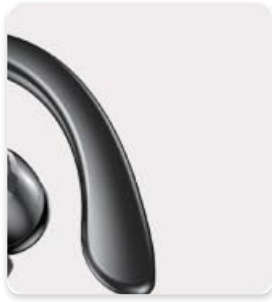
Image: A visual guide detailing the smart touch controls for the earbuds, including single-tap for play/pause, double-tap for switching songs or answering calls, holding for volume adjustment or rejecting calls, and triple-tap for game mode or voice assistant activation.