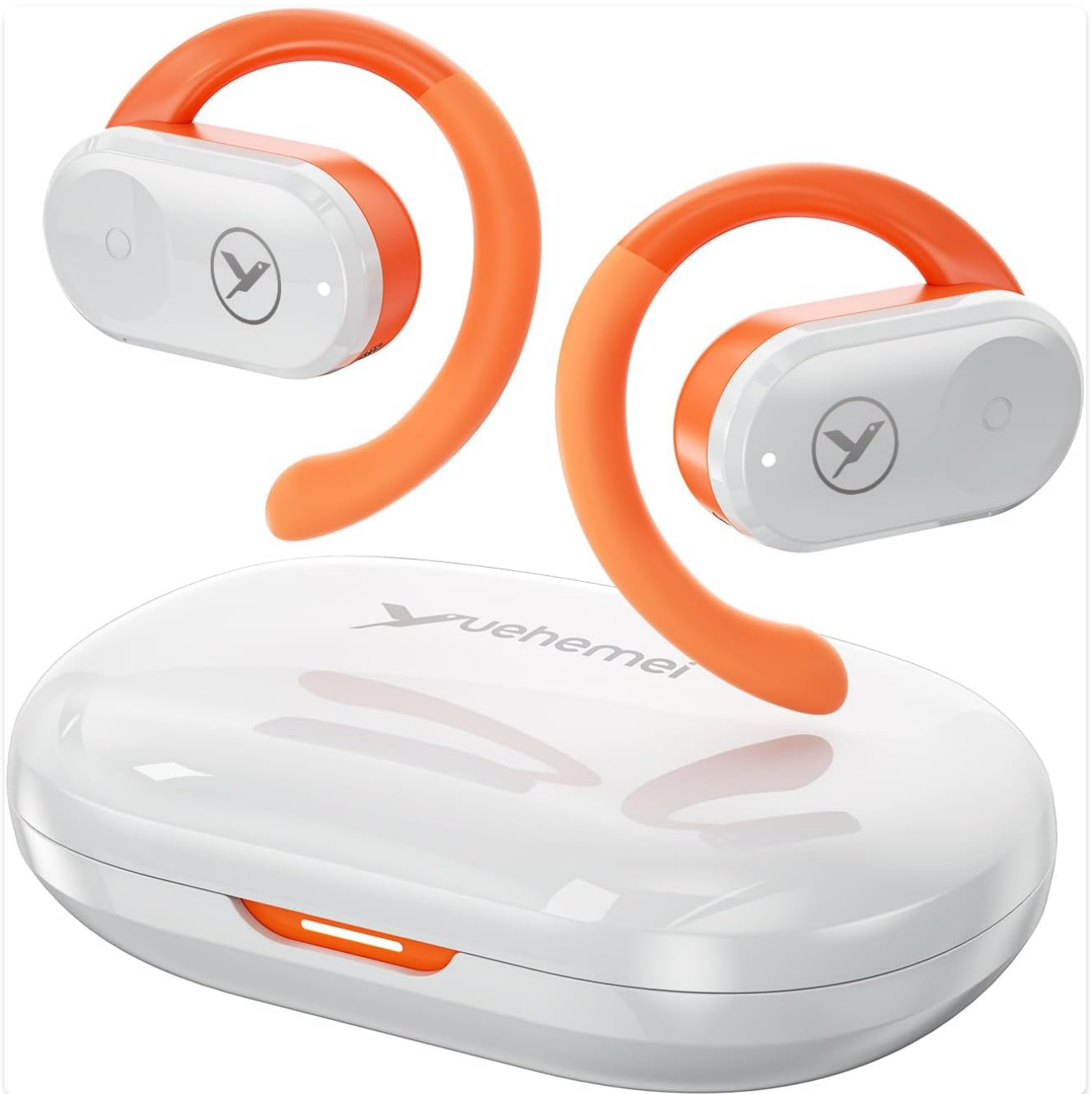
Image: The YUEHEMEI Q2 Open-Ear Headphones in White-Orange, shown with their compact charging case.