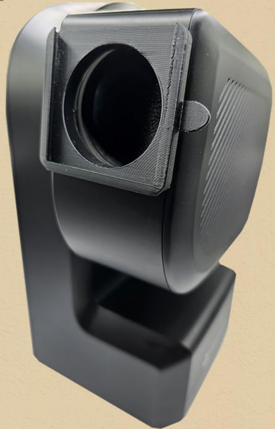
Image: The MASK PRO Holder shown from front, back, and side views, and installed on a ZWO Seestar S50 telescope.