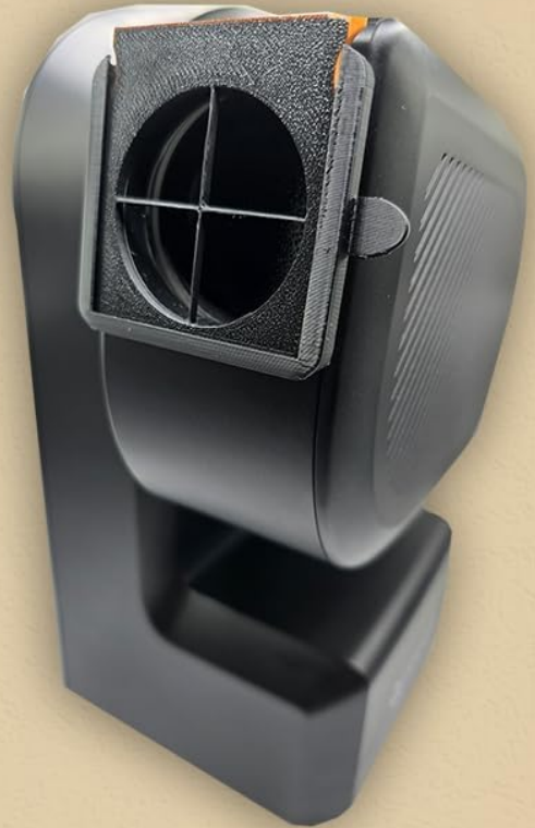
Image: The 4x Diffraction Spike Mask Slide, showing front and back, and its installation on the Seestar S50.

SIMPLY ALIGN YOUR SEESTAR TO A BRIGHT STAR, THEN SLIDE ON THE DIFFRACTION SLIDE, AND WOW!