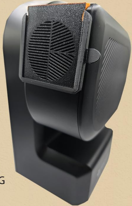
Image: The Bahtinov Mask Slide, showing front and back, and its installation on the Seestar S50 for focusing.

SIMPLY ALIGN YOUR SEESTAR TO A BRIGHT STAR, THEN SLIDE ON THE BHATINOV MASK SLIDE, ALIGN THE SPIKES BY ADJUSTING THE FOCUS, AND YOUR DONE.