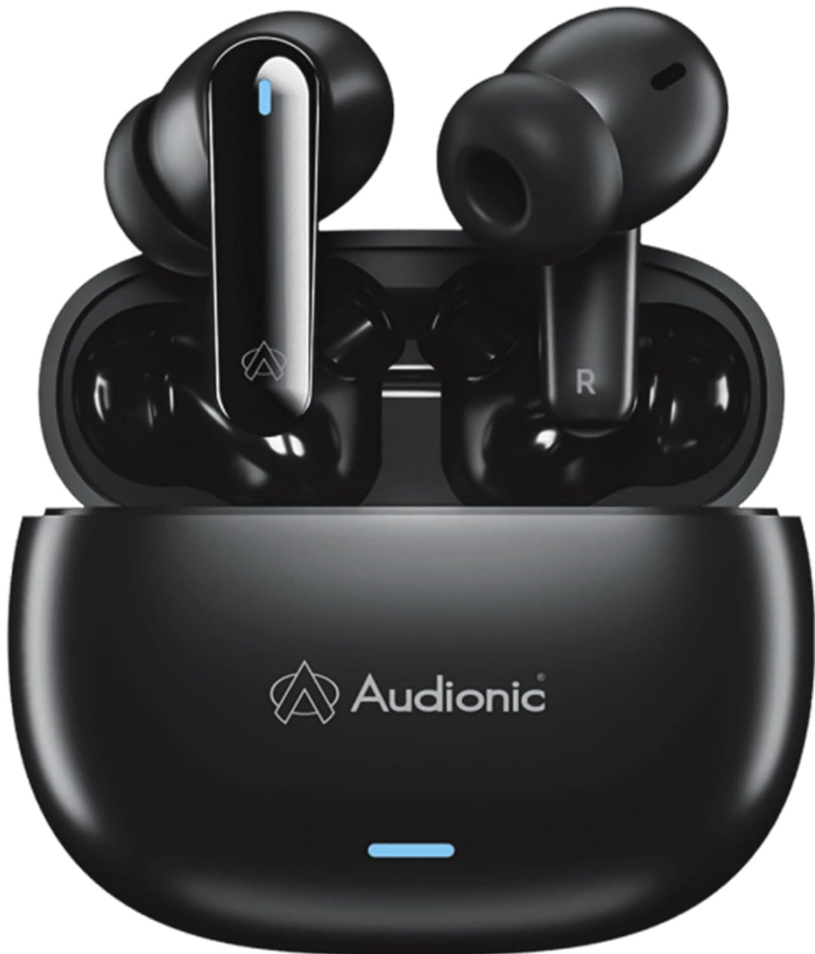
The Audionic Airbud 425 earbuds in their charging case.