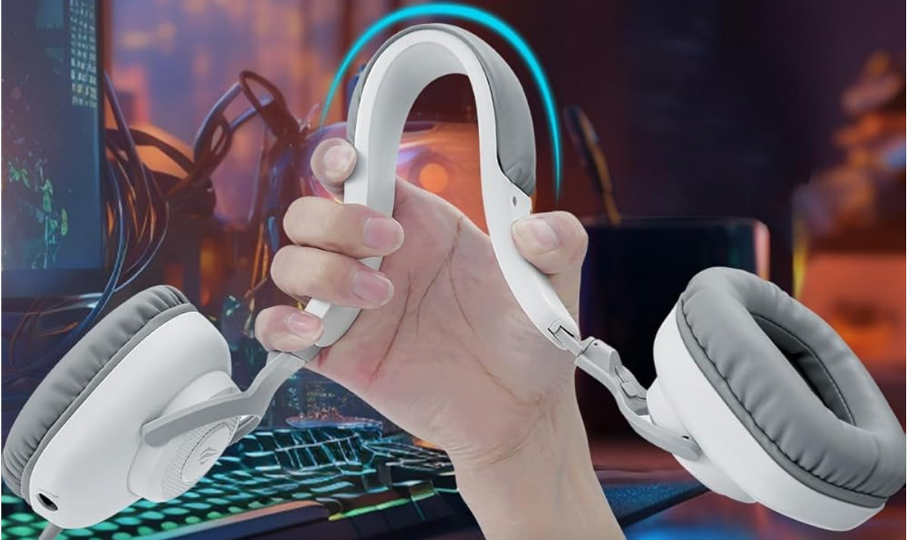
Illustration of the headset's flexible structure, demonstrating its durability and adaptability for various head sizes.