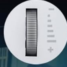
Ayarlanabilir Ses Seviyesi