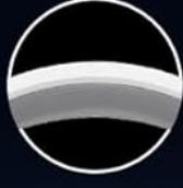
Koruyucu Kafa Bandı