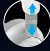
Ayarlanabilir Kafa Bandı