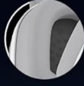
Hafızalı Kulaklık Pedleri