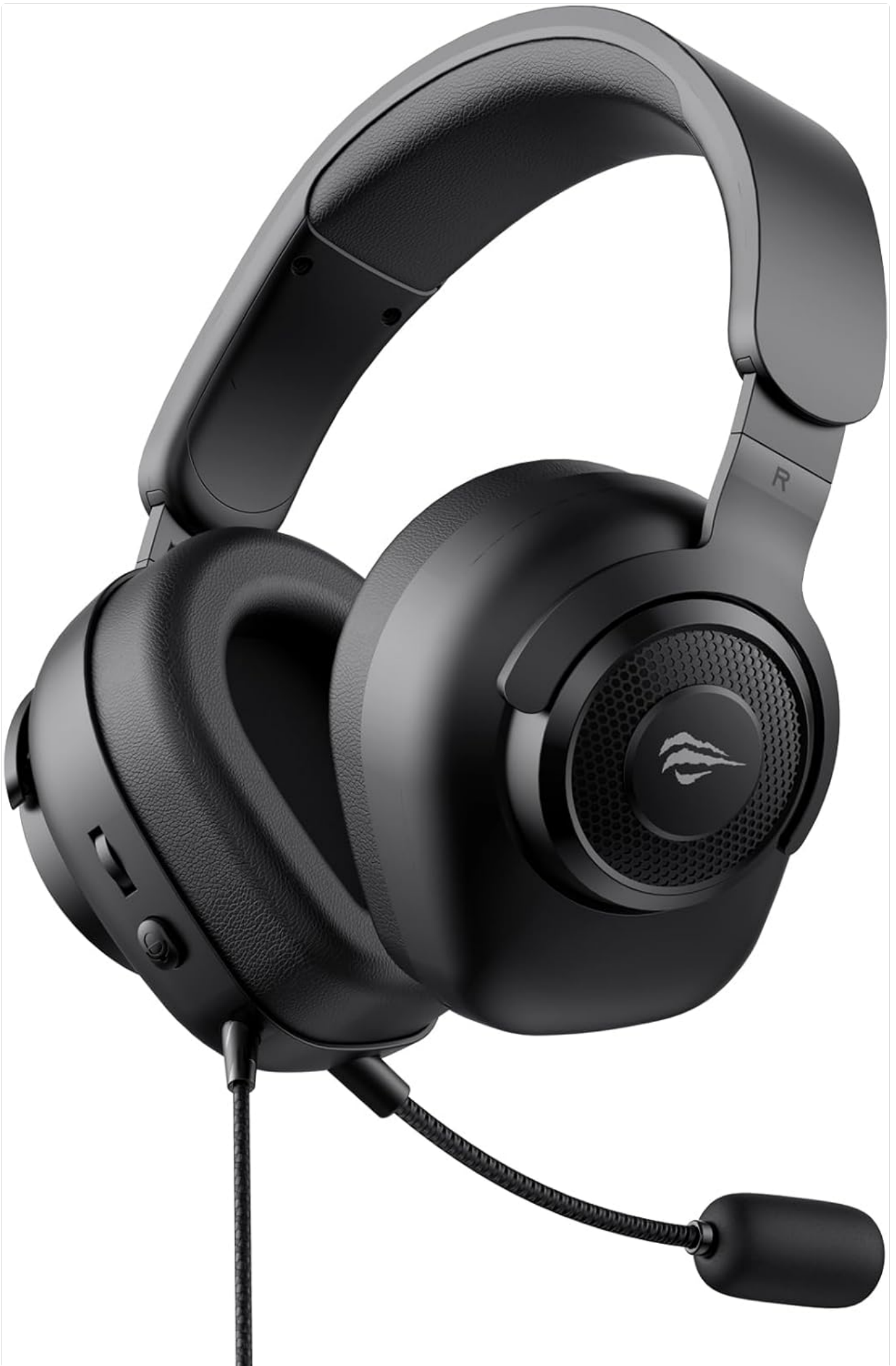
Front view of the Havit H2230D Gaming Headset, showcasing its sleek black design and integrated microphone.