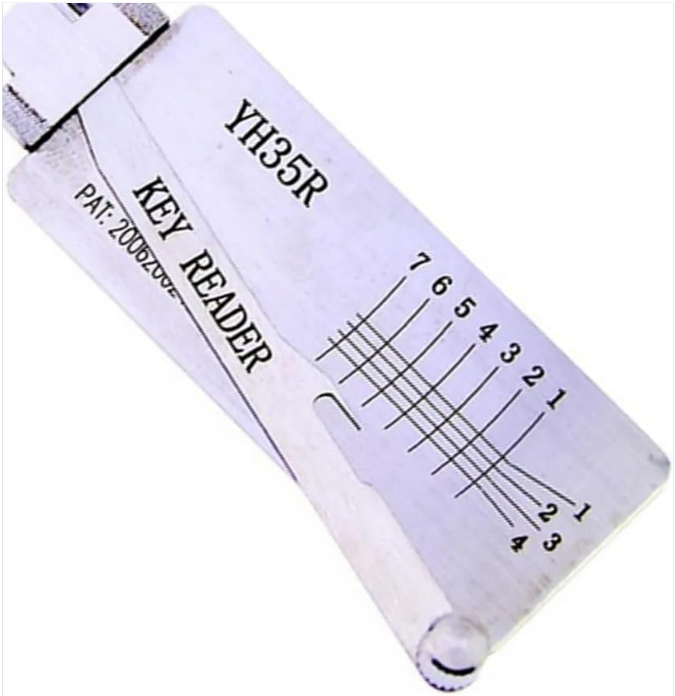
Figure 3: Another perspective of the YH35R tool, clearly showing the engraved decoding scale and pin positions.