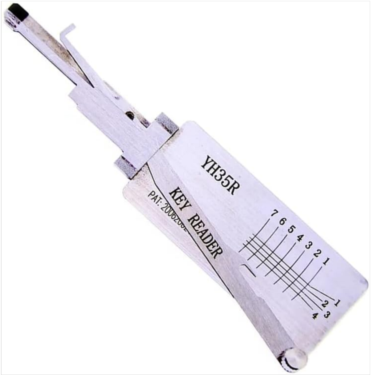
Figure 1: Main view of the YH35R LiShi Key Reader, showing its overall design and the decoding scale.