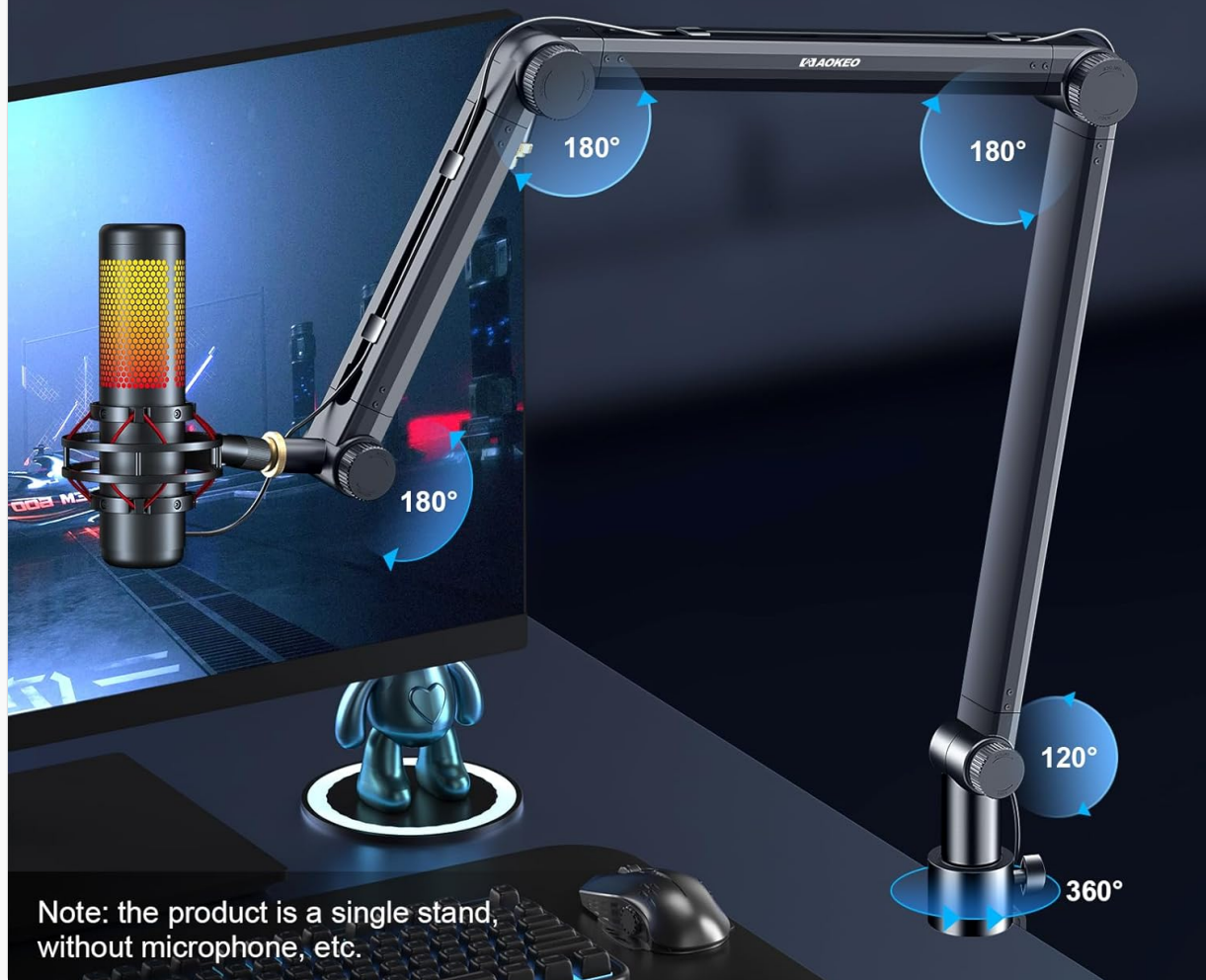
Figure 5: Flexible adjustment capabilities of the microphone arm.

After loosening the knob, you can adjust the angle of the mic stand