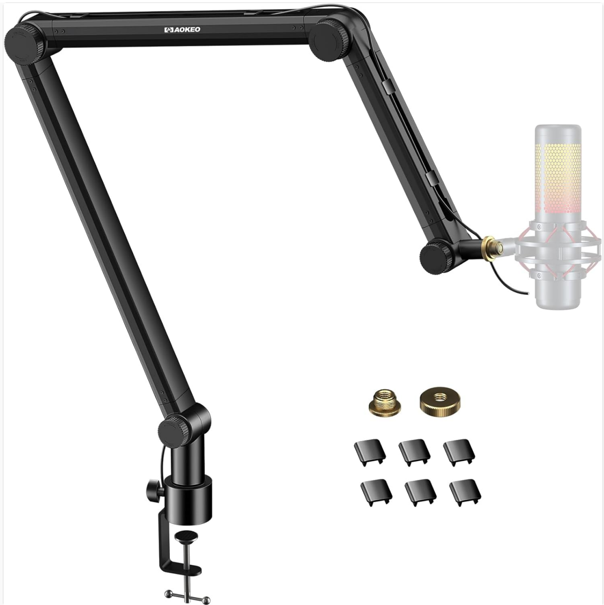
Figure 1: Aokeo AK-49 Microphone Arm with desk clamp and various adapters.