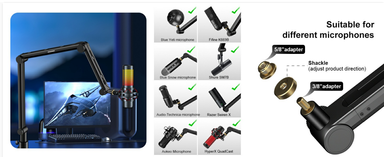
Figure 2: Detailed view of the microphone arm components and accessories.