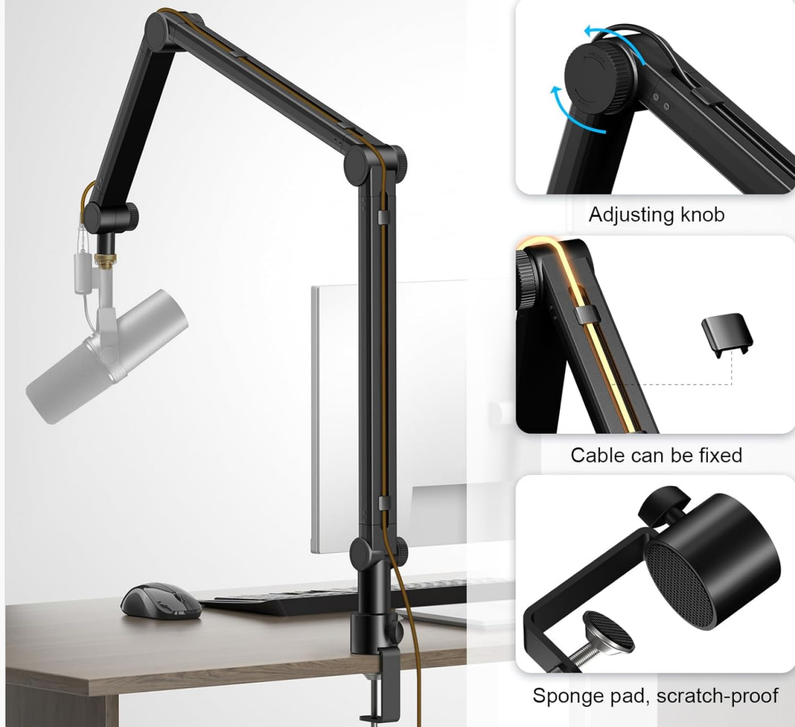
Figure 6: Detail of cable management and adjustment knob.