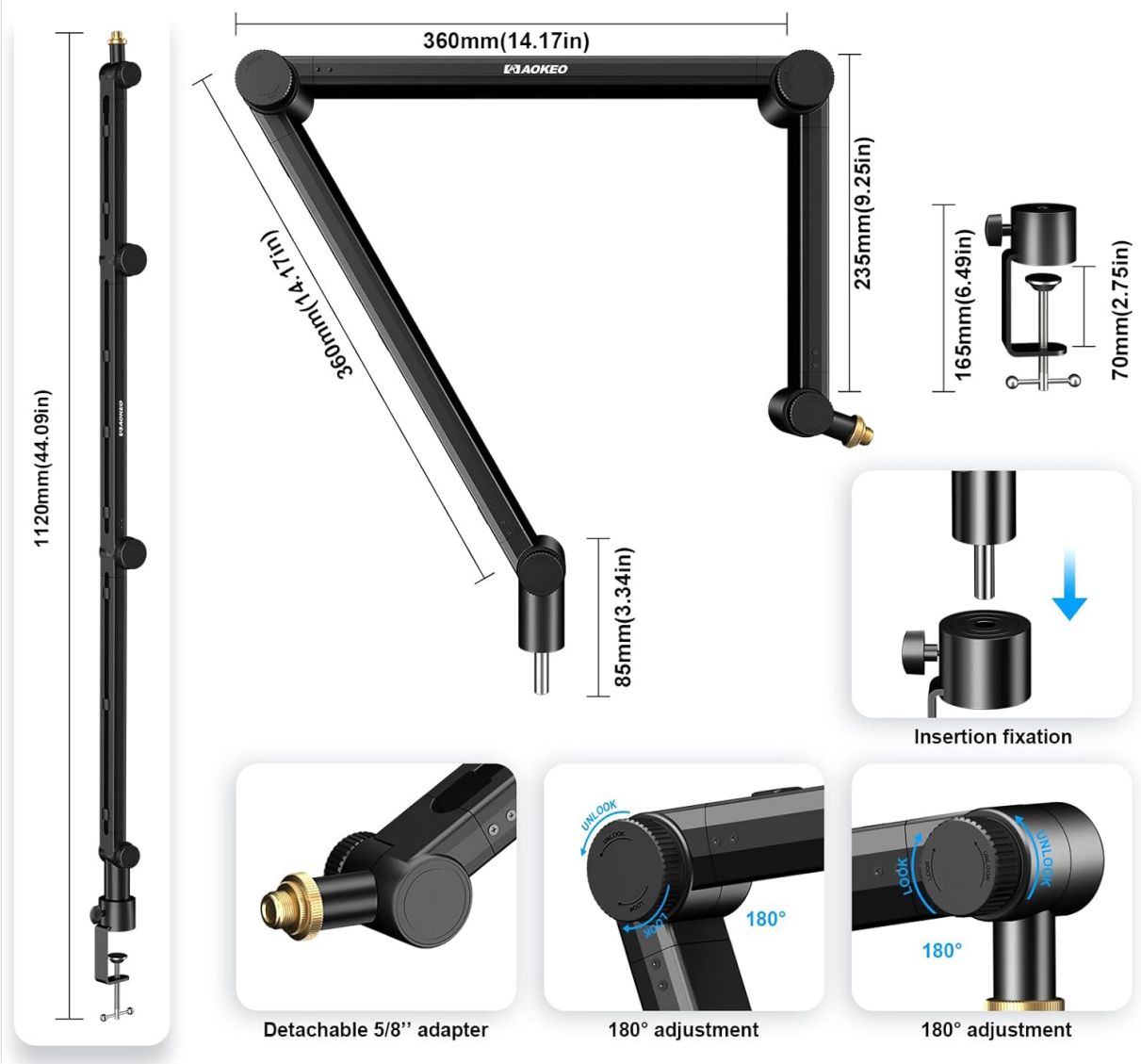
Figure 8: Product dimensions and key features.