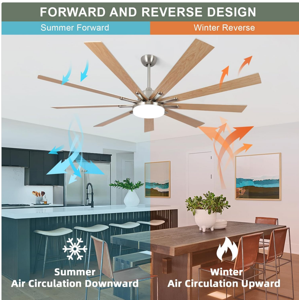
Figure 6.4: Explanation of the fan's reversible motor for year-round comfort.