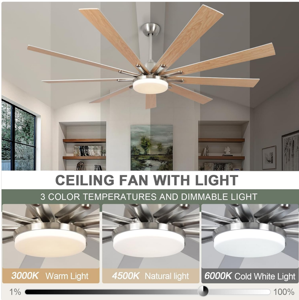
Figure 6.3: LED light features including color temperature and dimming capabilities.