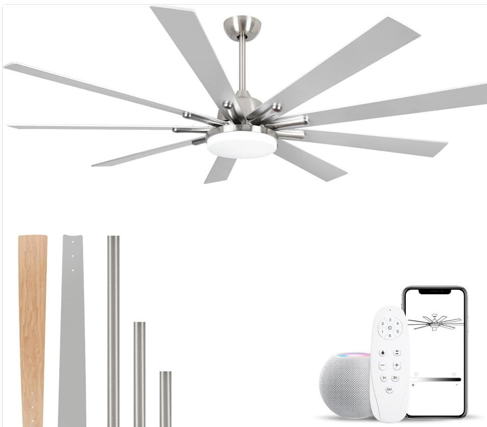
Figure 1.1: SODSEA 72-inch Outdoor Ceiling Fan with included accessories.

Thank you for choosing the SODSEA 72-inch Outdoor Ceiling Fan. This large, modern ceiling fan is designed to provide optimal air circulation and lighting for various spaces, including living rooms, bedrooms, patios, and more. Featuring a reversible DC motor, dimmable LED light with adjustable color temperatures, and multiple control options including remote, app, and voice control, this fan combines functionality with contemporary design.