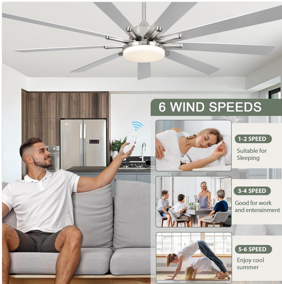
Figure 6.2: Fan speed recommendations for various activities.