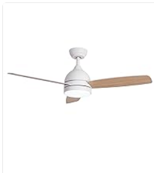
Figure 5.1: Fan blades with reversible finishes (light wood and brushed nickel).