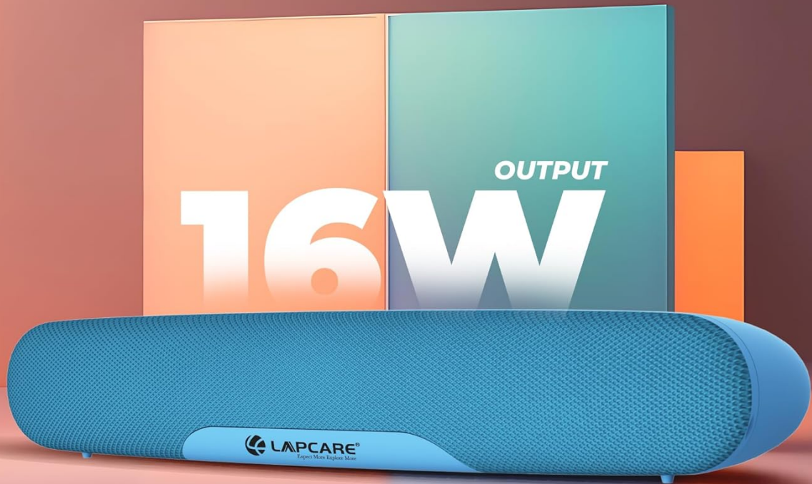
Image: The soundbar highlighting its 16W audio output capability.