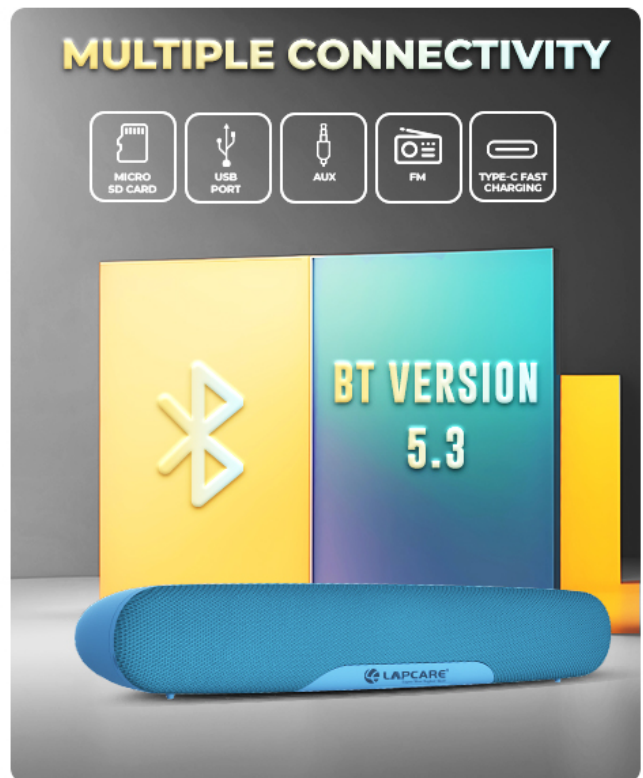
Image: Visual representation of multiple connectivity options including Bluetooth 5.3, Micro SD card, USB, AUX, and Type-C charging.