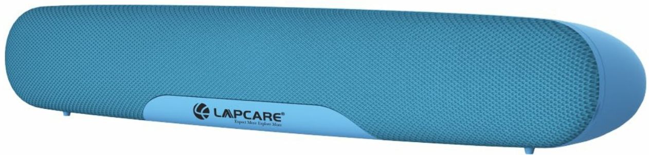
Image: The LAPCARE Musi Bar VI Soundbar, showcasing its compact design and blue color.