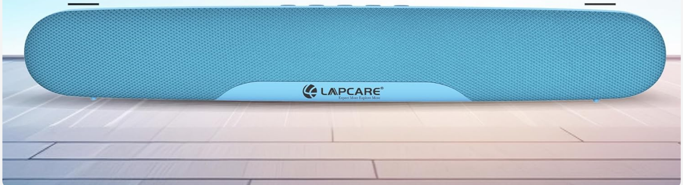
Image: The soundbar illustrating its extended playback time of up to 8 hours.