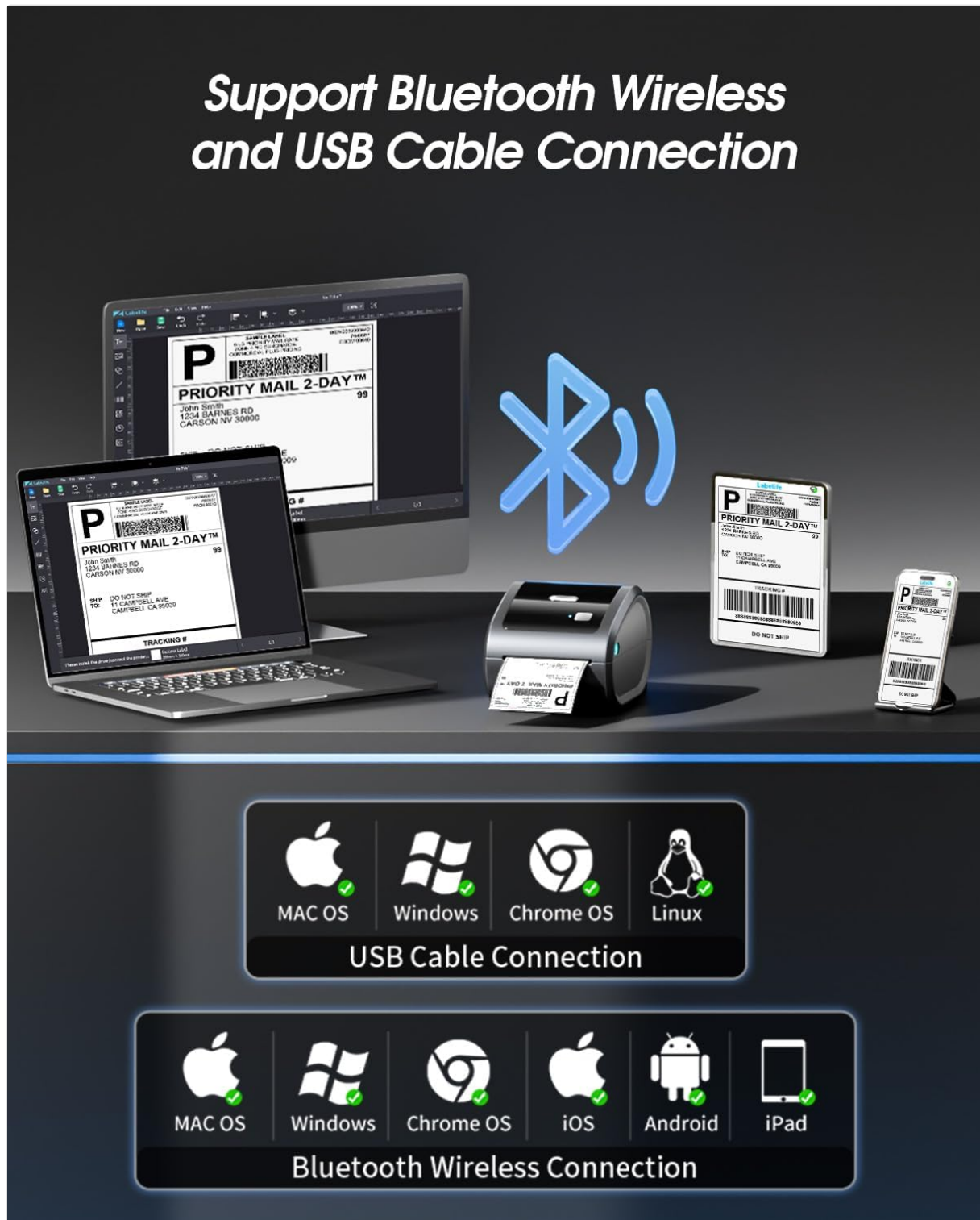
Image: Diagram illustrating the memolife D520-BT printer's Bluetooth and USB connectivity with various devices including laptops, tablets, and smartphones. This diagram highlights the versatile connectivity options of the memolife D520-BT printer. It shows the printer wirelessly connected via Bluetooth to iOS and Android phones and tablets, and connected via USB cable to Mac OS, Windows, Chrome OS, and Linux computers.