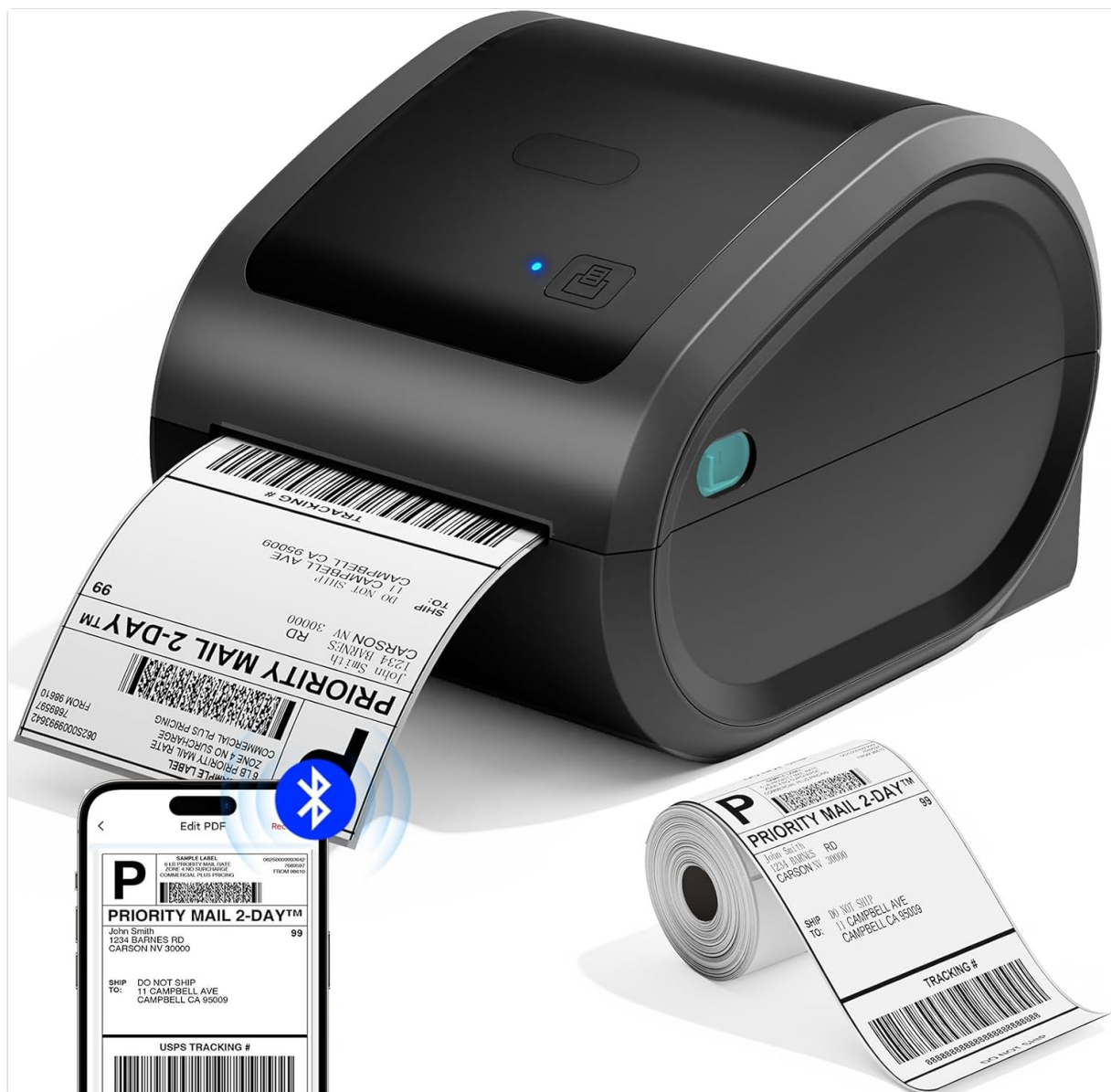
Image: memolife D520-BT Bluetooth Thermal Label Printer actively printing a shipping label, with a roll of labels beside it. This image shows the memolife D520-BT thermal label printer in operation, with a 4x6 shipping label emerging from the front slot. A roll of blank labels is positioned to the right of the printer. The printer is black with a blue indicator light.