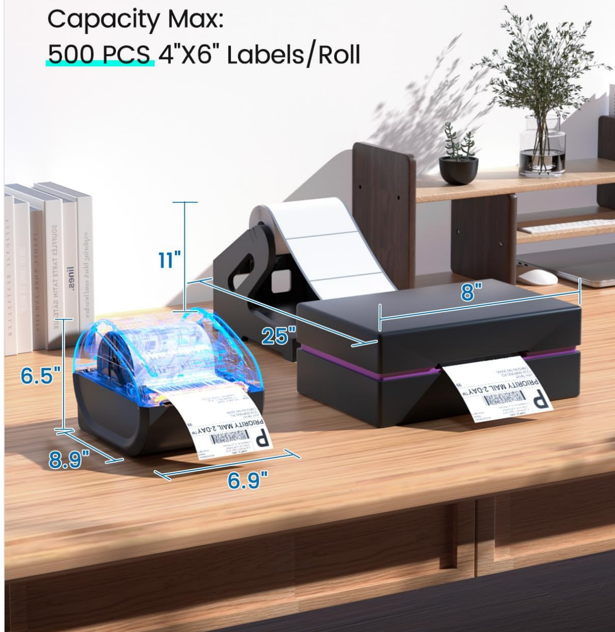
Image: Illustration of the memolife D520-BT thermal label printer's compact design and built-in label holder, demonstrating its space-saving benefits on a desk. This image shows the compact dimensions of the memolife D520-BT printer, emphasizing its built-in label holder which helps save desktop space. It compares its size to other label holders, highlighting its integrated design.