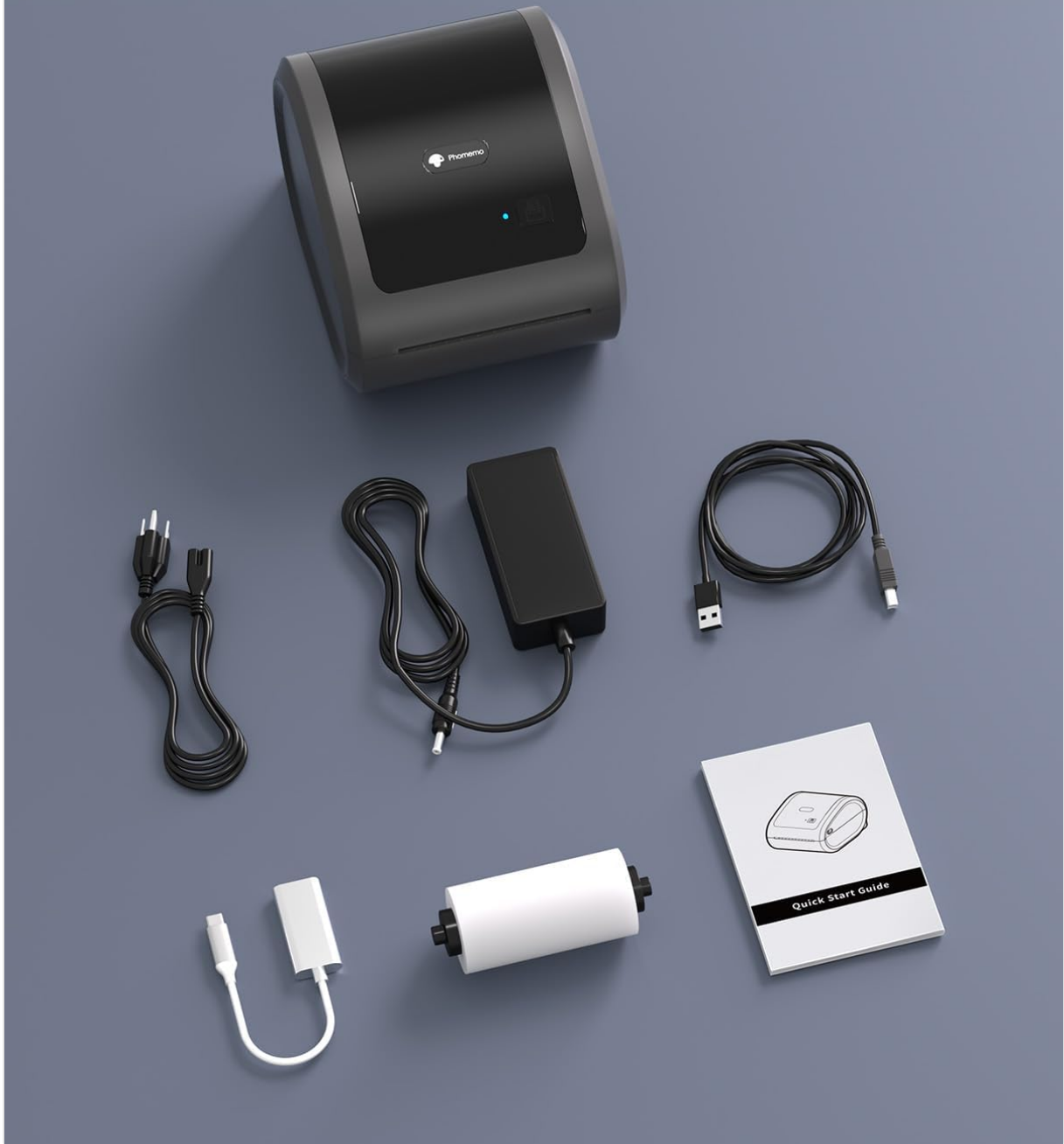
Image: Contents included in the memolife D520-BT Bluetooth Thermal Label Printer package. This image displays all items included with the printer: the D520-BT printer unit, a power cord and adapter, a USB-C adapter for Mac OS, a quick start guide, and a roll of 4x6 shipping labels with a label holder.