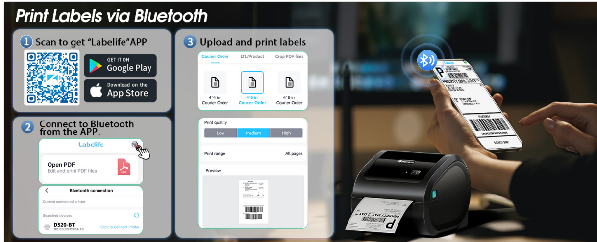
Image: Step-by-step guide on how to print labels via Bluetooth using the 'Labelife' app with the memolife D520-BT printer, including QR codes for app download. This image provides a three-step guide for Bluetooth printing: 1. Scan QR codes to download the 'Labelife' app (available on Google Play and App Store). 2. Connect to Bluetooth from within the app. 3. Upload and print labels, with options for print quality and preview.