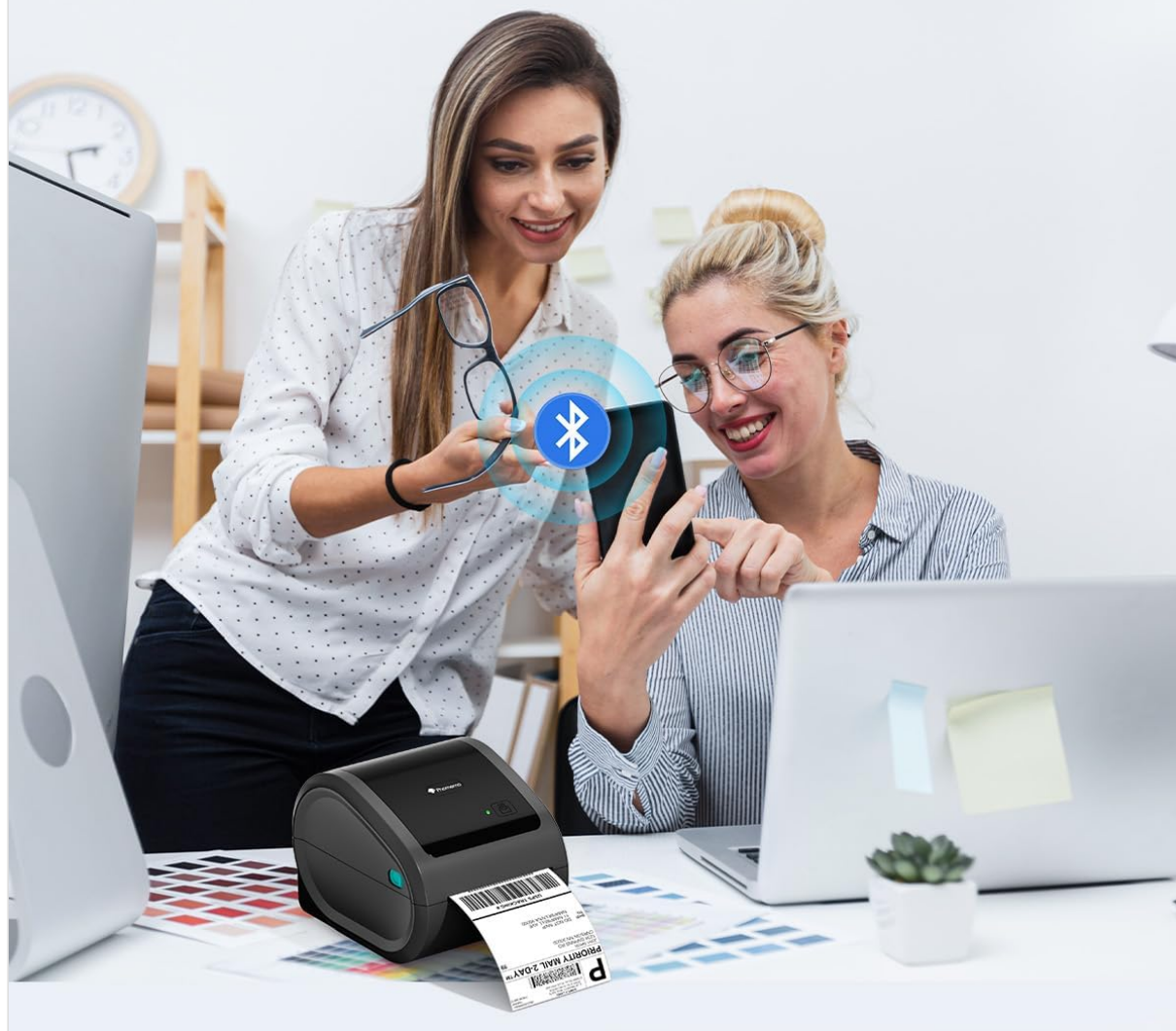
Image: Image demonstrating the 'Labelife' app's support for DIY label creation and PDF printing with the memolife D520-BT printer. This image shows a laptop and a smartphone connected to the memolife D520-BT printer, illustrating how the 'Labelife' app allows users to design custom labels and print PDF documents wirelessly.