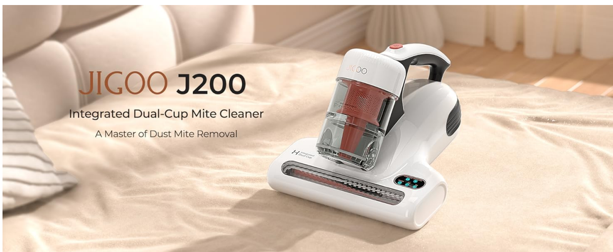
Figure 6: The device reaches a constant 55°C (140°F) in seconds to reduce mite activity and dehumidify.