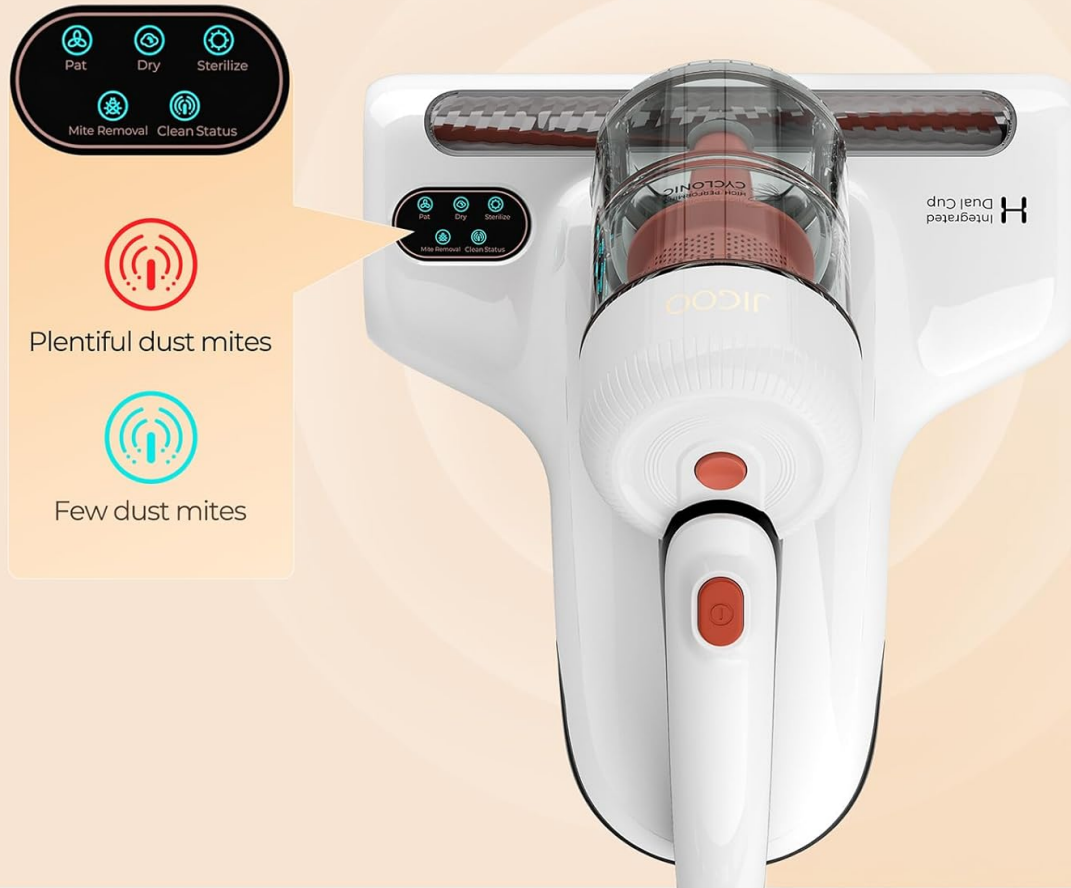
Figure 4: Smart display showing dust mite levels (red for plentiful, green for few).

Intelligent monitoring of dust mite levels to ensure timely and effective mattress cleaning