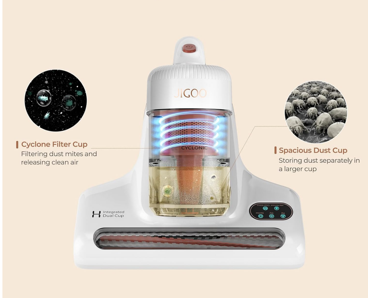
Figure 7: Diagram illustrating the patented integrated dual-cup system for efficient dust collection and filtration.

A Lighter build, higher filtration efficiency, and larger capacity to collect allergens!