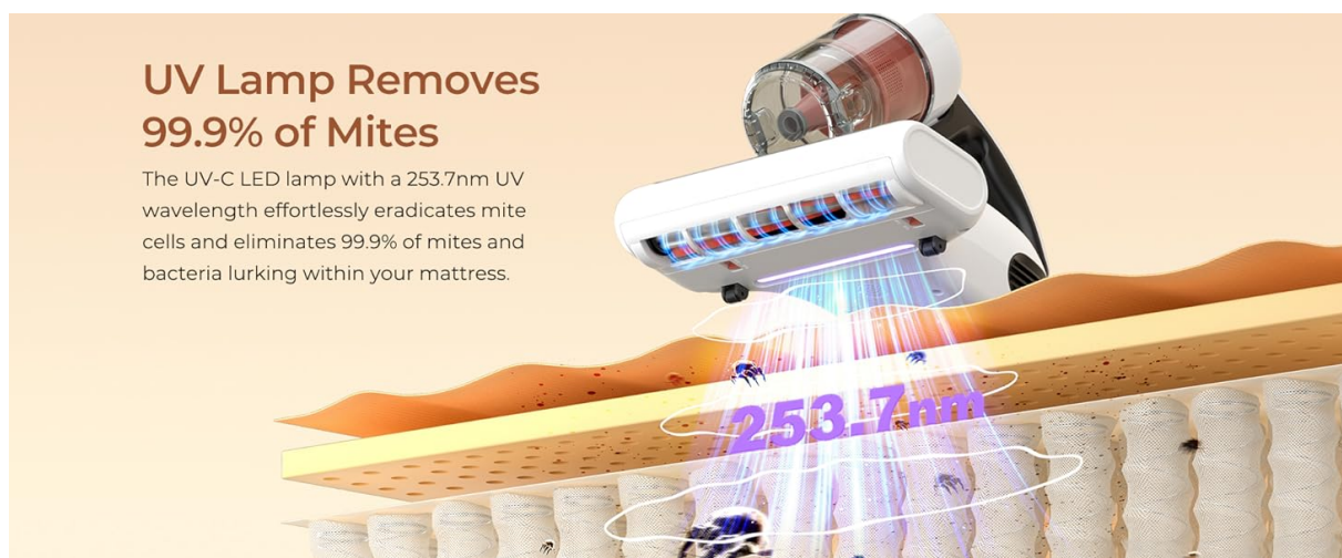
Figure 2: Key features of the JIGOO J200, including dual-cup integration and smart display.

The UV-C LED lamp with a 253.7nm UV wavelength effortlessly eradicates mite cells and eliminates 99.9% of mites and bacteria lurking within your mattress.