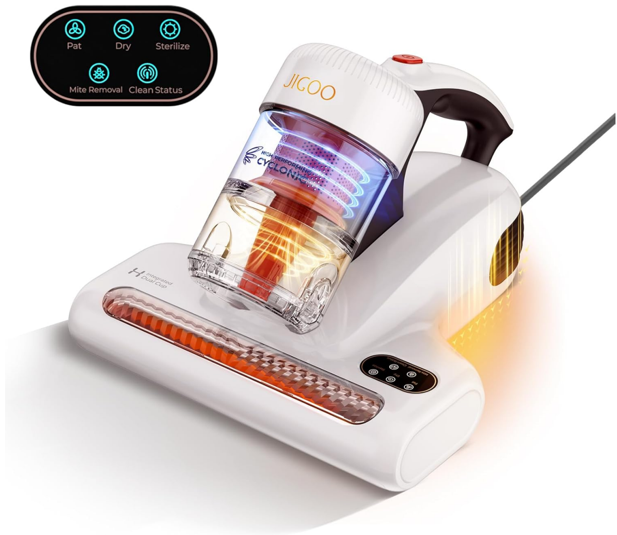
Figure 1: JIGOO J200 Mattress Vacuum Cleaner

Key features include a 500W motor with 13Kpa suction, a smart display for monitoring dust mite levels, and a patented integrated dual-cup system for efficient filtration.