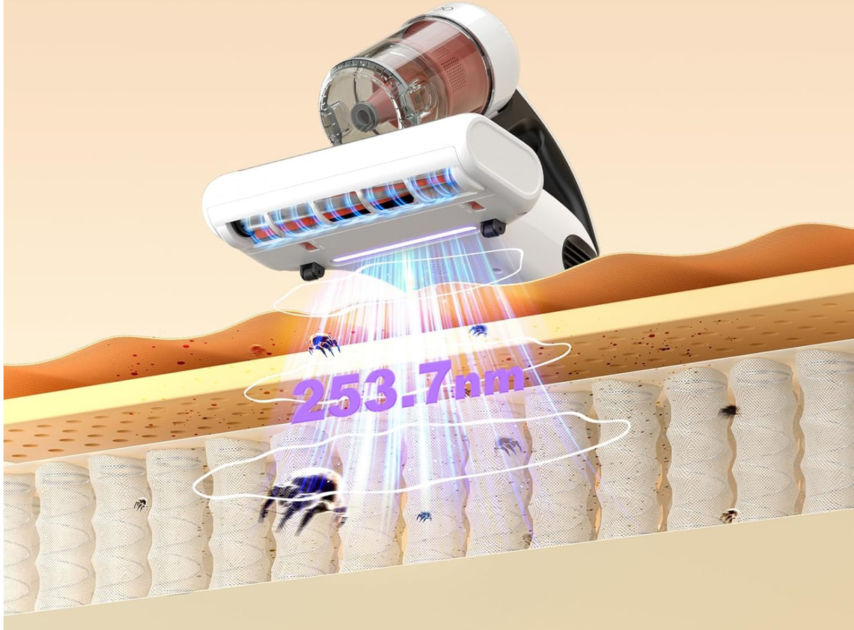
Figure 5: UV-C LED lamp with 253.7nm UV wavelength for mite and bacteria elimination.

The UV-C LED lamp with a 253.7nm UV wavelength effortlessly eradicates mite cells and eliminates 99.9% of mites and bacteria lurking within your mattress.