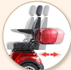
Seat Forward Backward Adjustment