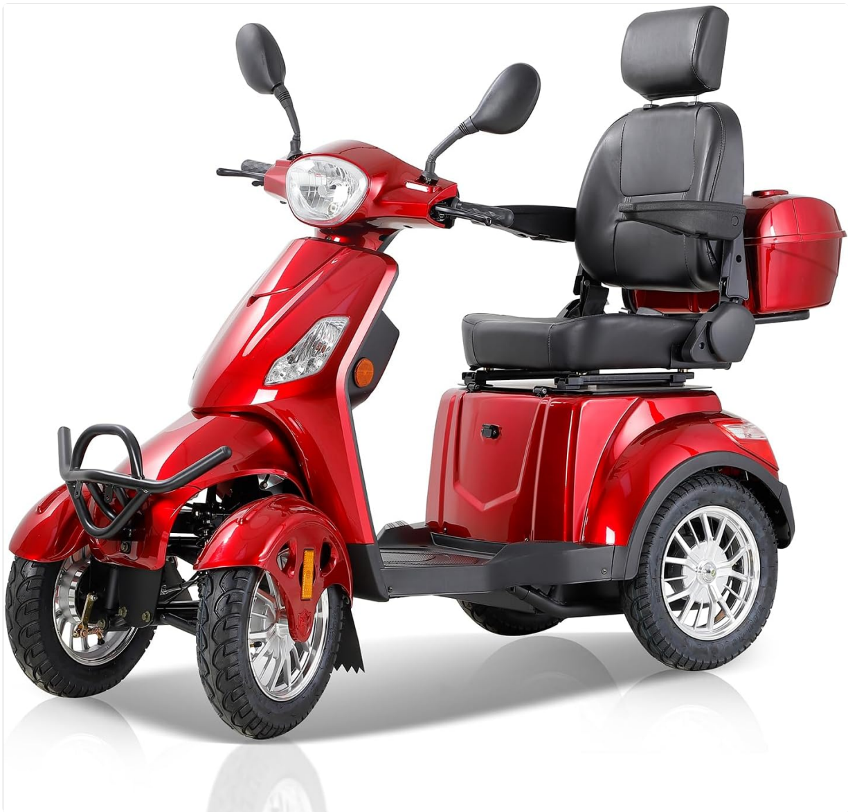
Image 1.1: The ZVGREEN XL-4L Heavy-Duty Four-Wheel Mobility Scooter.