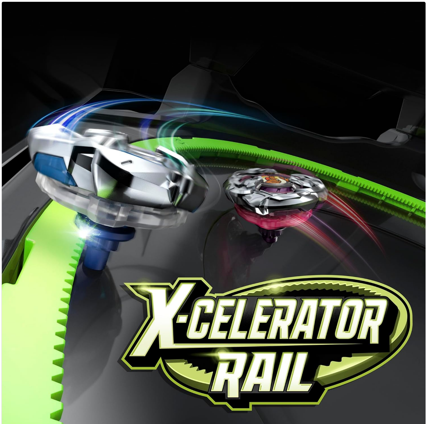
Figure 5: Beyblade X top engaging the X-Celerator Rail for an Xtreme Dash.