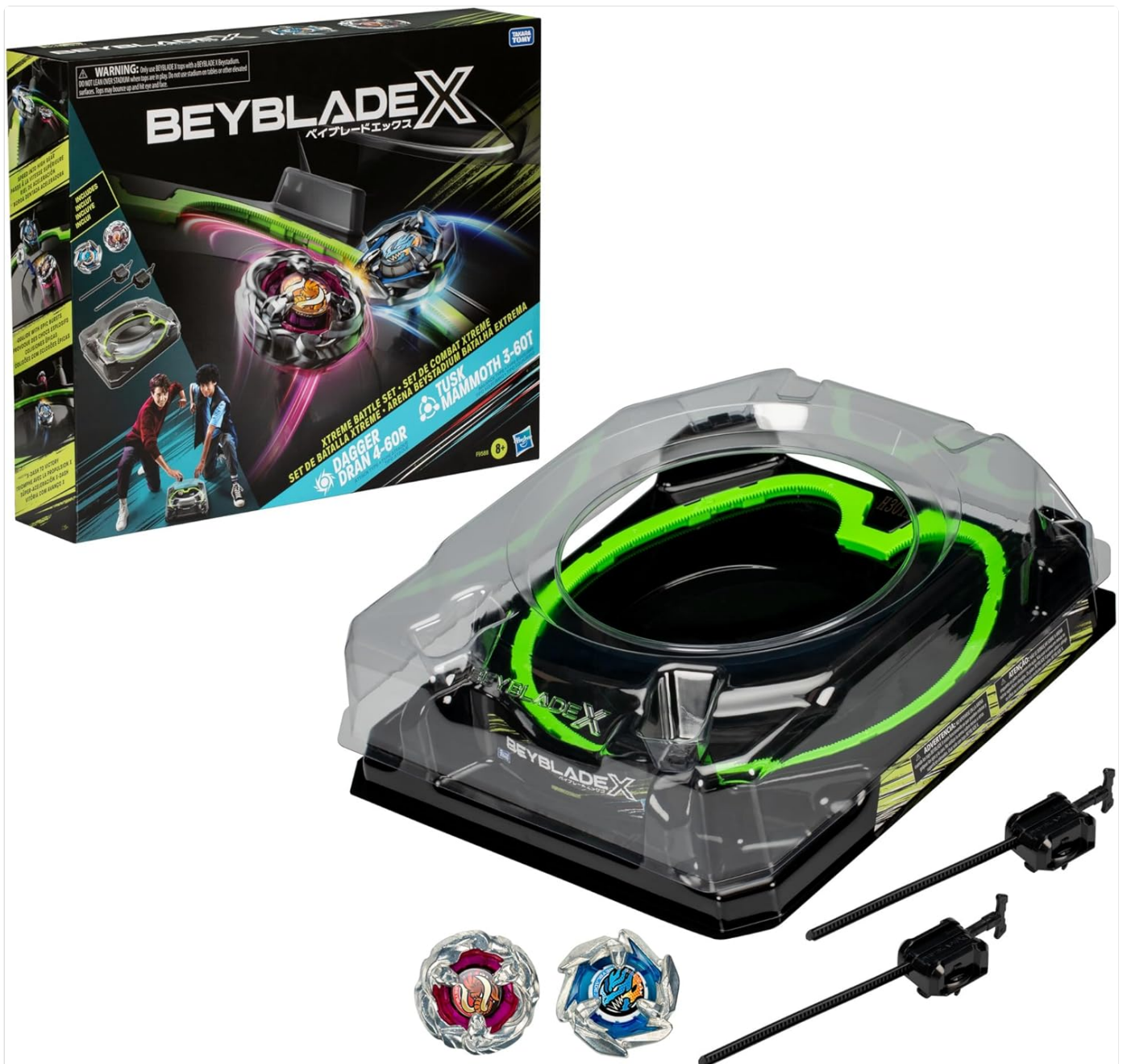
Figure 1: All components included in the Beyblade X Xtreme Battle Set.