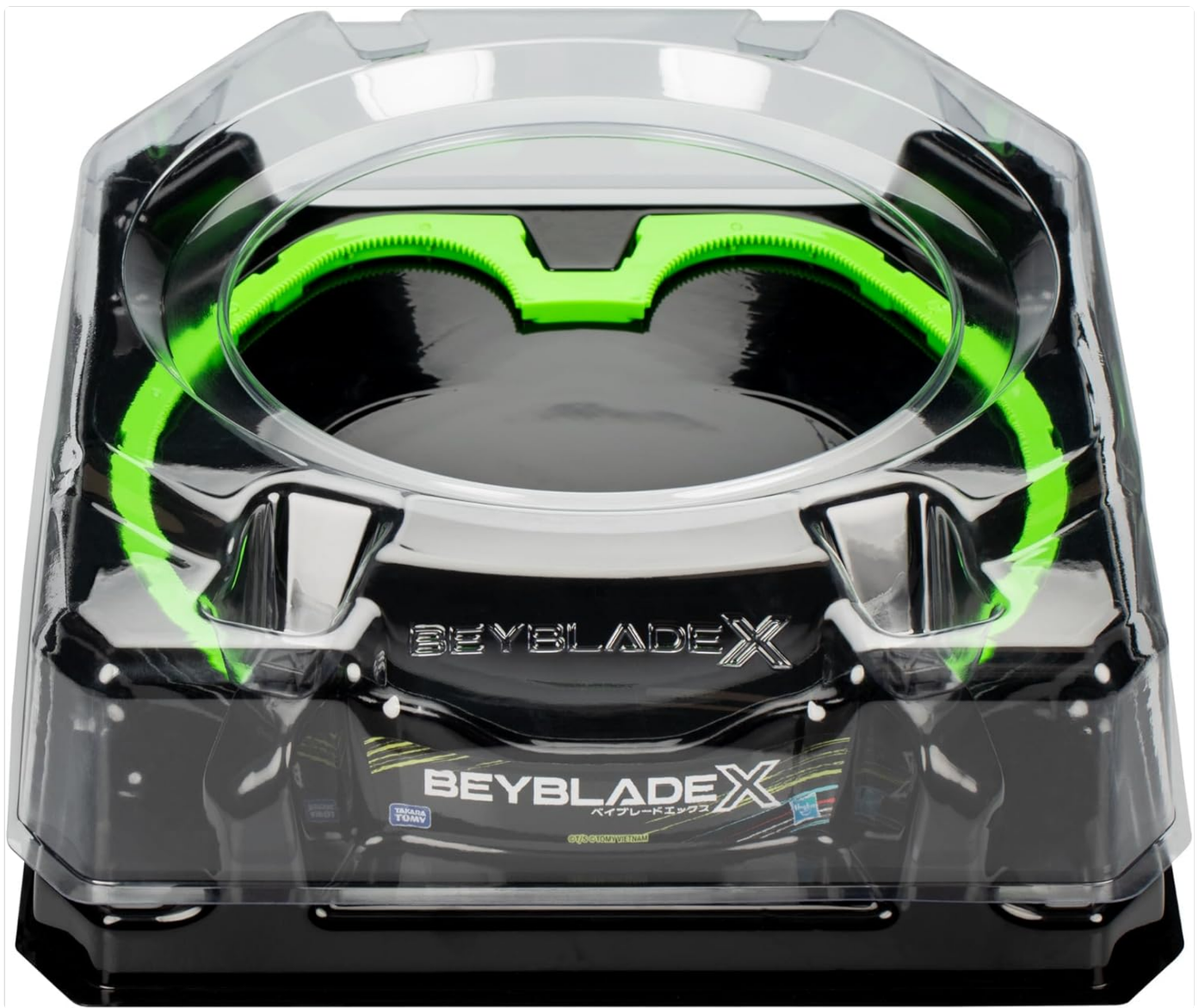
Figure 2: The Xtreme Beystadium with its X-Celerator Rail.