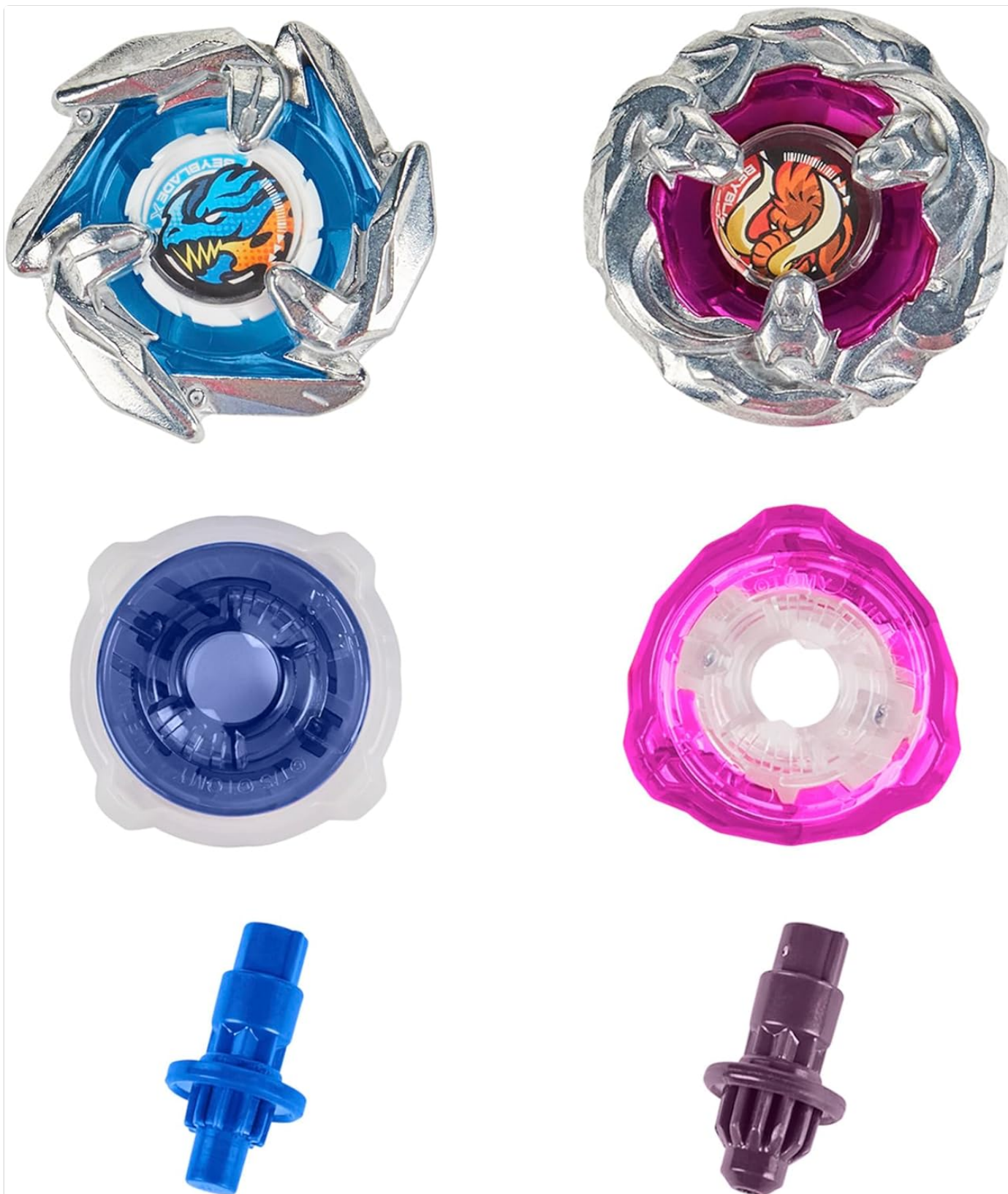
Figure 3: Beyblade X top components before assembly.