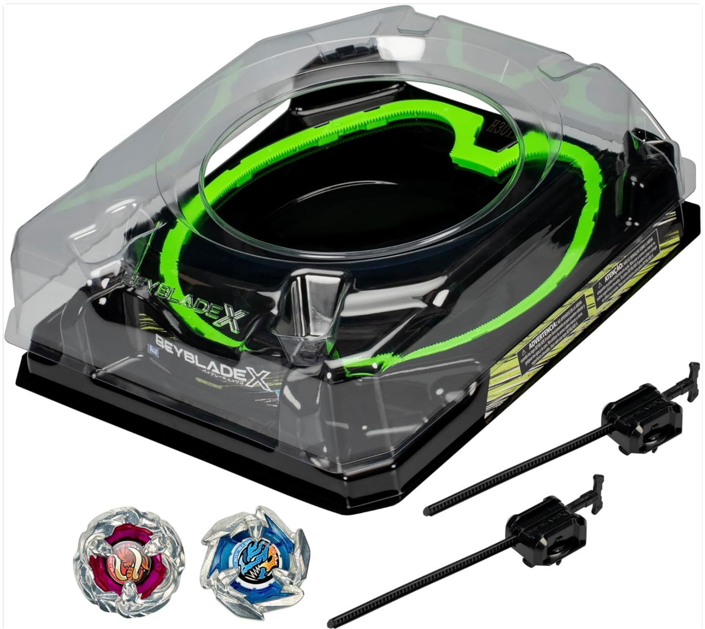
Figure 6: Beyblade X scoring system.