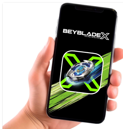
Figure 7: Connect your Beyblade X tops to the official app.

Enhance your Beyblade X experience by connecting with the official Beyblade X app. Scan the code on your Beyblade X toy top to unlock it in the app and engage in virtual battles with other Bladers worldwide. The app provides an additional layer of competitive play and community interaction.