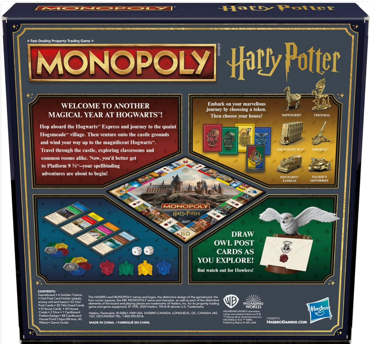
Image: Back view of the game box, displaying the game board layout, golden tokens, Owl Post card holder, and other game components.