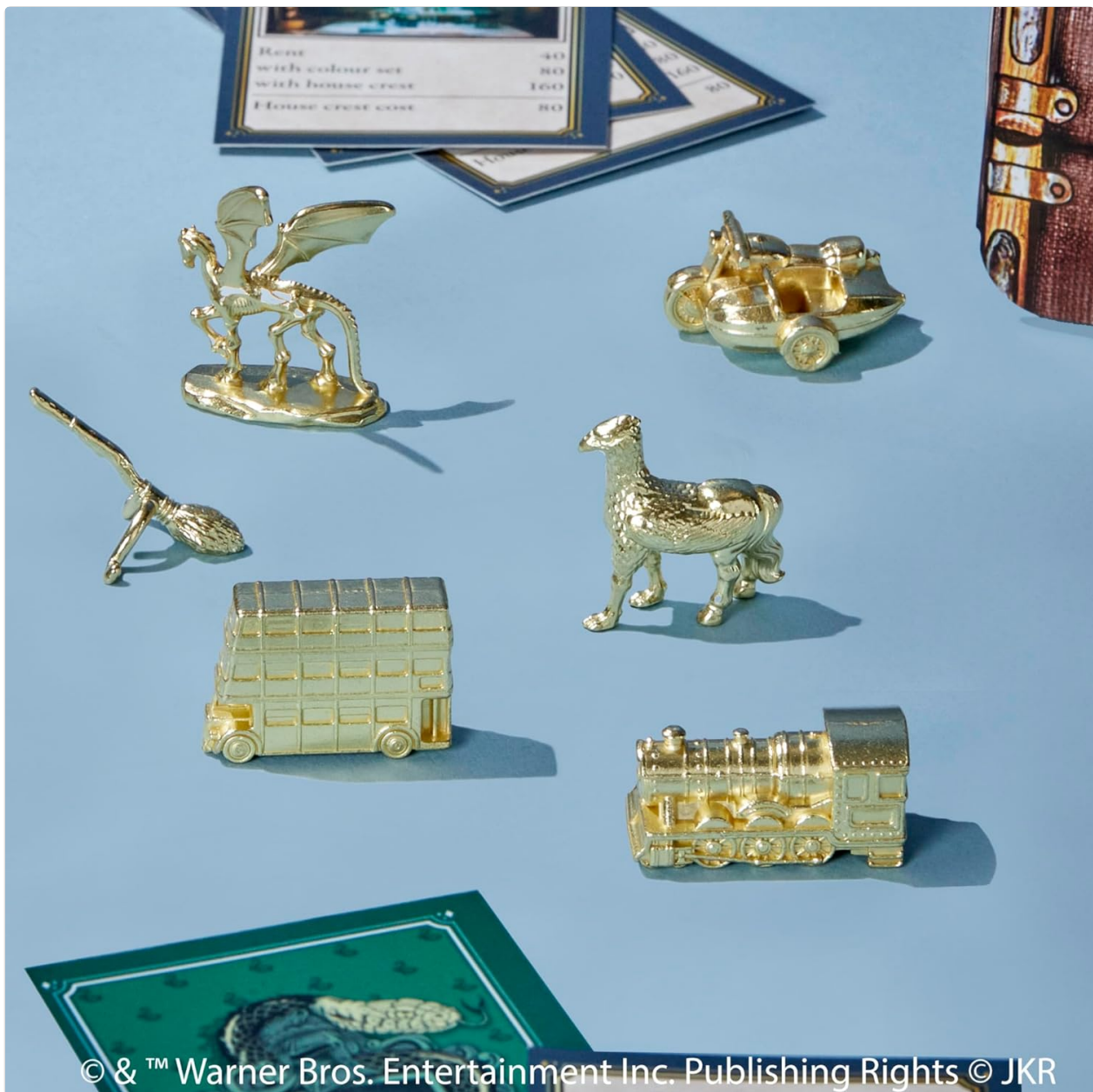
Image: A close-up of the six golden tokens: Hippogriff, The Knight Bus, Hogwarts Express, Hagrid's Motorbike, Thestral, and Firebolt.