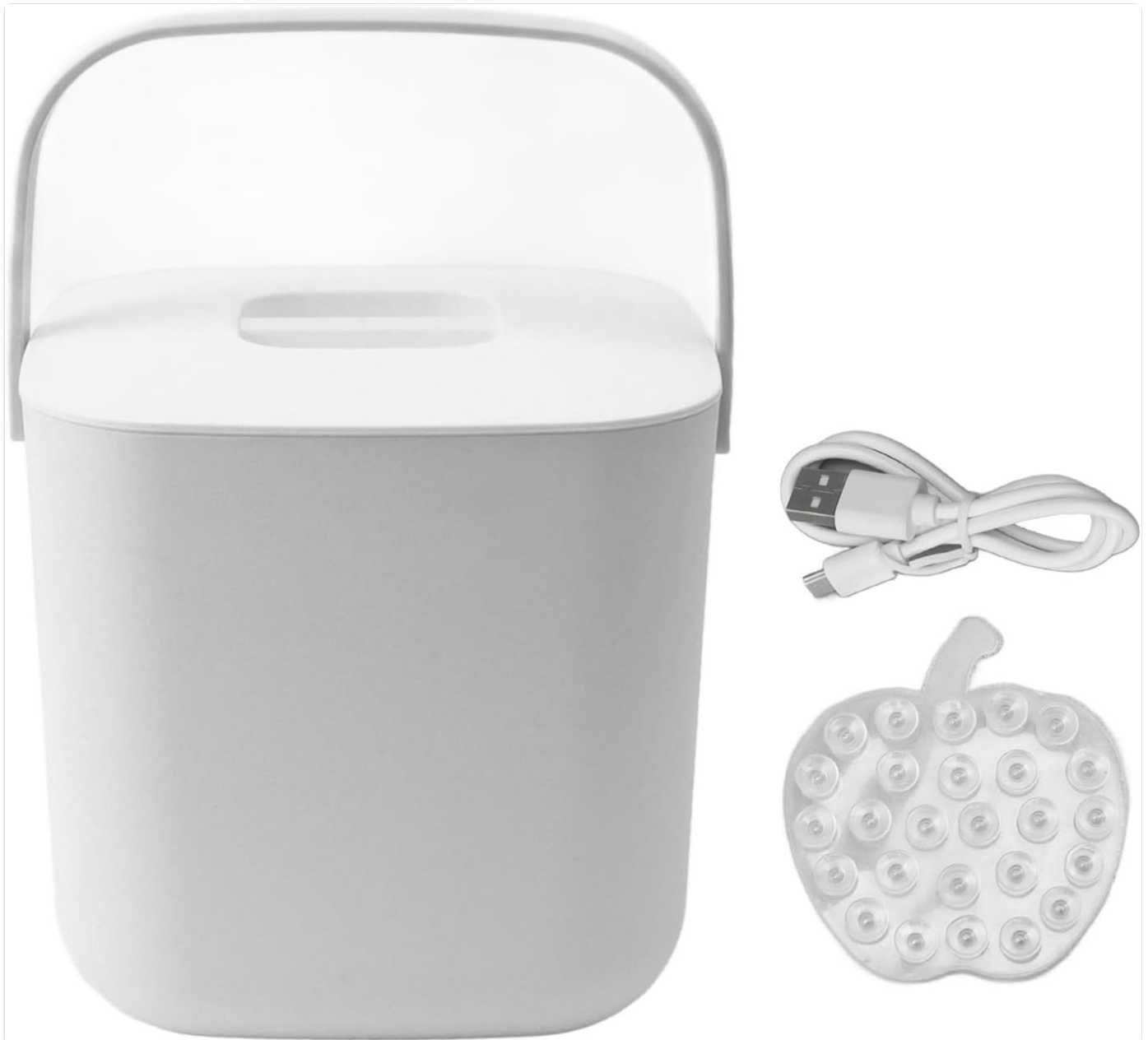
Image 3.1: Included components: Bucket with Lid, USB Cable, and Sucker.