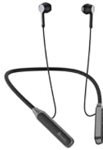
Image: A detailed diagram illustrating the power button, volume controls, microphone, and touch control functions on the Hmusic H23 neckband headphones.