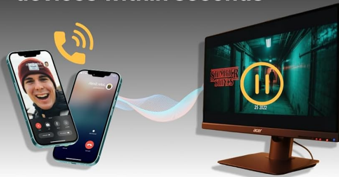
Image: Visuals demonstrating the Hmusic H23 headphones' ability to pair with two devices simultaneously and their low-latency Game Mode for enhanced gaming audio.