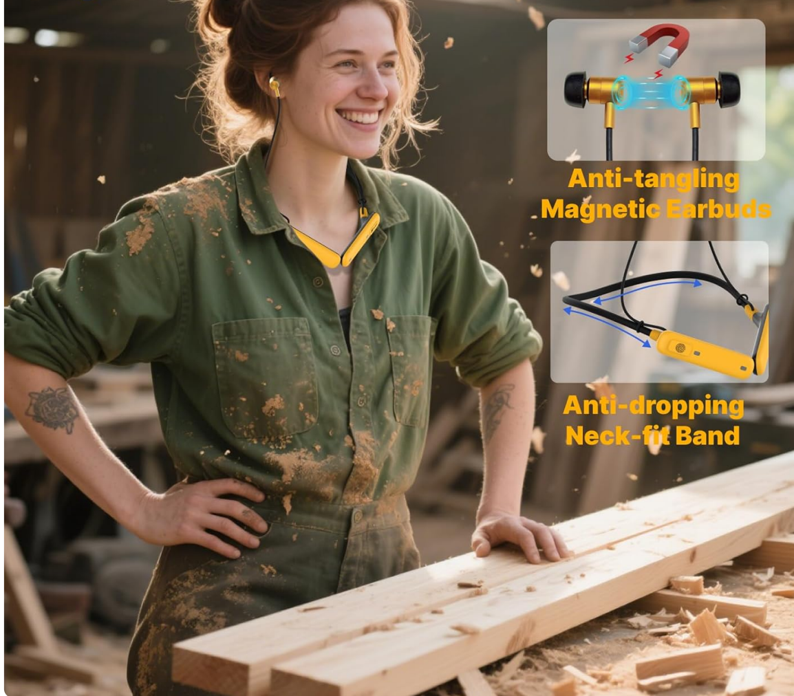
Image: A woman working in a workshop while wearing Hmusic H23 headphones, showcasing their comfortable neckband design and magnetic earbuds for secure and tangle-free use.