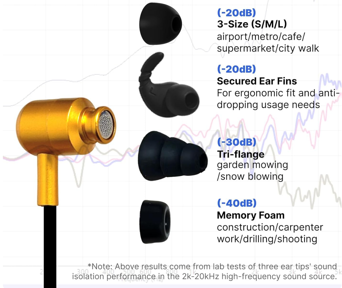
Image: A close-up of the various ear tip options (silicone, tri-flange, memory foam) provided with the H23 headphones, designed for different levels of noise reduction.