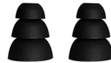
Triple-flanged Ear Tips

Image: Contents of the Hmusic H23 package, including the headphones, storage bag, charging cable, and various ear tips.