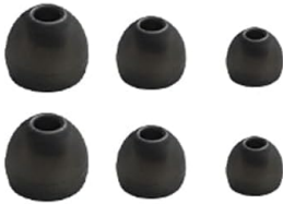
Silicone Ear Tips