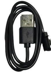
Magnetic Charging Cable