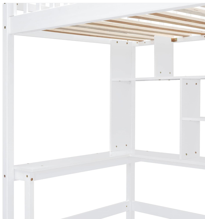
Image 5.2: Close-up of the desk area and adjacent book shelves, demonstrating their functional design.