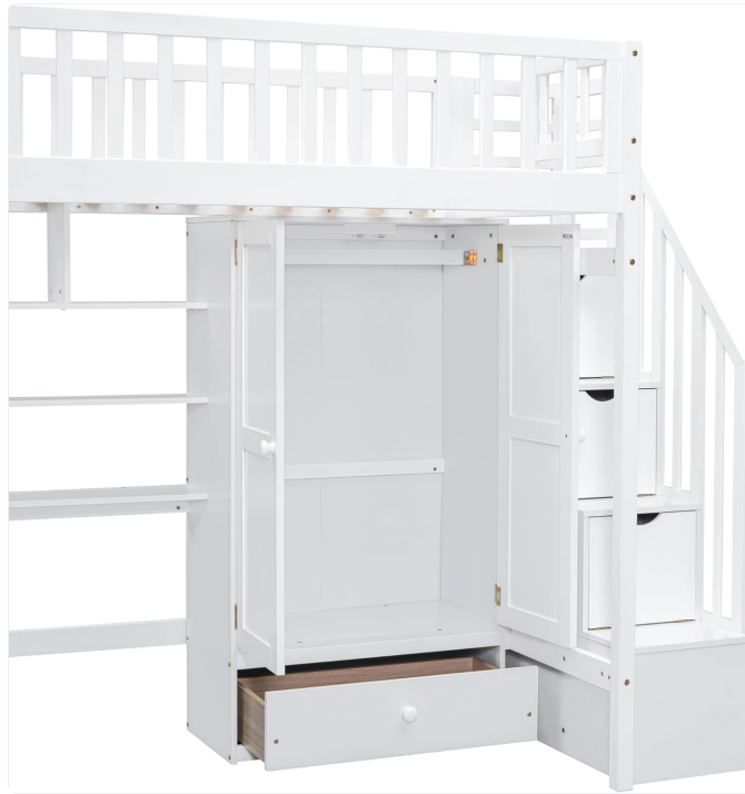
Image 5.1: The integrated wardrobe with its doors open, revealing a hanging rod and a lower storage drawer.