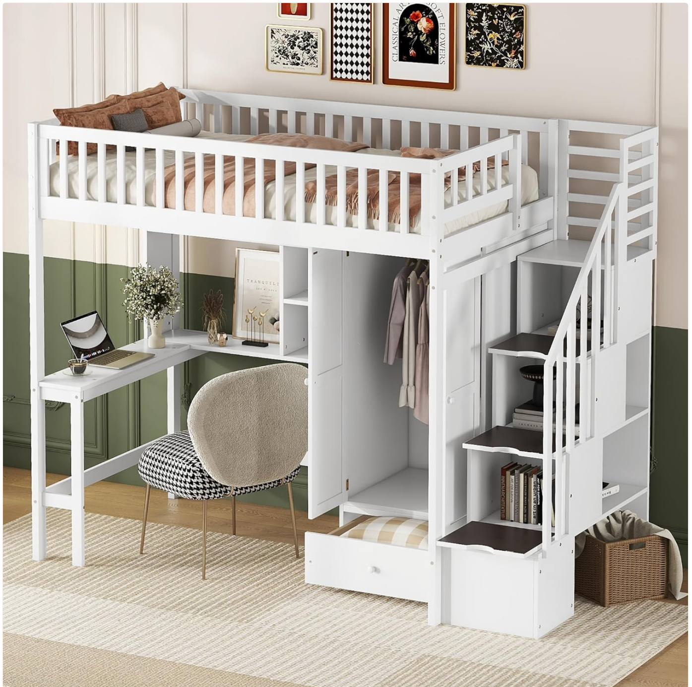
Image 1.1: Overview of the Polibi Twin Loft Bed, showcasing the integrated desk, wardrobe, and storage staircase.