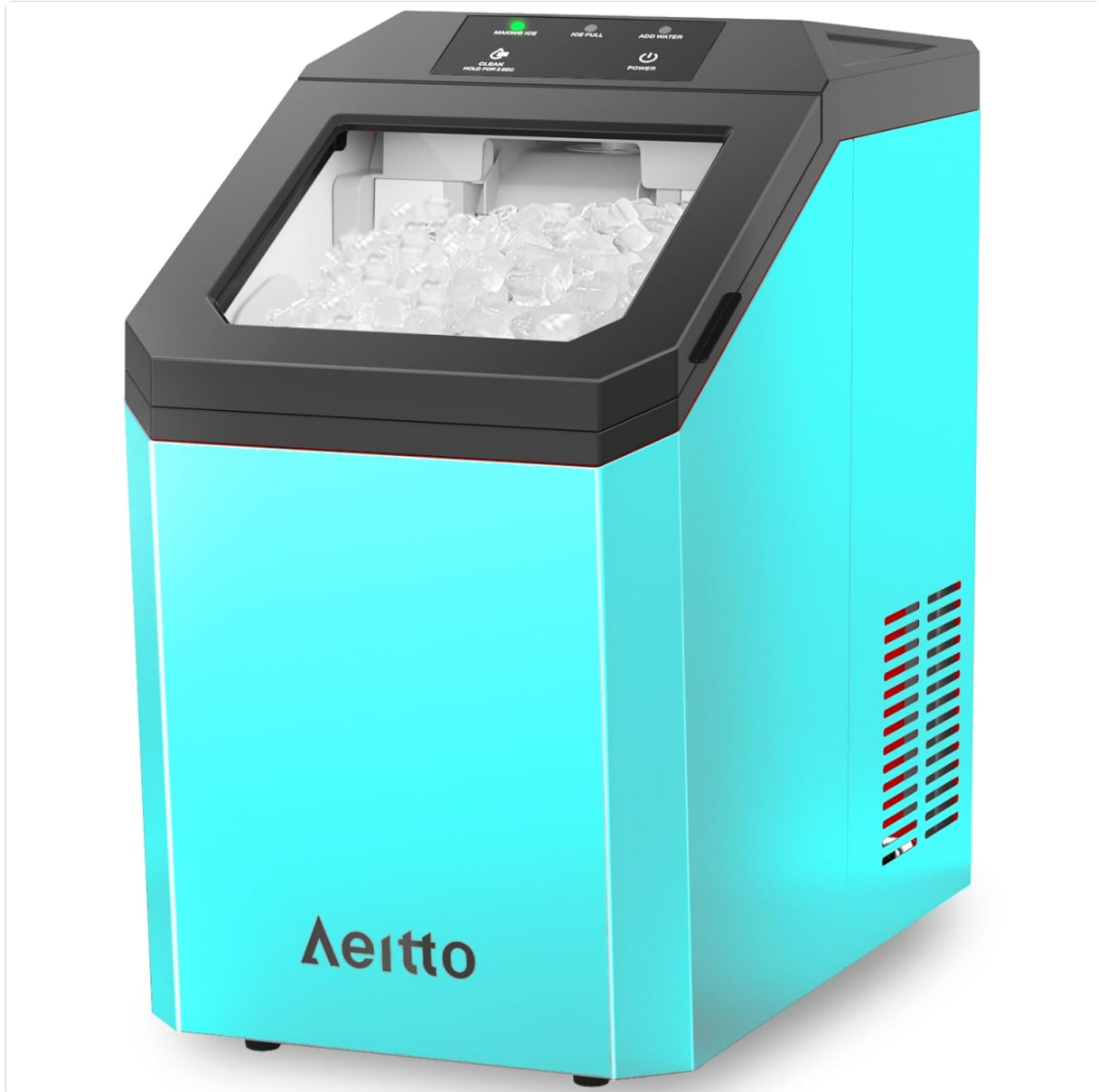
Figure 4.1: Front view of the Aeitto Nugget Ice Maker with ice visible.

Familiarize yourself with the components of your Aeitto Nugget Ice Maker: