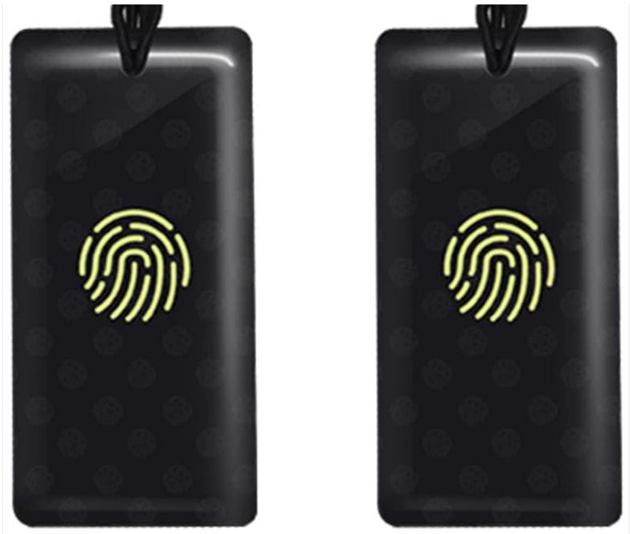
Image 1.1: Two Narput Smart Lock Key Fobs, black rectangular fobs with a yellow fingerprint icon and a black loop for attachment.