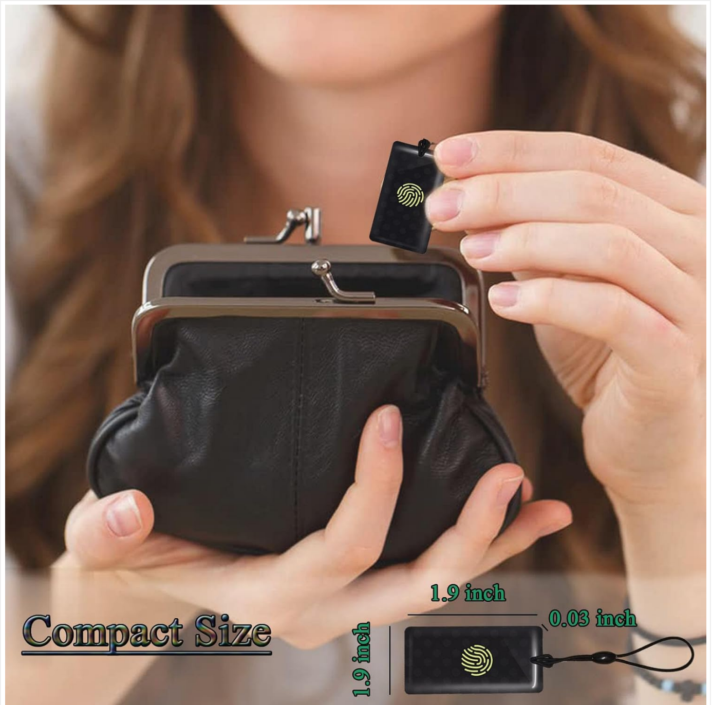
Image 5.3: A Narpult key fob being placed into a small coin purse, demonstrating its compact size (1.9 x 1 x 0.03 inches) for easy storage.