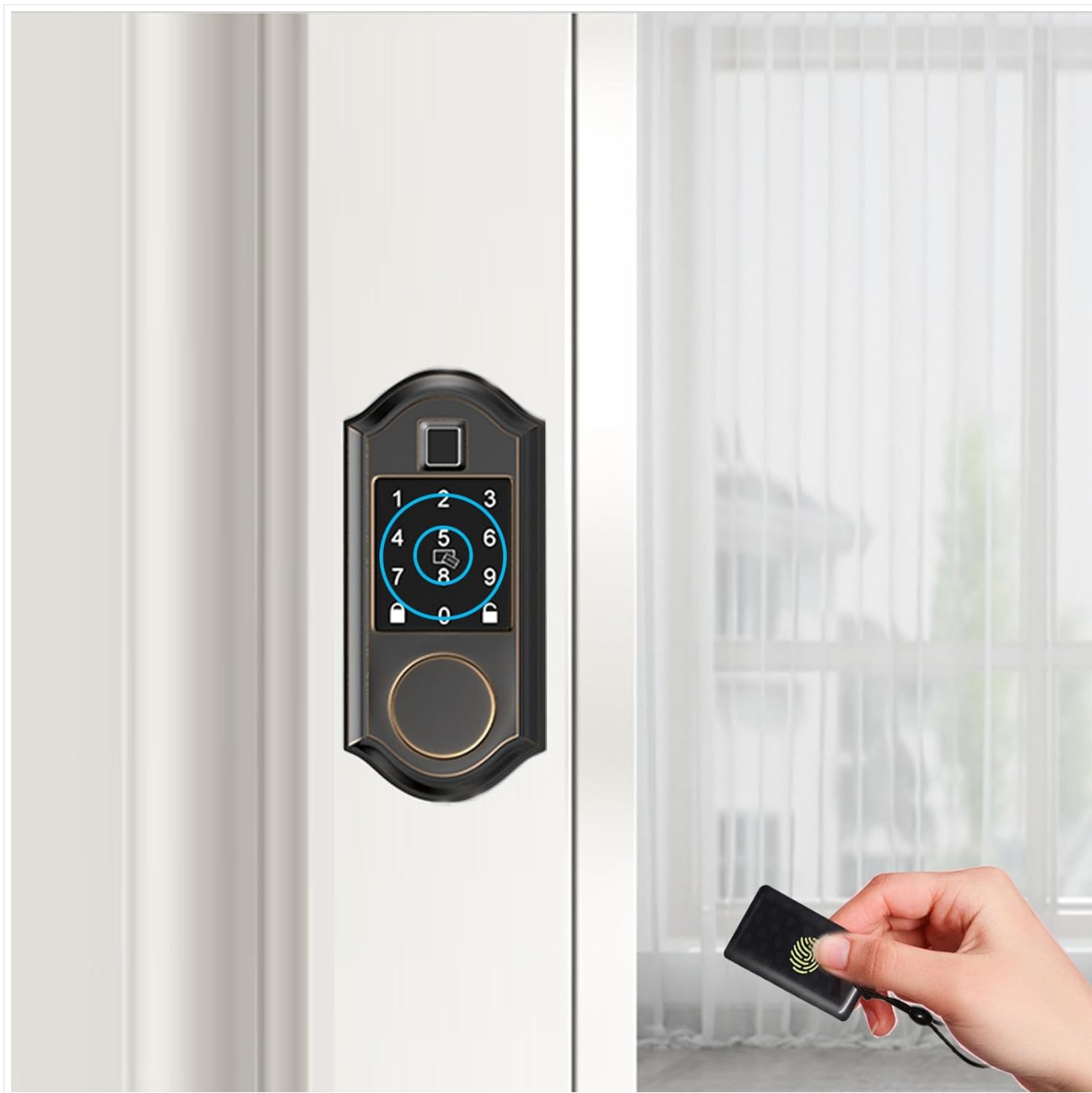
Image 4.2: A hand holding a Narputt key fob near a bronze-colored smart door lock with a circular keypad, demonstrating interaction.