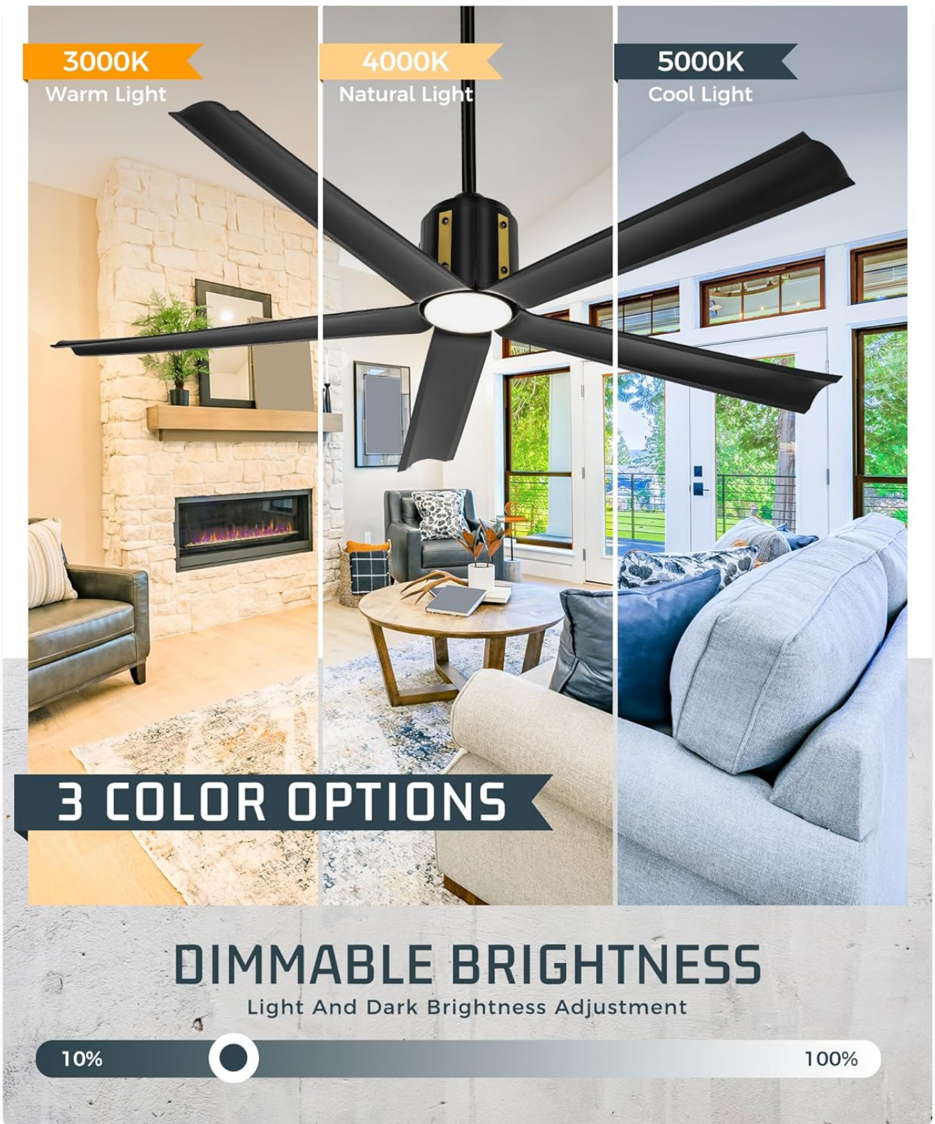
Figure 6: The integrated LED light offers adjustable brightness and color temperature.