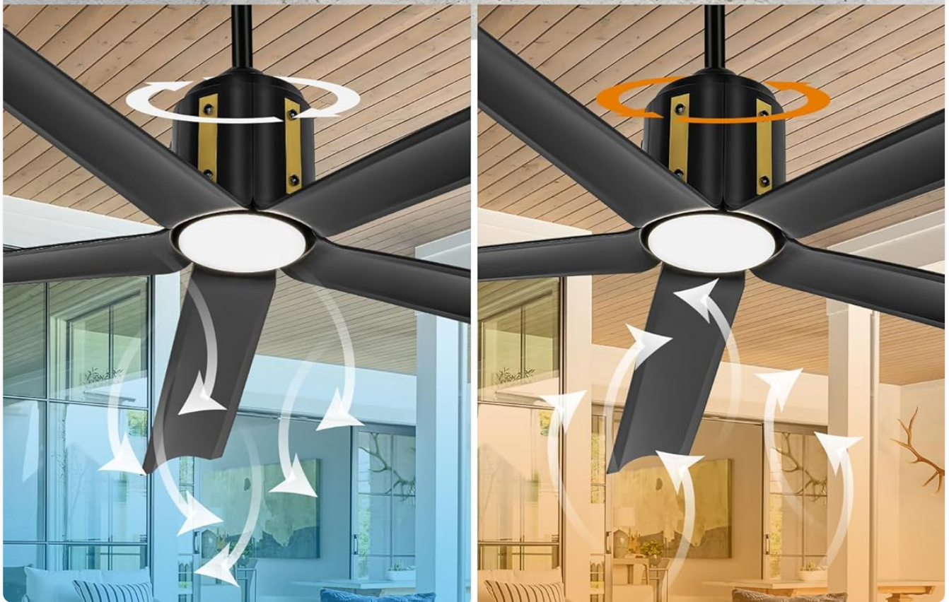
Figure 5: The reversible DC motor allows for optimal airflow in both summer and winter.