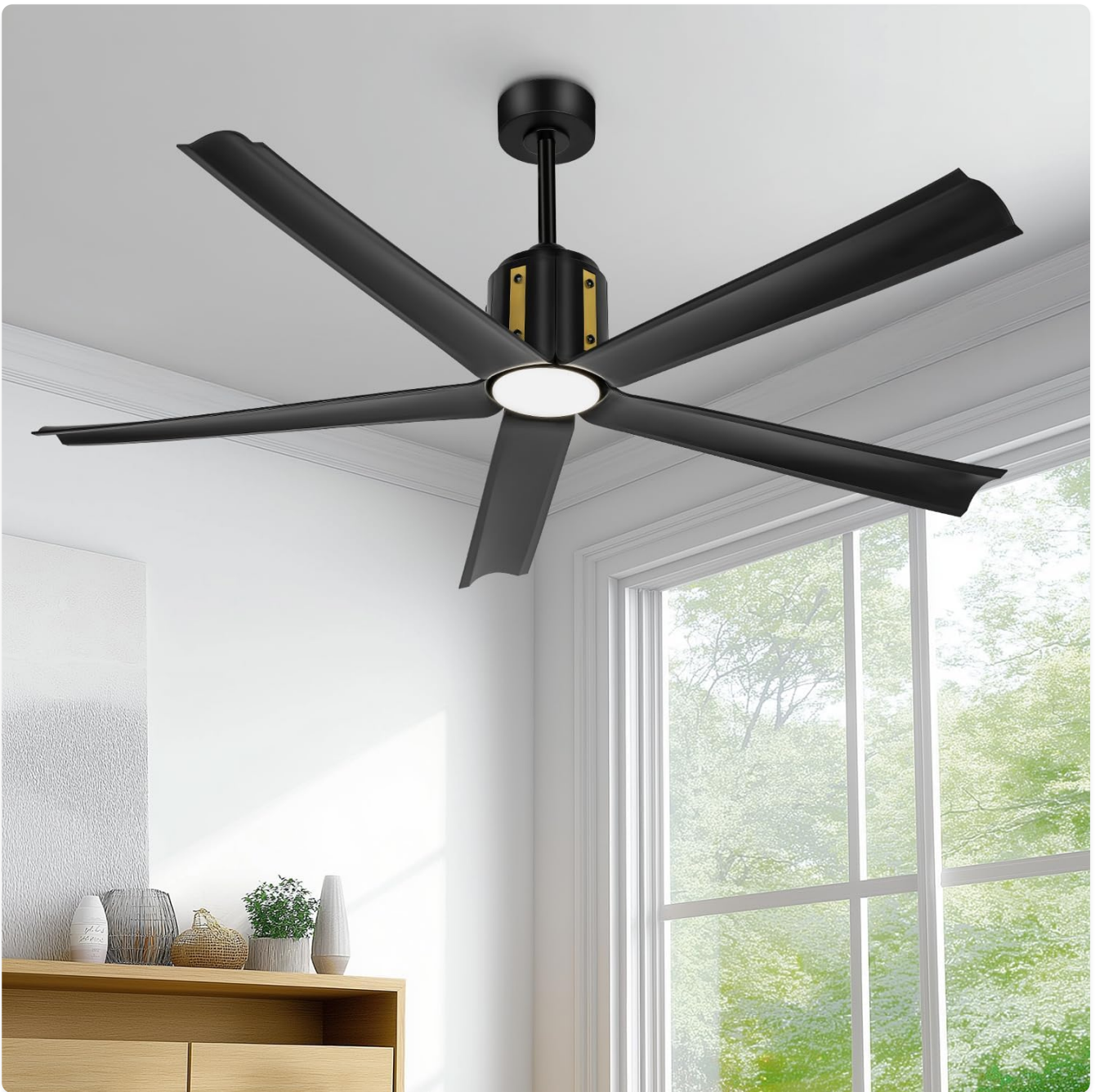
Figure 3: The JAZAVA Smart 60 Inch Ceiling Fan installed.