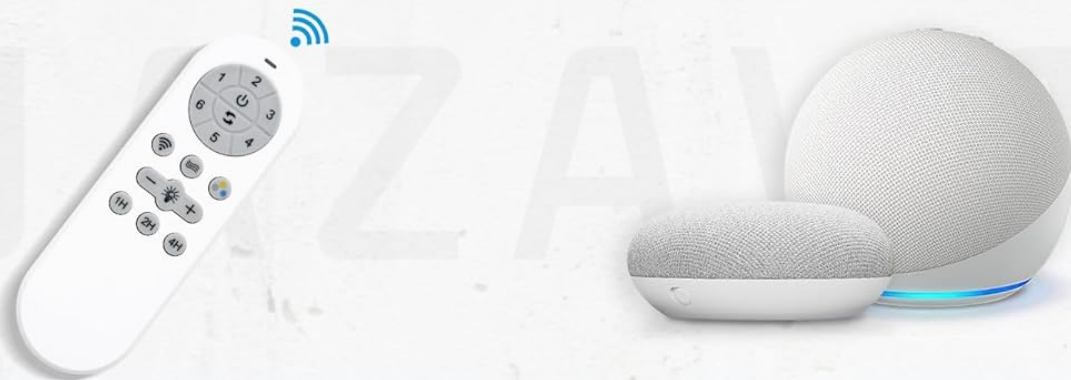
Figure 4: The fan can be controlled via app, remote, or voice commands.