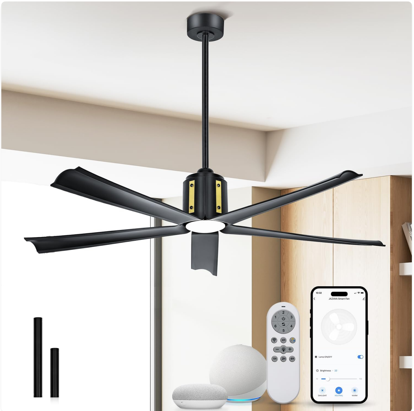
Figure 1: Overview of the JAZAVA Smart 60 Inch Ceiling Fan.