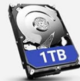
X1 1TB Surveillance HDD