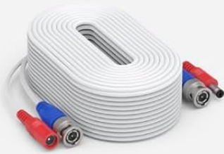
X4 60 ft BNC Cable