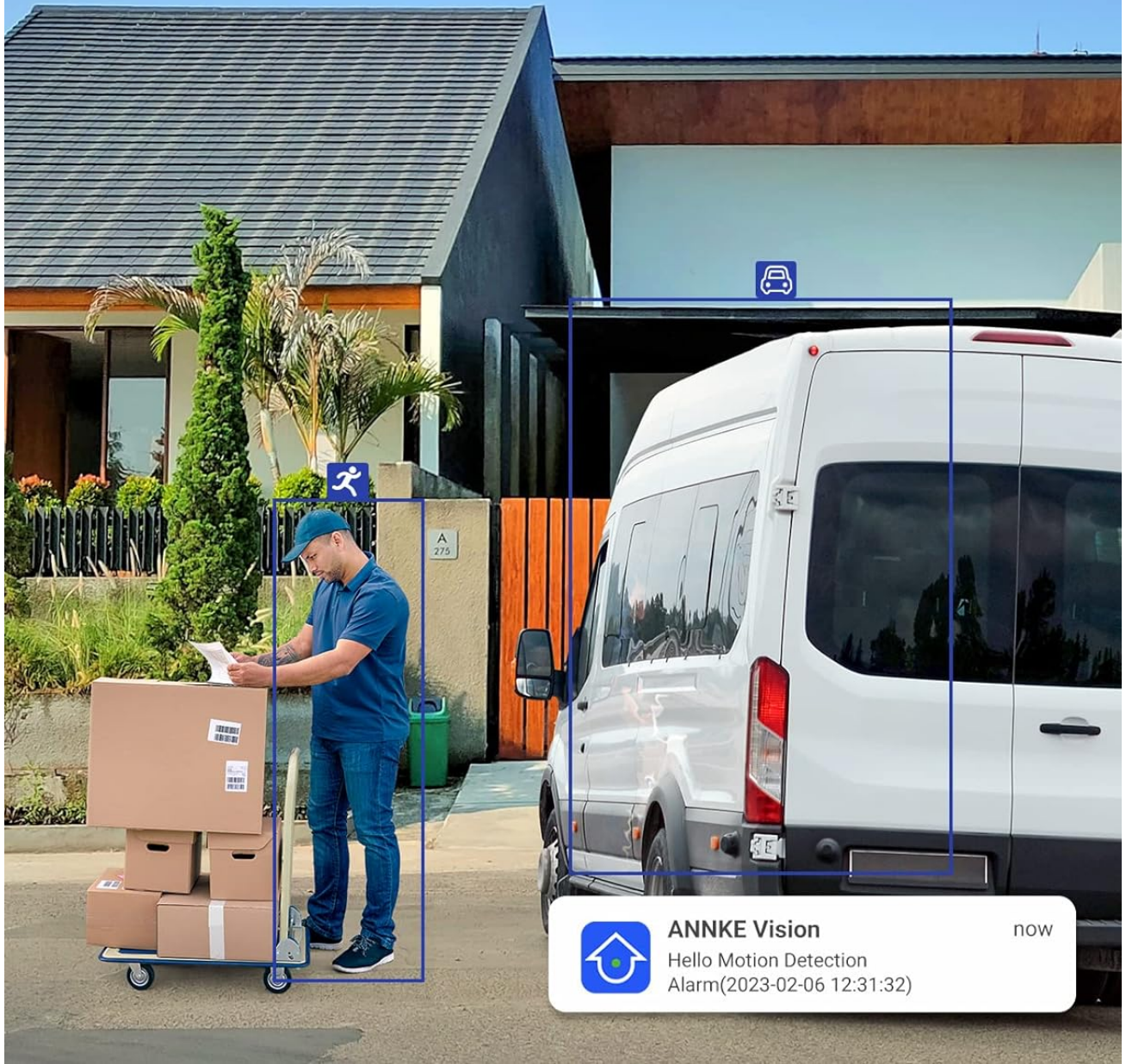
Figure 5: AI Human/Vehicle Detection