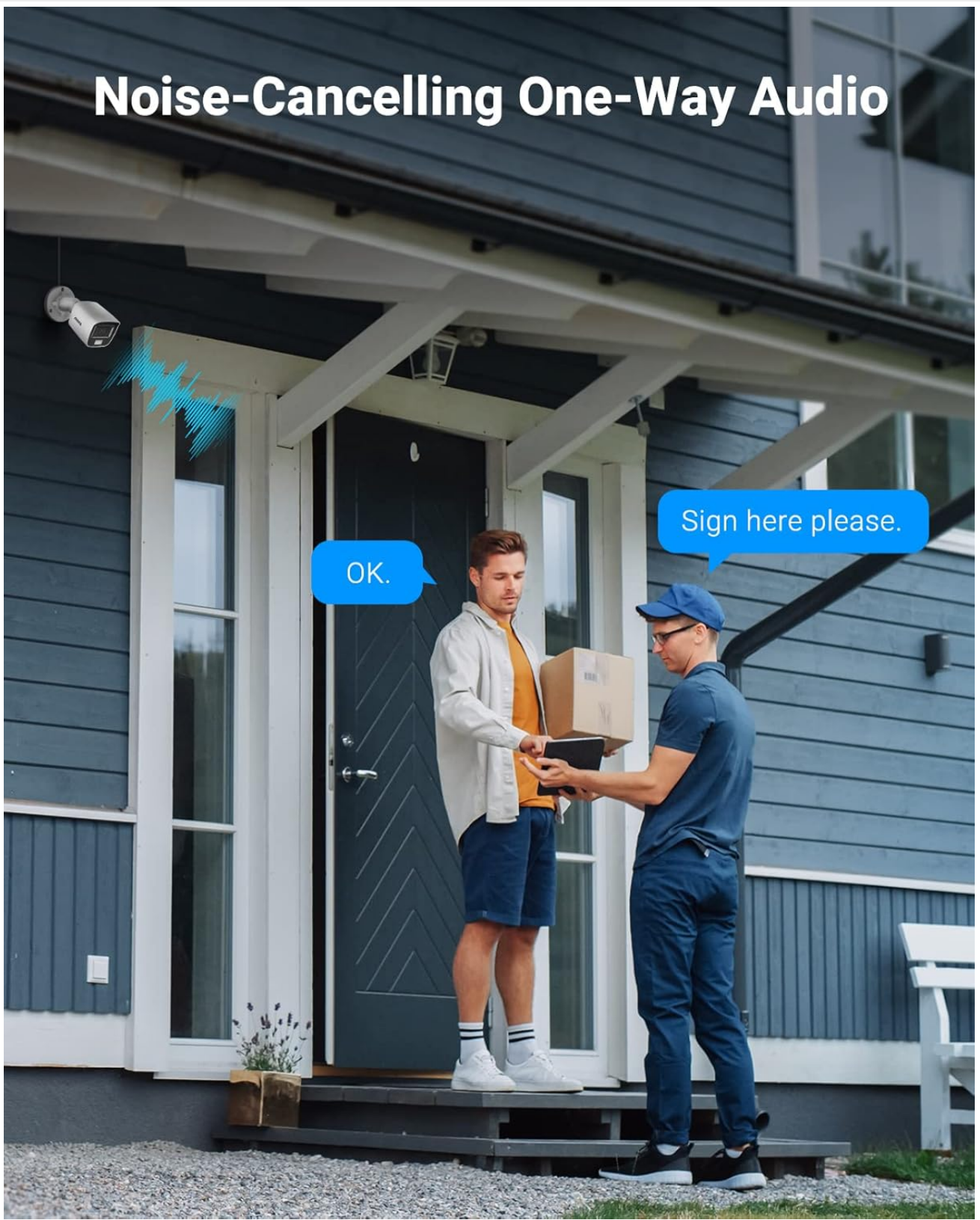
Figure 4: Built-in Microphone for Audio