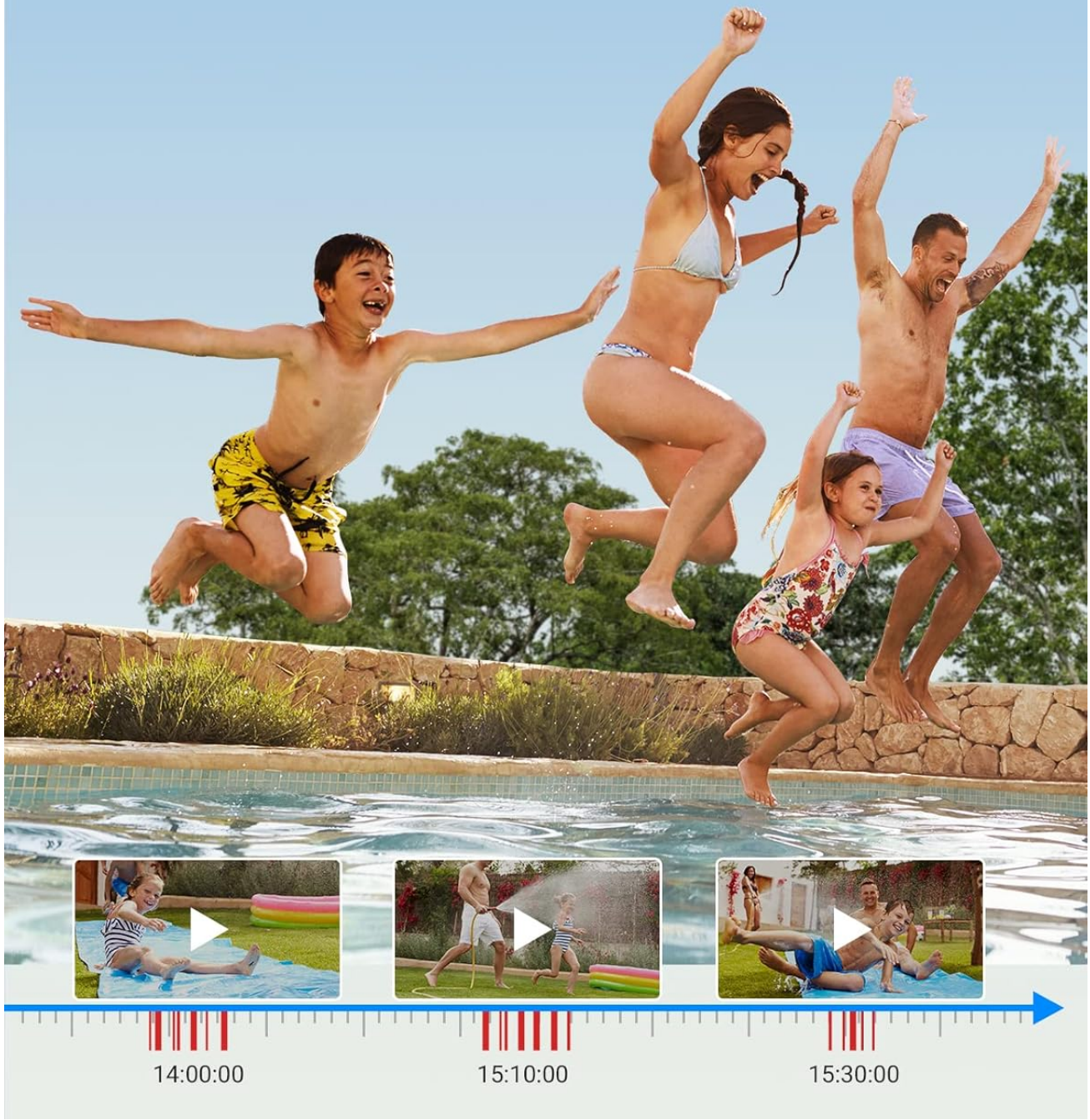
Figure 7: Smart Playback Feature