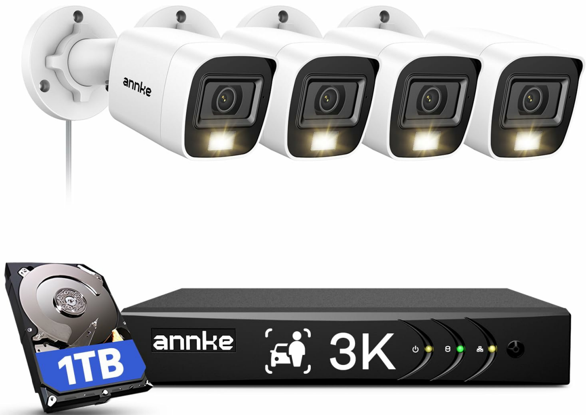
Figure 1: ANNKE 8CH 3K Security Camera System Overview