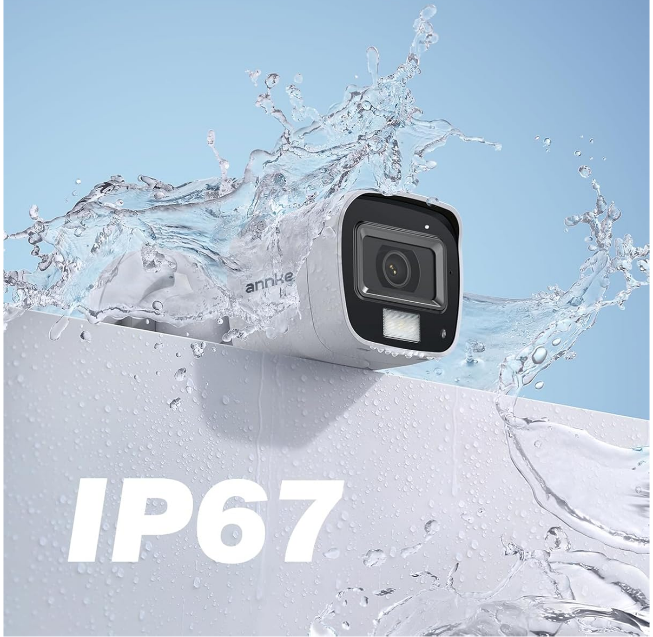
Figure 6: IP67 All-Weather Proof Design