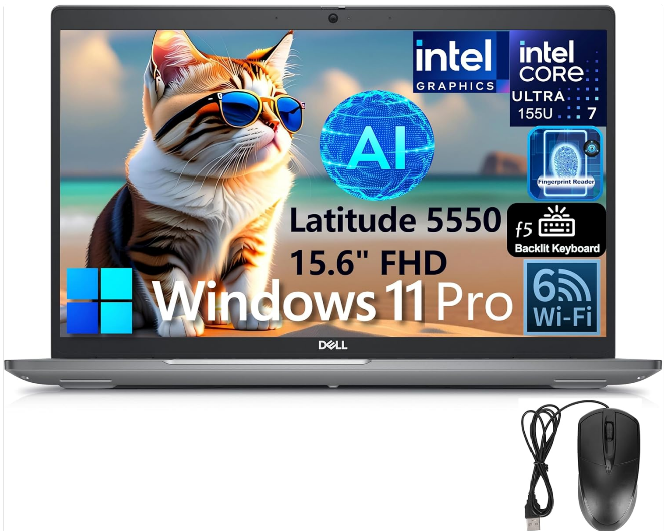
Figure 1.1: Dell Latitude 5550 Laptop with included wired mouse.