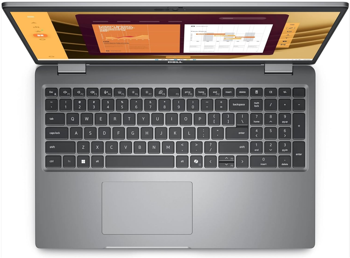
Figure 3.1: Top view of the keyboard and touchpad layout.