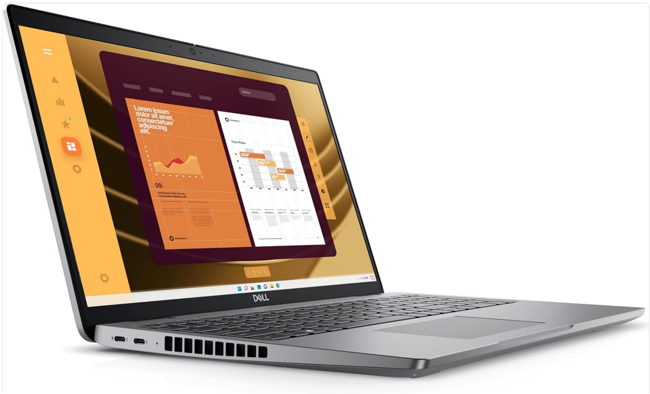
Figure 2.1: Side view of the Dell Latitude 5550 during initial setup.

to complete the Windows 11 Professional setup process. This includes selecting your region, language, connecting to a Wi-Fi network, and creating a user account.