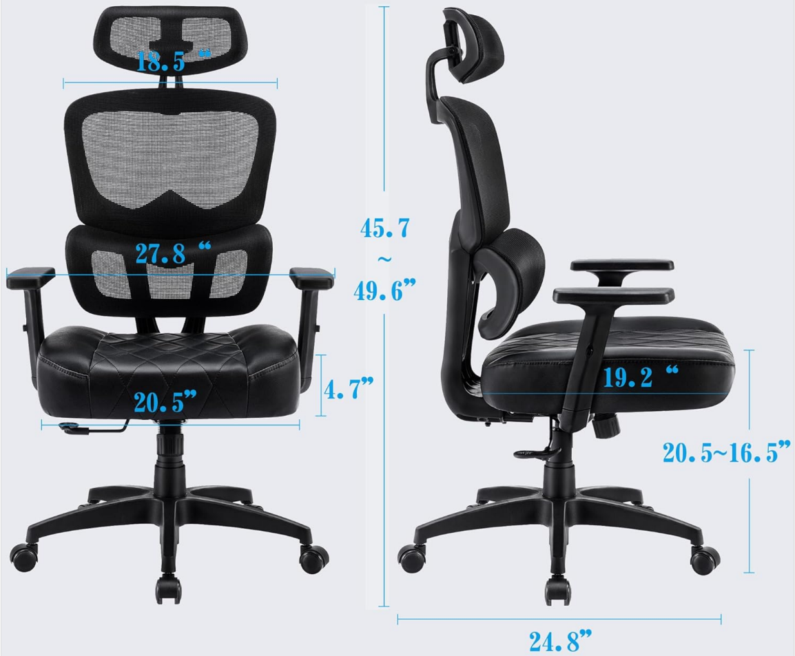
Image Description: A detailed diagram illustrating the product dimensions of the VECELO office chair, including seat width, seat depth, backrest height, and overall height and width from both front and side perspectives.