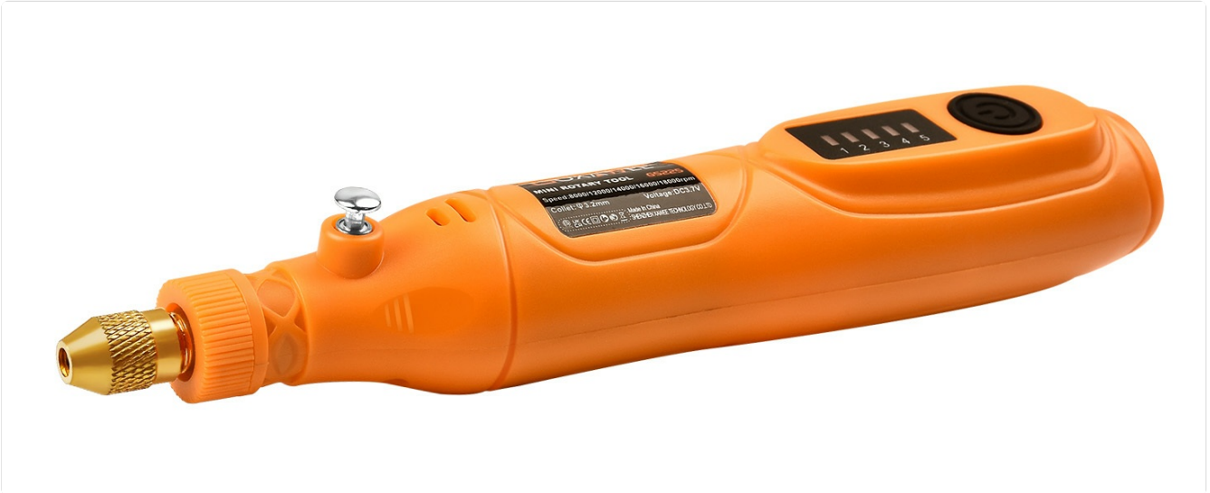
Figure 6.1: Illustration of the 5-speed settings on the GOXAWEE Mini Cordless Rotary Tool, ranging from 5000 RPM to 18000 RPM.