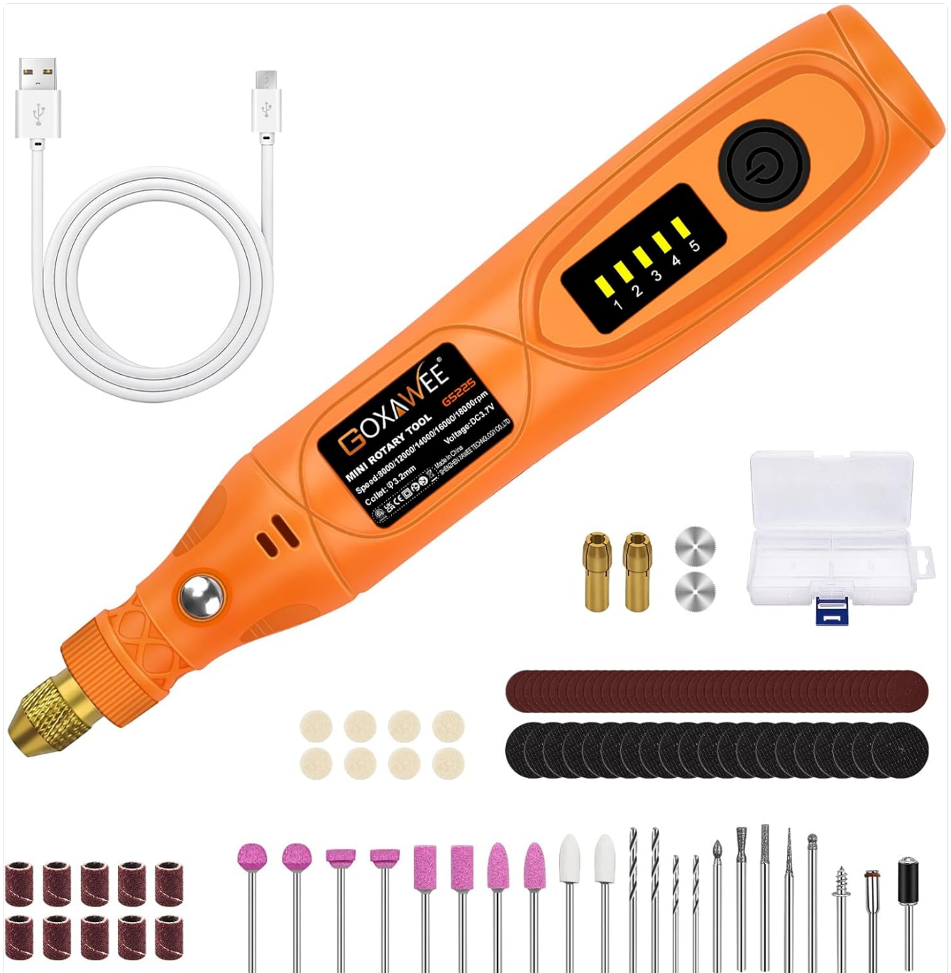
Figure 3.1: Complete GOXAWEE Mini Cordless Rotary Tool Kit with 105 accessories and USB charging cable.