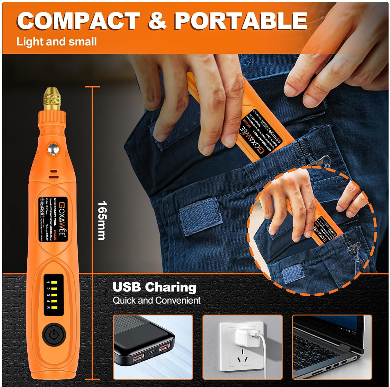
Figure 4.1: Key features of the GOXAWEE Mini Cordless Rotary Tool, including the chuck, spindle lock button, heat dissipation holes, speed control button, and Type-C charging port.

Familiarize yourself with the components and features of your rotary tool: