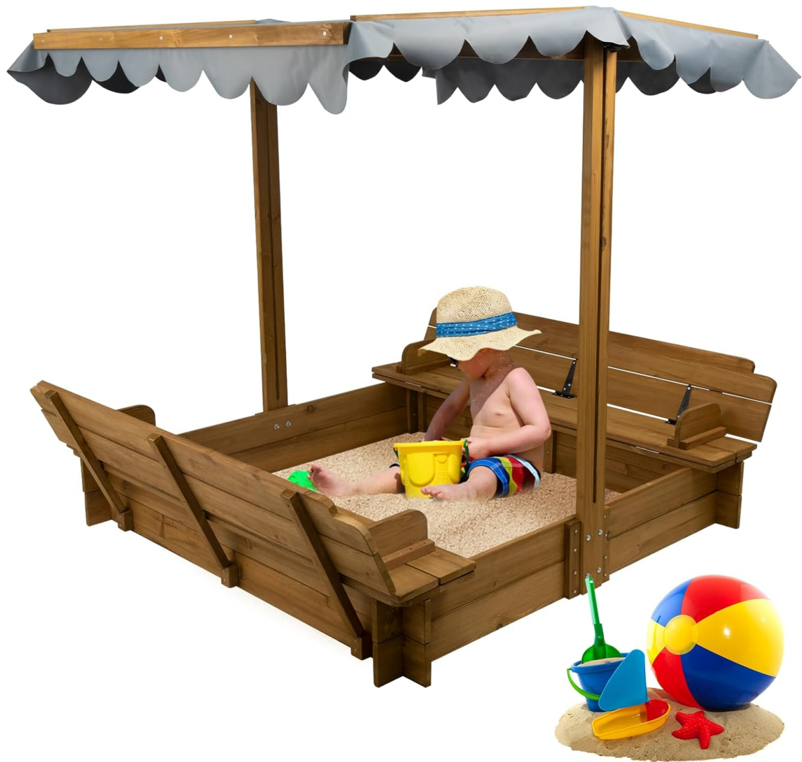
Image Description: A young child is seated inside the PetsCosset wooden sandbox, playing with sand toys. The sandbox features a light grey canopy providing shade and two foldable wooden bench seats on either side. Additional sand toys are scattered around the sandbox.