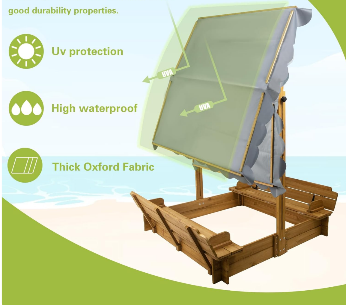
Image Description: A diagram illustrating the 180-degree rotatable canopy feature of the sandbox, showing how it can be adjusted to block UV rays from different directions.