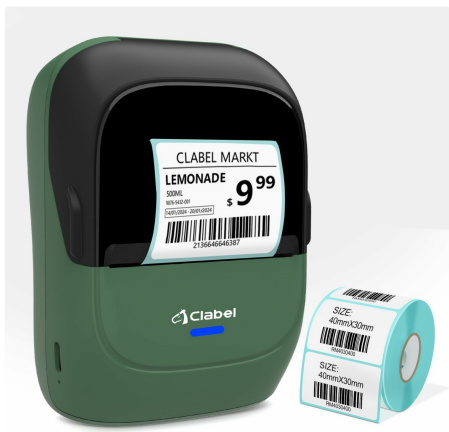
The CLABEL 221B Thermal Label Printer in its green color variant, showcasing its compact design.