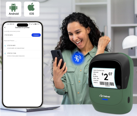
A user connecting the CLABEL 221B printer to a smartphone via Bluetooth, highlighting its wireless connectivity.

Just turn on the Bluetooth, one click to connect.