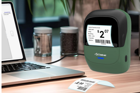
The CLABEL 221B printer connected to a Windows PC, demonstrating its compatibility with desktop computers.