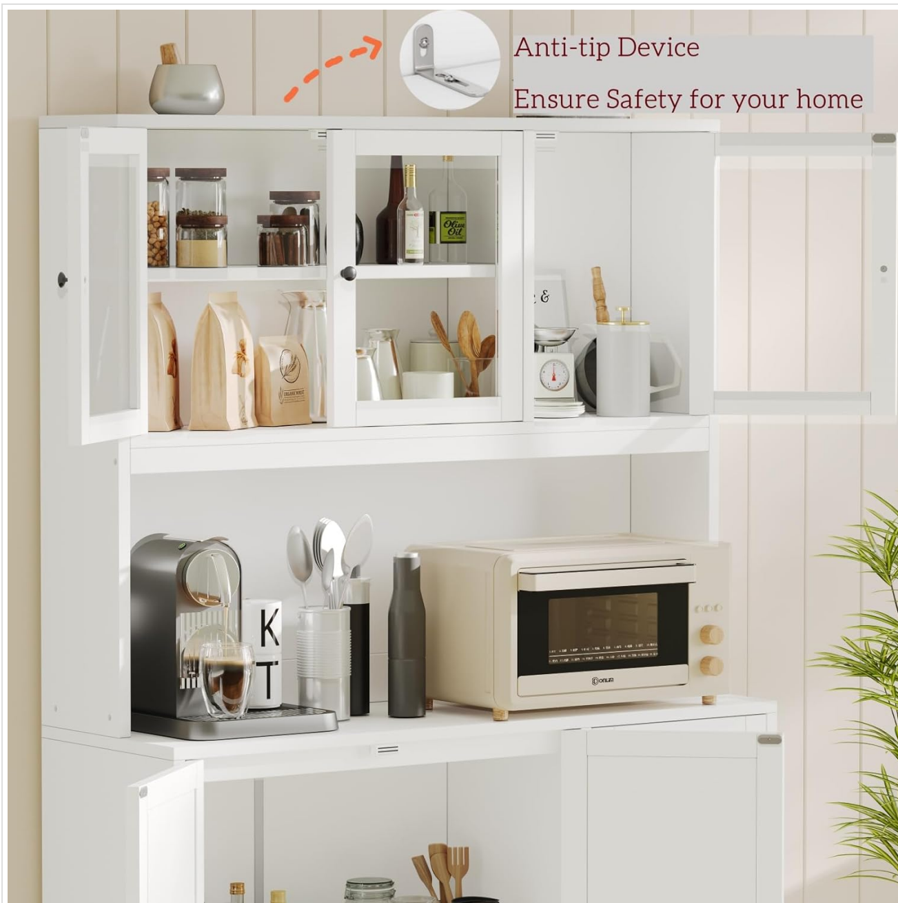
Figure 3.1: The anti-tipping device, essential for securing the cabinet to the wall and ensuring stability.