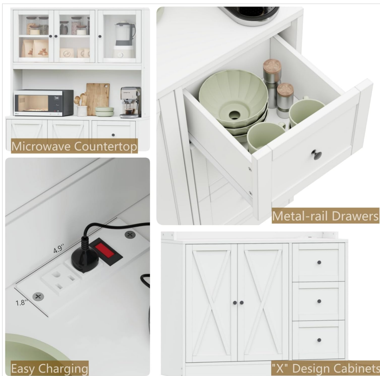
Figure 4.1: Detailed view showing the microwave countertop, metal-rail drawers, and the easy charging station with AC outlets.