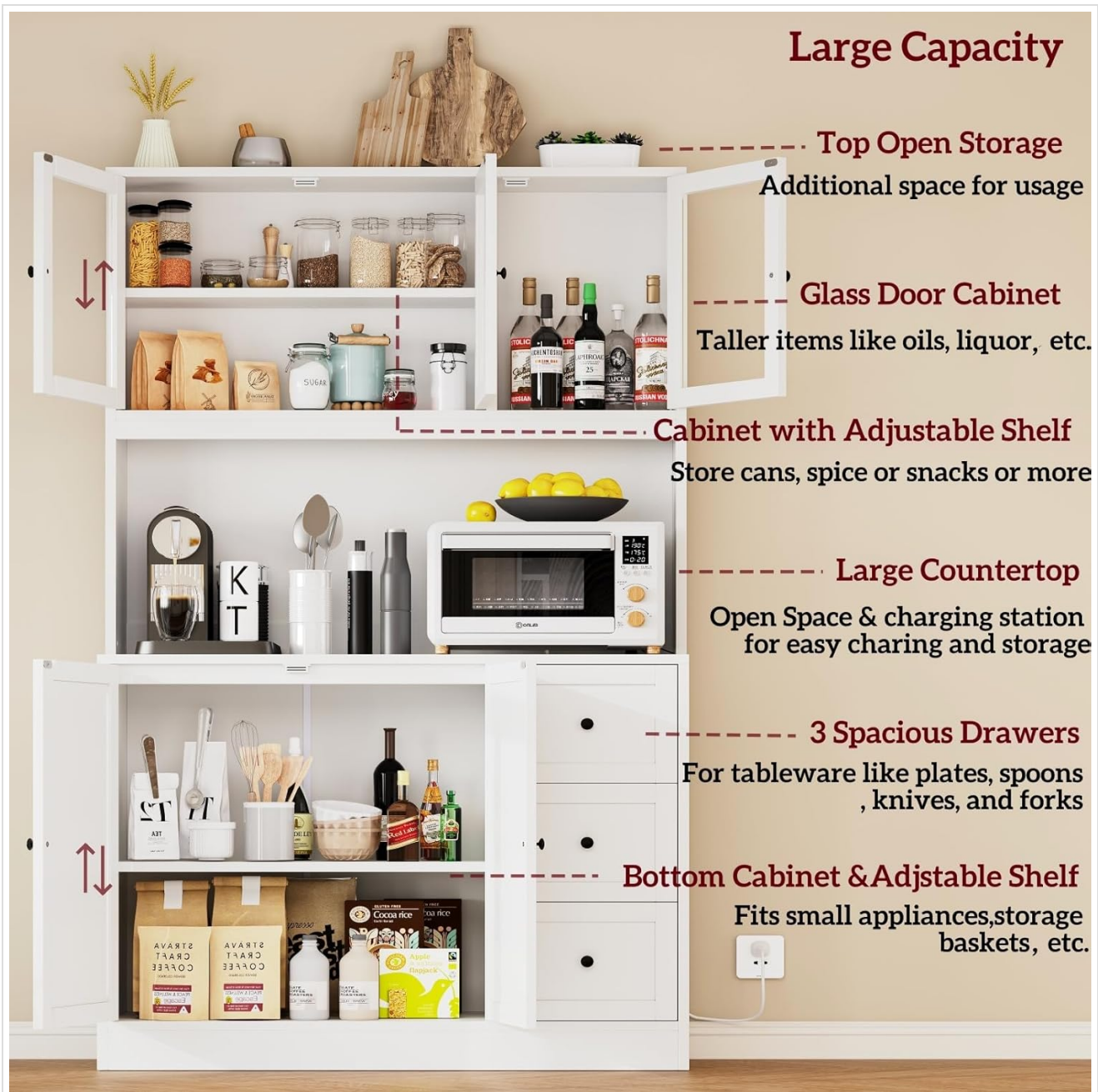
Figure 2.2: Illustration of the cabinet's storage capacity, including top open storage, glass door cabinets, adjustable shelves, large countertop, three spacious drawers, and bottom cabinet with adjustable shelf.