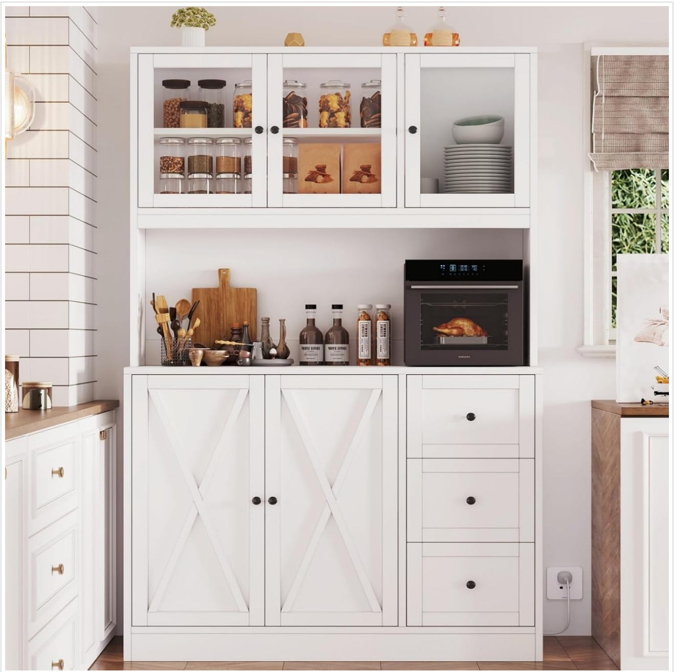
Figure 2.1: The Irontar CWG011E Kitchen Pantry, showcasing its design and functionality in a kitchen environment.