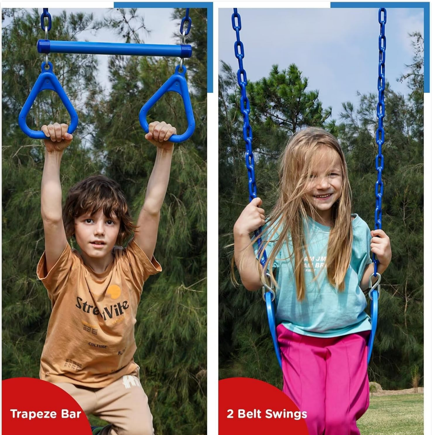
Figure 5: Trapeze Bar and Belt Swings. This image provides a detailed view of the trapeze bar and one of the belt swings, showing their design and how children interact with them.