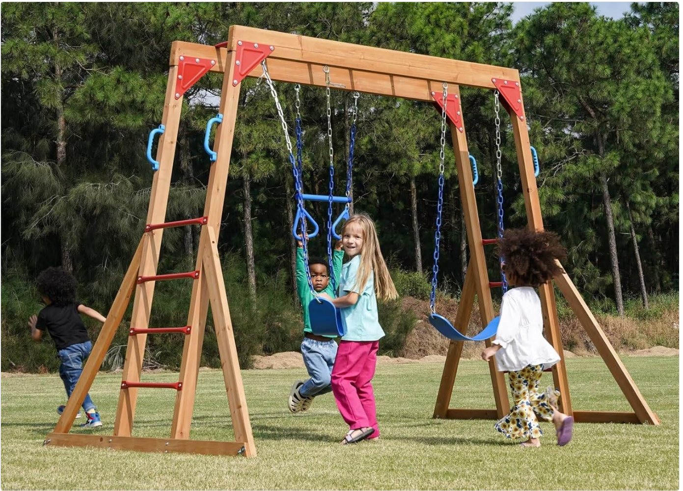
Figure 4: Children Enjoying the Swing Set. This image shows multiple children actively using the various components of the swing set, including the monkey bars, belt swings, and trapeze bar.