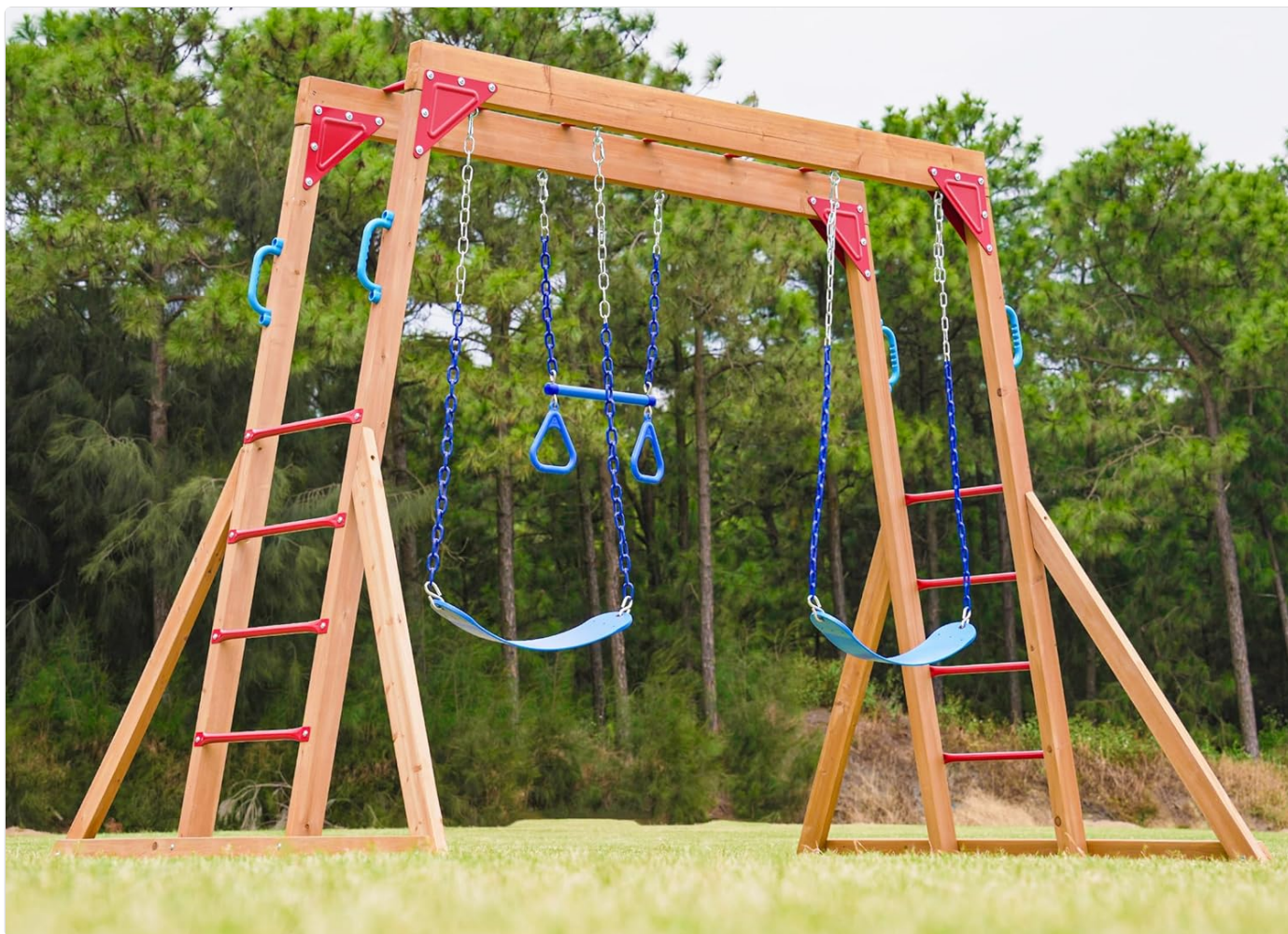
Figure 3: Assembled Swing Set. This image shows the complete swing set structure, ready for use after assembly and anchoring.