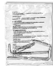
Figure 2: Organized Hardware Packaging. Hardware is packaged by assembly step, with spare parts and tools clearly labeled to facilitate installation.