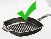
Cast Iron Pan