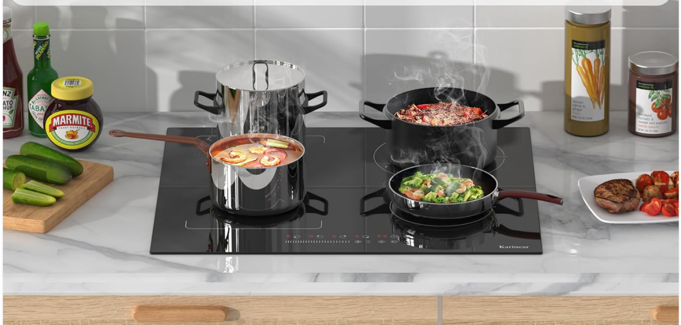
Image: Guide to compatible induction cookware, showing suitable materials like cast iron and stainless steel, and unsuitable ones like ceramic and glass.