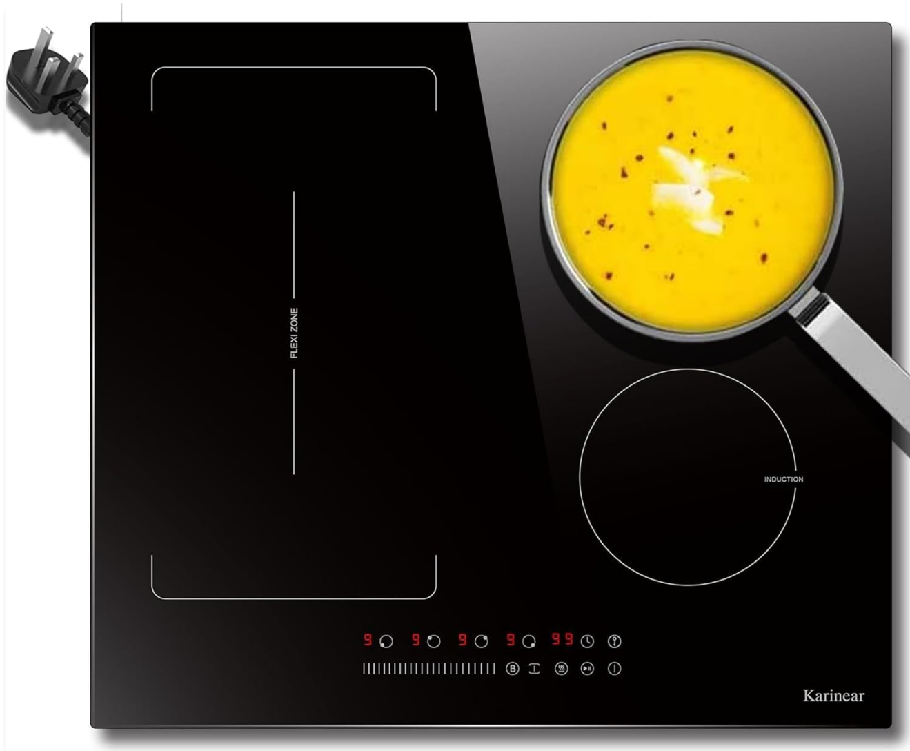
Image: Karinear Induction Hob overview, showing the cooking zones and touch control panel.