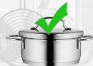
Stainless Steel Pot