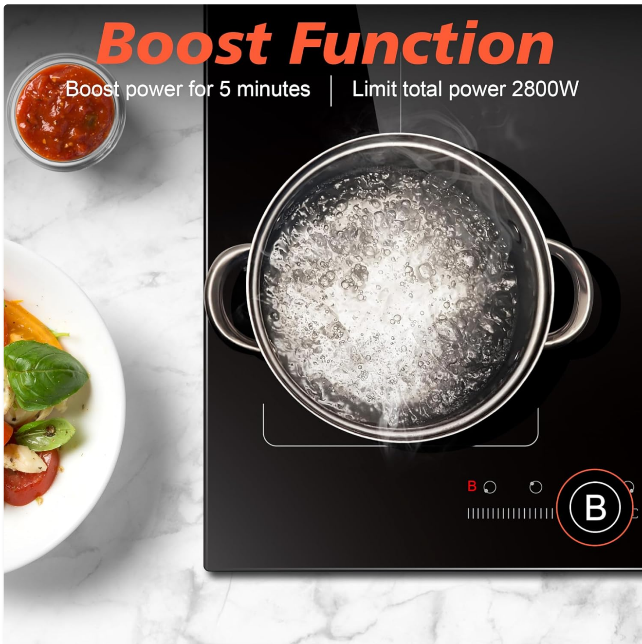
Image: The Boost function quickly brings water to a boil.