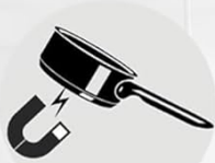
Compatible Induction Cookware

② Suitable for iron pots and pans with a rounded bottom diameter of 16-21cm.