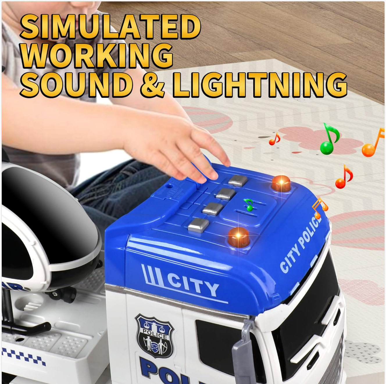
Image 3.1: Close-up view of the truck's cab, showing the location of the sound and light buttons, which are activated by batteries.