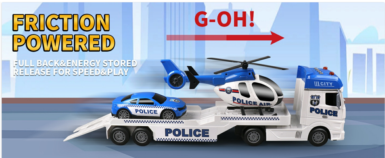
Image 4.1: The police semi-truck with its trailer, demonstrating the movable tailboard for loading and unloading vehicles.