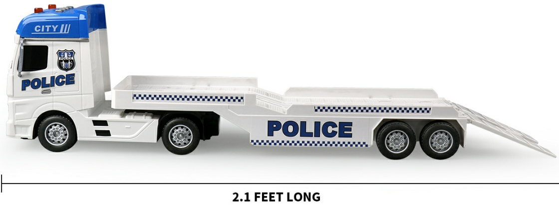
Image 5.1: The Dwi Dowellin Police Semi Truck, highlighting its extra-large size of 25.59 inches (65 cm).