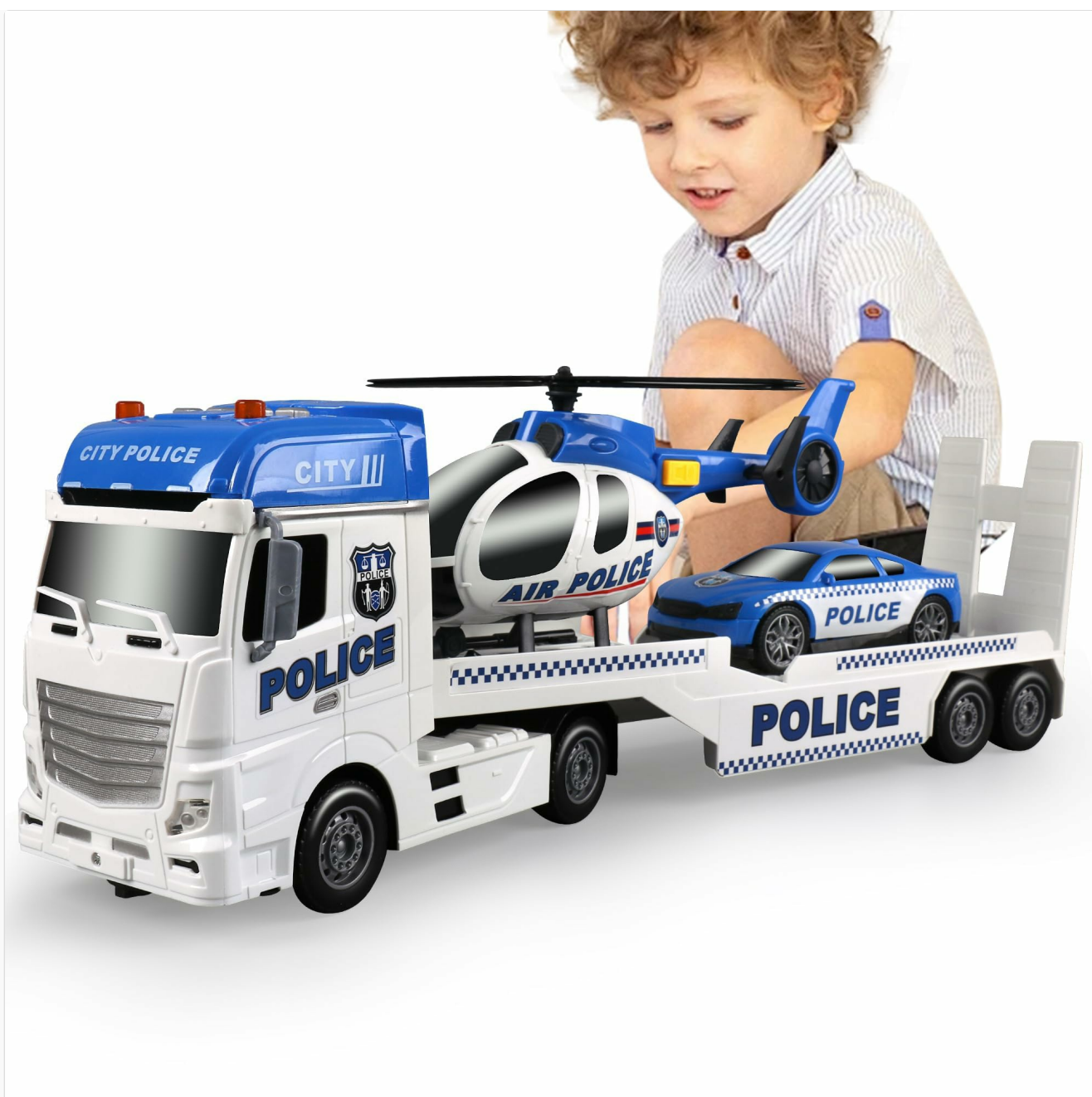
Image 1.1: The Dwi Dowellin Police Semi Truck Toy Set, featuring the semi-truck, police car, and helicopter.