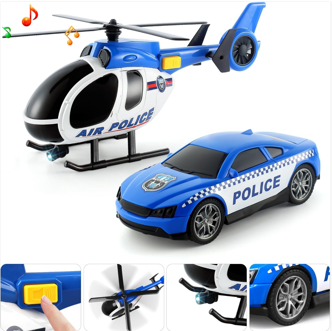
Image 3.2: Close-up view of the helicopter, showing the button for light and sound effects.