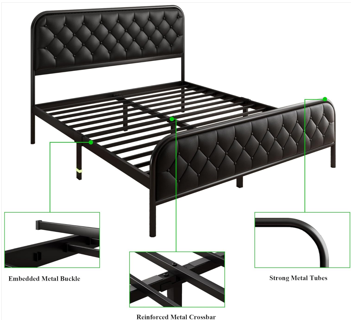
Figure 3.1: Frame Structure Details.