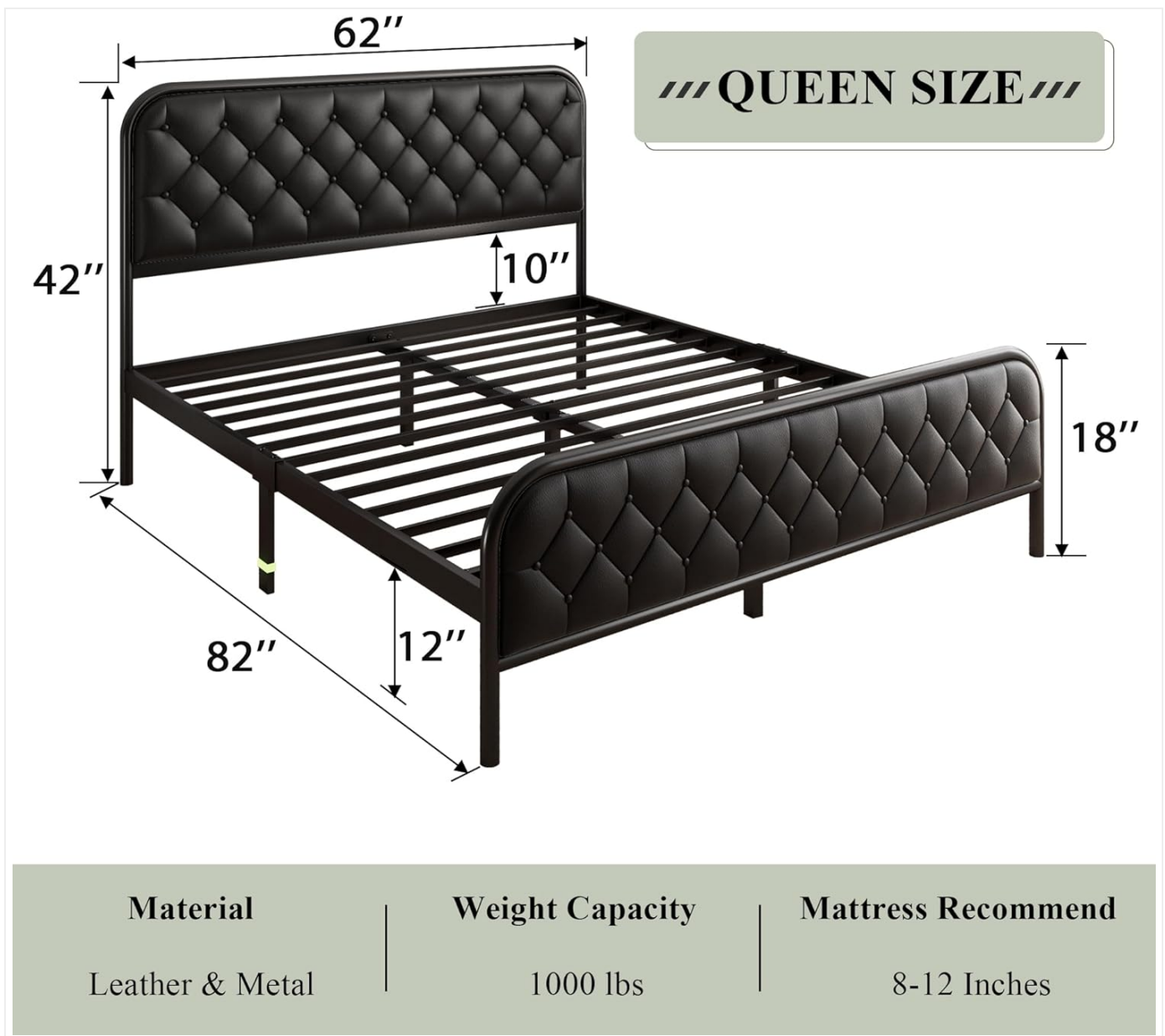
Figure 2.1: Product Dimensions and Key Specifications.