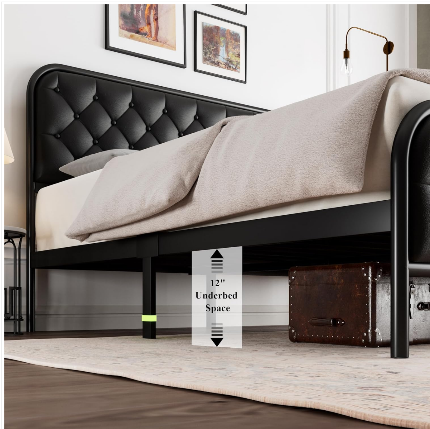
Figure 4.1: Underbed Storage Space.