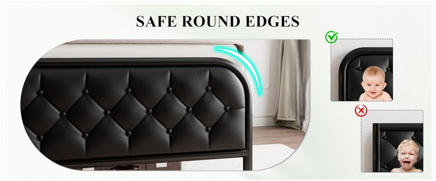
Figure 7.1: Visual Specifications Overview.