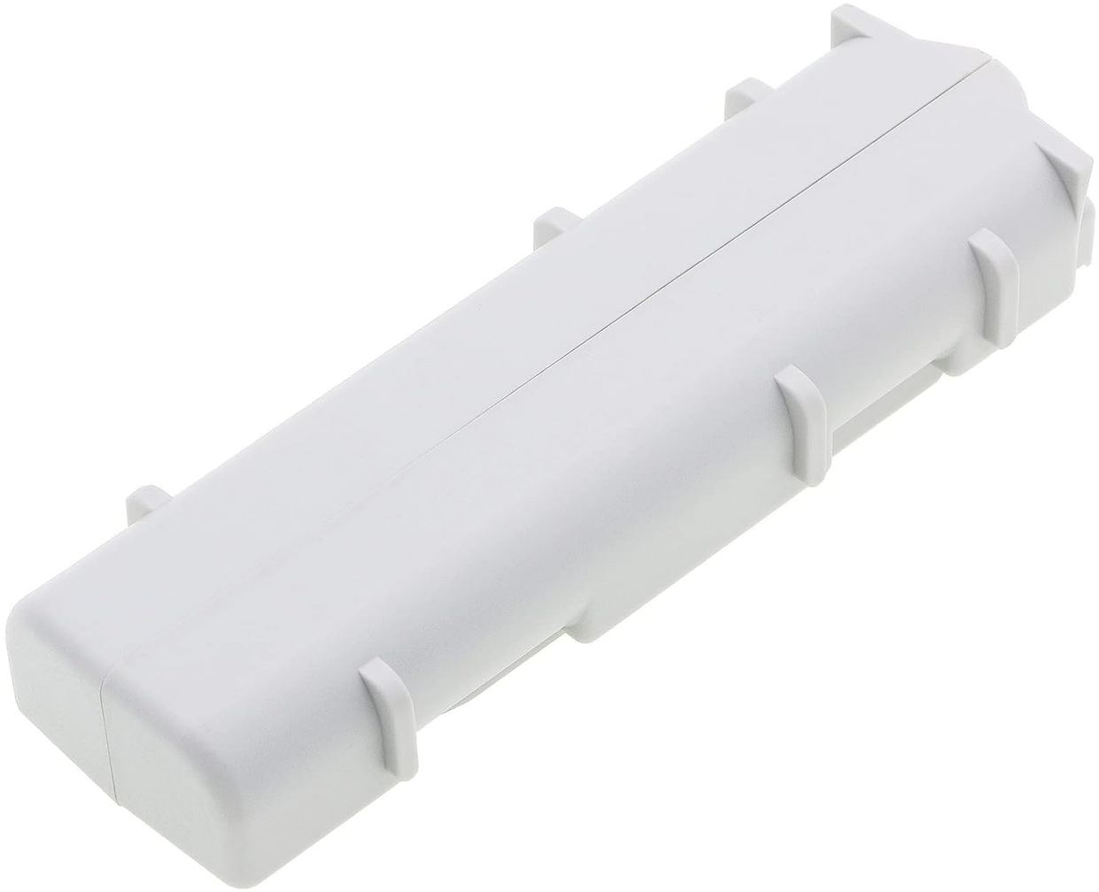
Image: An alternative side view of the DCH CS-ART822RX battery, providing a complete visual understanding of its form.