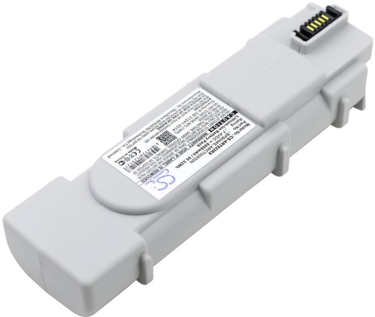
Image: The DCH CS-ART822RX battery replacement, illustrating its physical form factor and connector end.