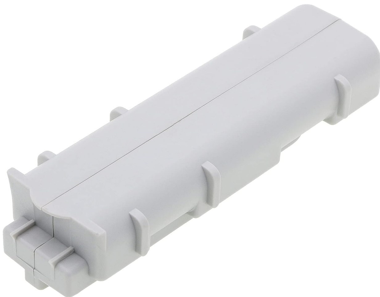
Image: A side profile of the DCH CS-ART822RX battery, highlighting its design for secure fitment within a device.