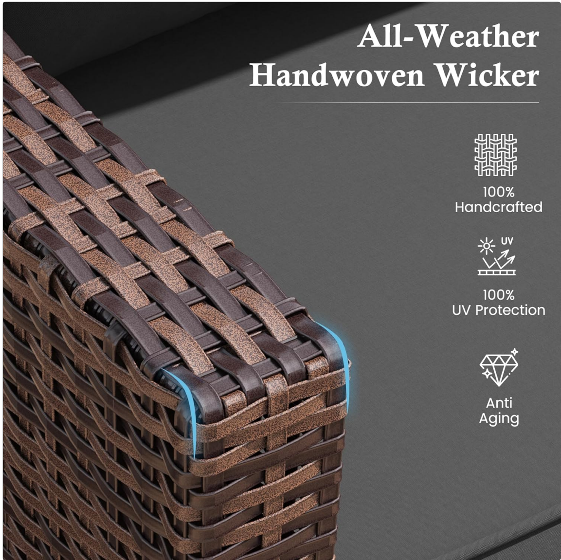
Image 2.1: A close-up view of the furniture's handwoven PE rattan, highlighting its all-weather, UV-protected, and anti-aging properties.