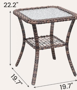
1 x Side Table

Image 2.5: The patio furniture set protected by all-weather covers during rainy conditions, illustrating protection against UV, rain, snow, and dust.