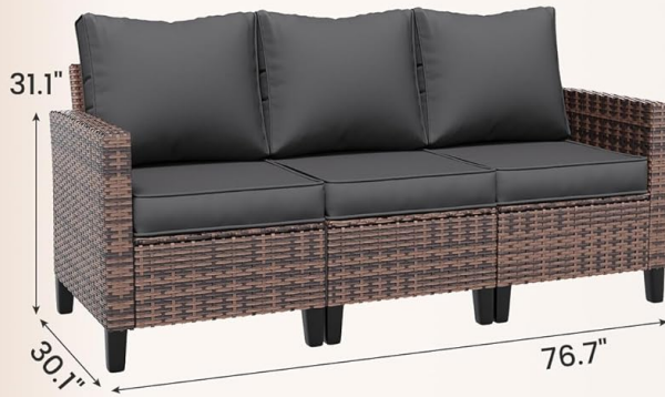
1 x 3-Seat Sofa

Ship in 3 Packages , May Not Arrive at the Same Time