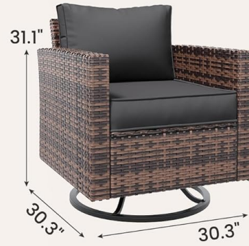
2 x Swivel Rocker Chairs