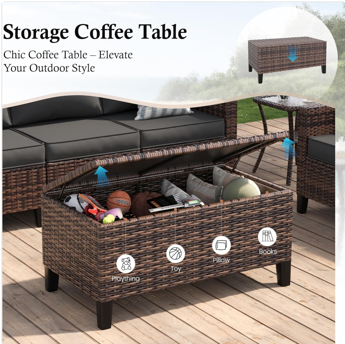
Image 2.4: The storage coffee table with its lid open, demonstrating its capacity for storing various outdoor items like toys, pillows, and books.

Chic Coffee Table – Elevate Your Outdoor Style