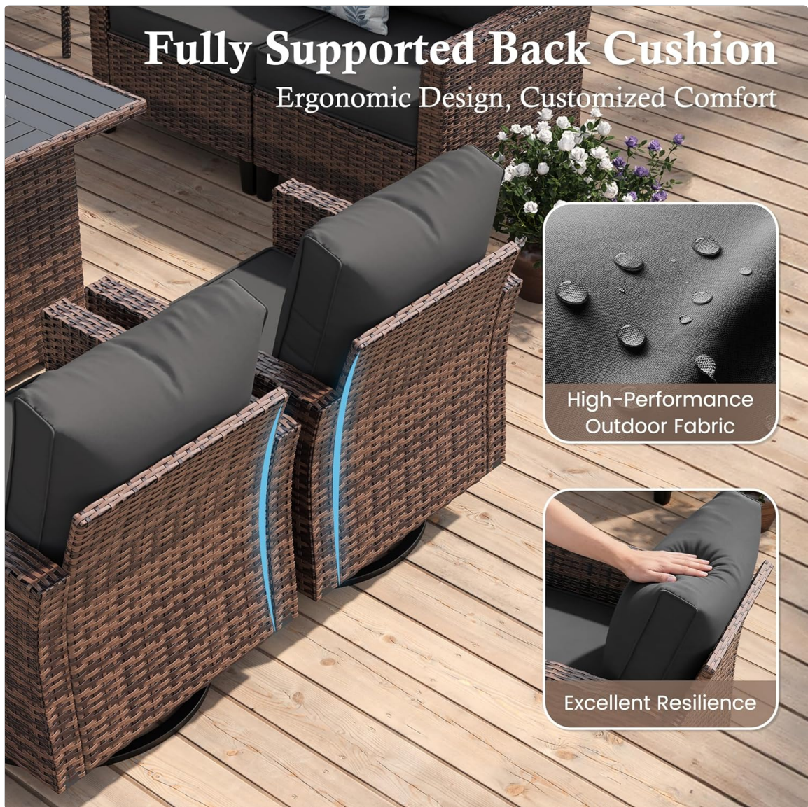
Image 2.3: A close-up of a chair highlighting the fully supported back cushion and the high-performance, water-resistant outdoor fabric.