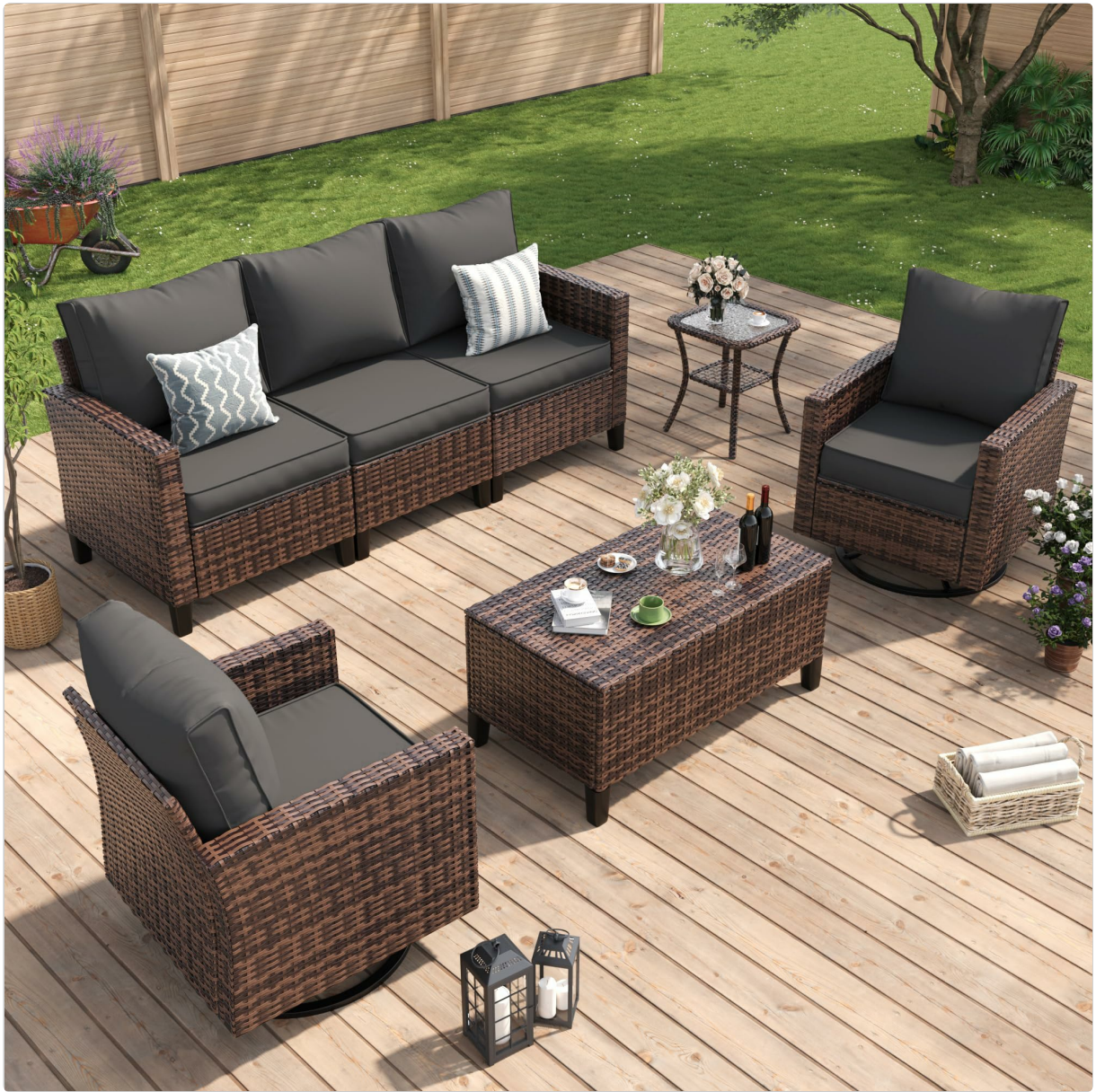
Image 1.1: The Amopatio 5-Piece Wicker Outdoor Sectional Sofa Set, featuring a 3-seat sofa, two swivel rocker chairs, a storage coffee table, and a side table, arranged on a patio next to a pool.