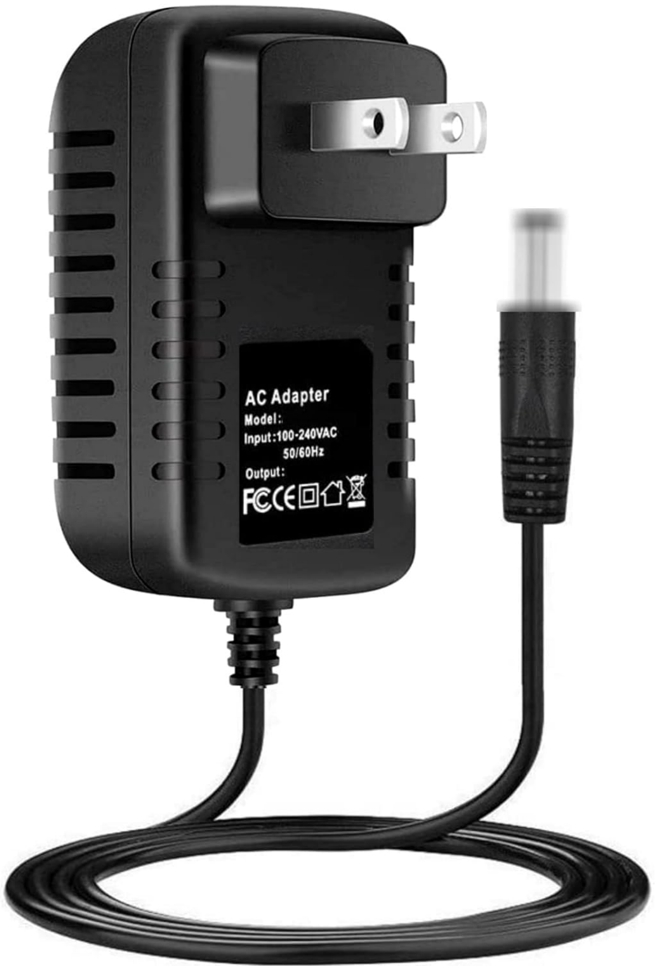
Image 1.1: The onerbl AC/DC Adapter, showing the main unit with the US plug and the DC output connector.