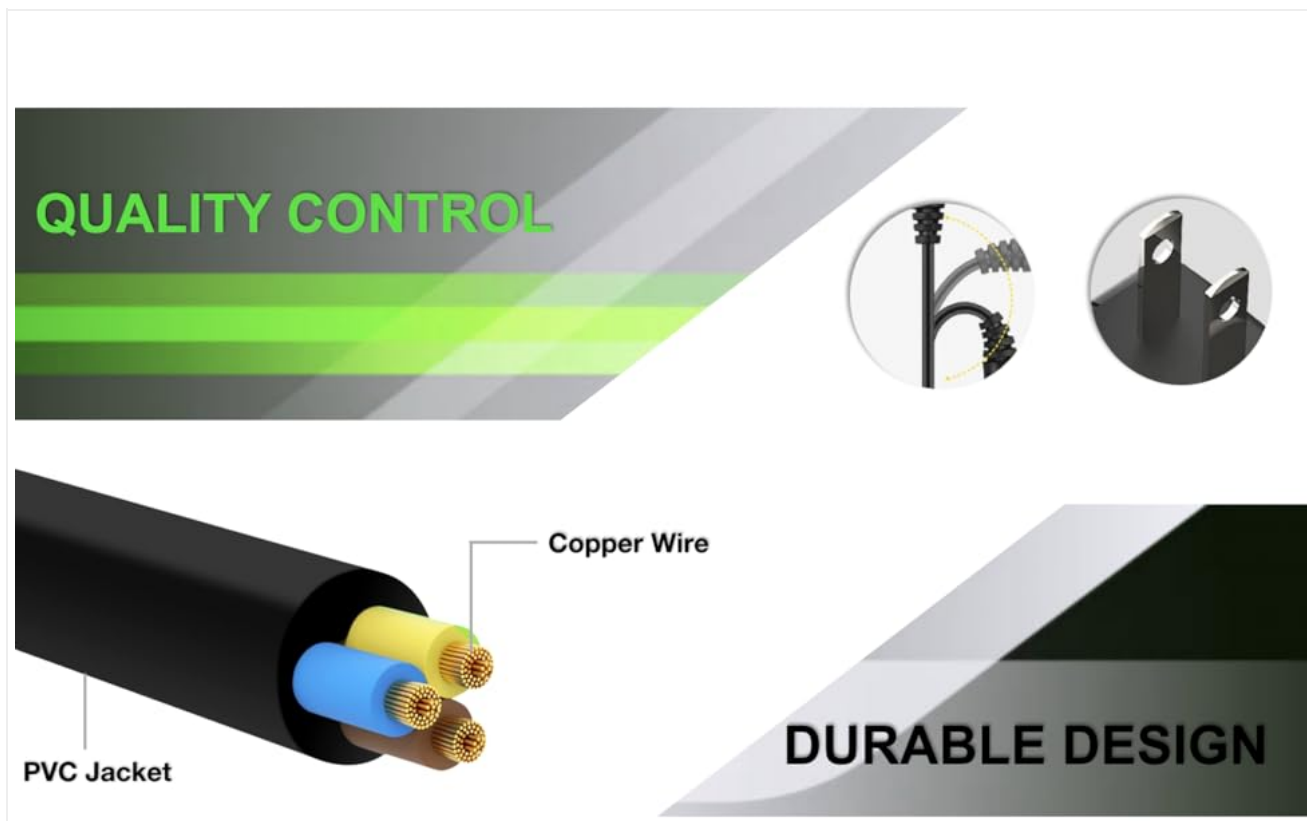
Image 3.1: Details on the adapter's durable design, highlighting the copper wire and PVC jacket for longevity and safety.