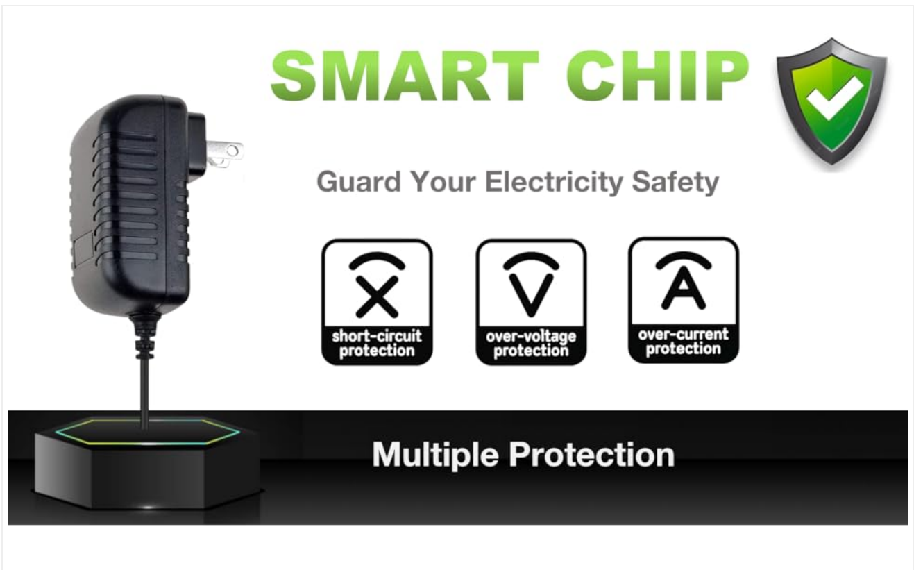
Image 2.1: Illustration of the adapter's built-in safety features, including short-circuit protection, over-voltage protection, and over-current protection, provided by a smart chip.