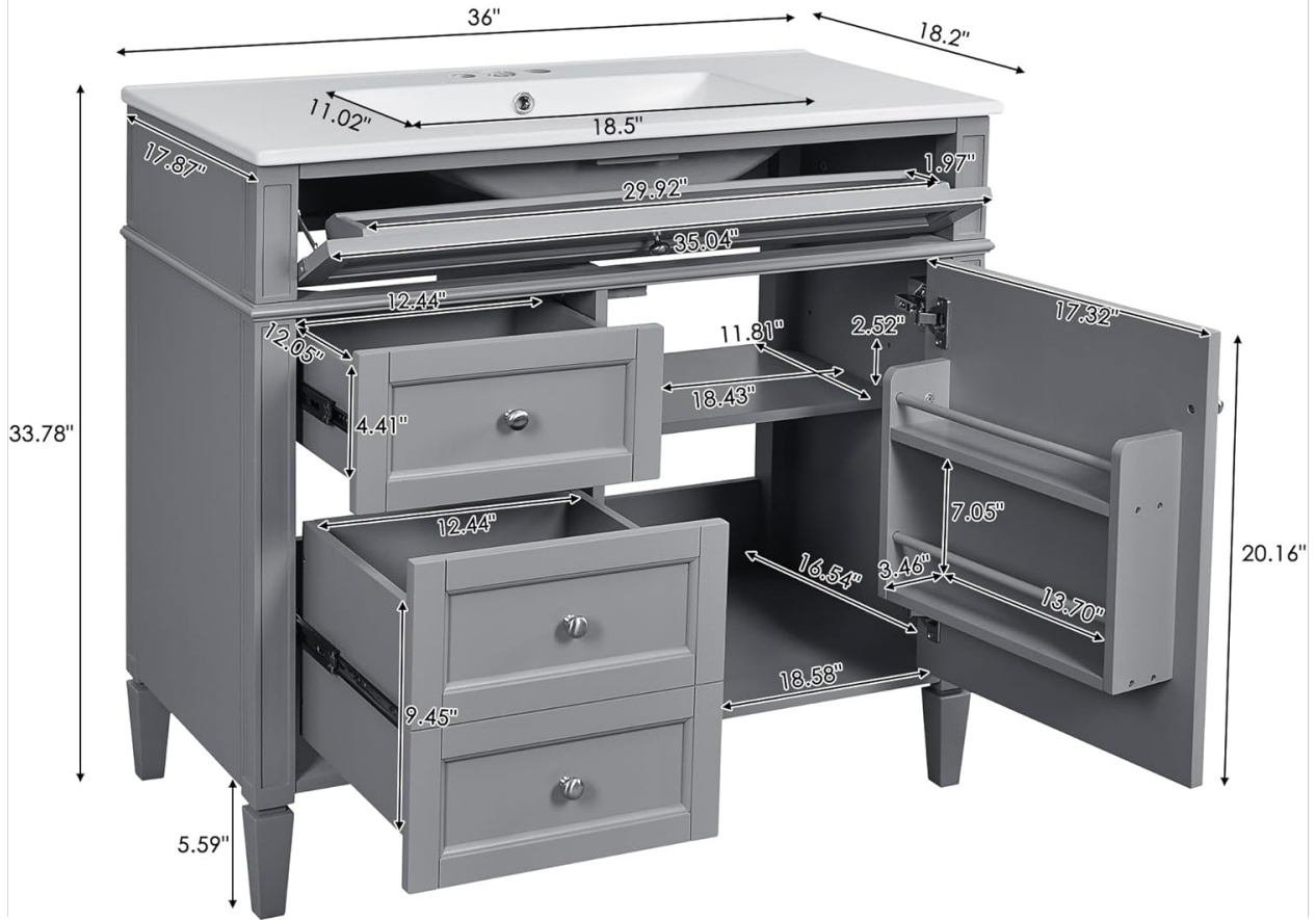
Image 4.1: Detailed dimensions of the Linique 36-inch Bathroom Vanity, including height, width, and depth measurements for the cabinet and sink.