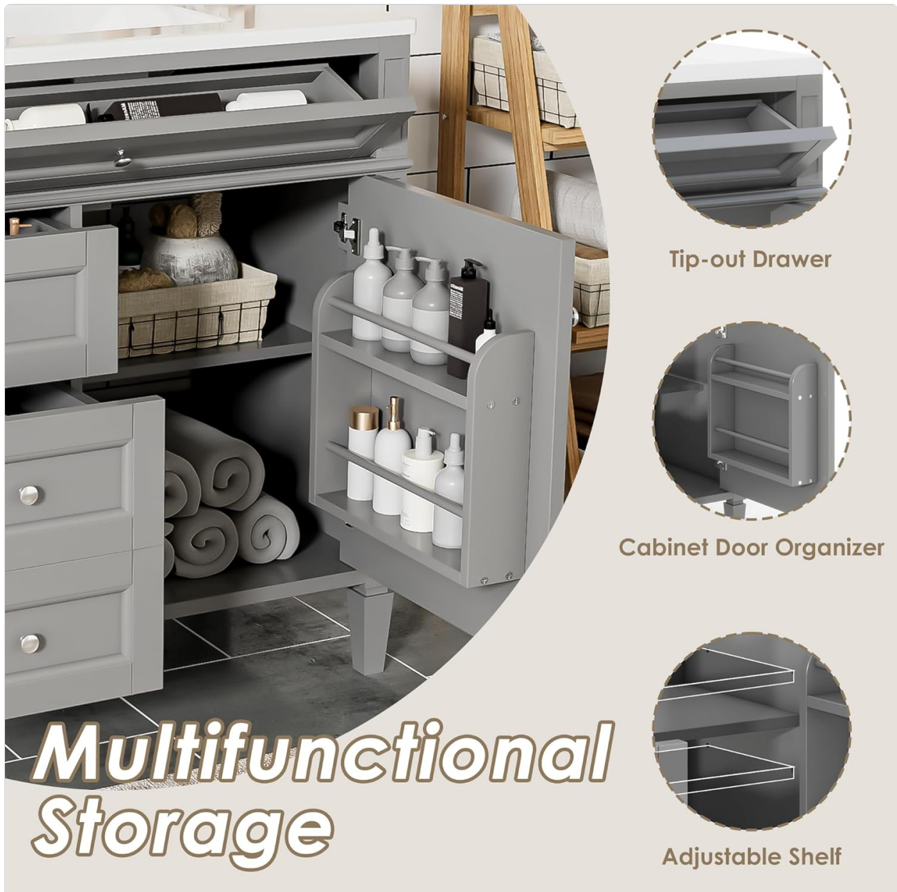
Image 6.1: Close-up view illustrating the multifunctional storage options: the tip-out drawer, the cabinet door organizer, and the adjustable shelf within the main cabinet.

heights. To adjust, remove the shelf, reposition the shelf pins to the desired height, and reinsert the shelf.