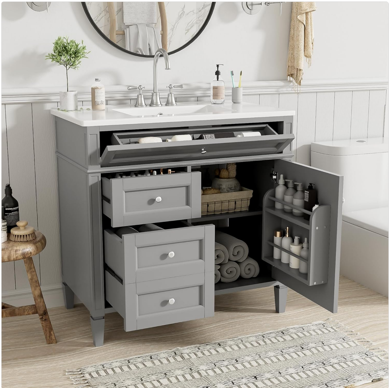
Image 1.1: The Linique 36-inch Bathroom Vanity with Sink Combo Set, showcasing its open storage compartments, including drawers, a tip-out drawer, and a cabinet door organizer.