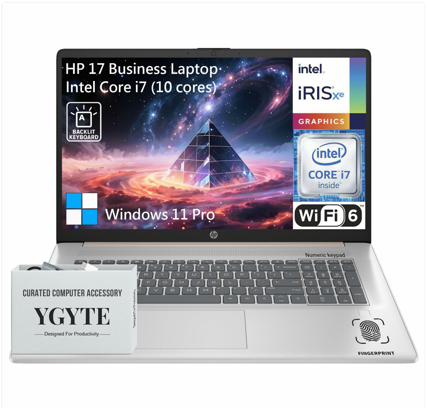
A general view of the HP 17.3 Inch Laptop, showcasing its design and large display.