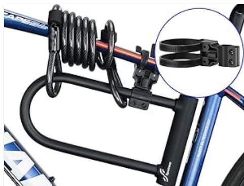
Image 3.2: The U-lock and security cable conveniently mounted on a bicycle, ready for transport.