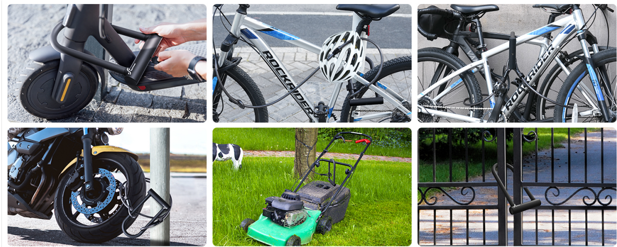
Image 4.3: A collage of images demonstrating the wide range of applications for the Sportneer U-lock and cable, including securing scooters, multiple bikes, motorcycles, lawnmowers, and gates.