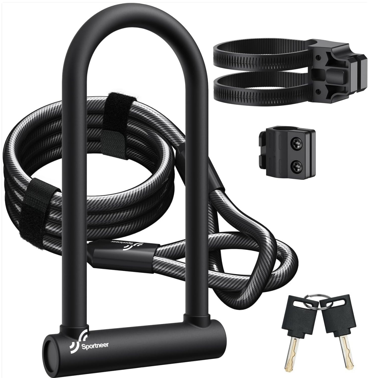
Image 1.1: Components of the Sportneer U-Lock and Security Cable kit, including the U-lock, braided steel cable, two keys, and a mounting bracket.