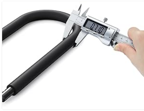
Image 2.2: Close-up view of the U-lock shackle, showing its 0.71-inch (18mm) thickness, indicating its robust construction.