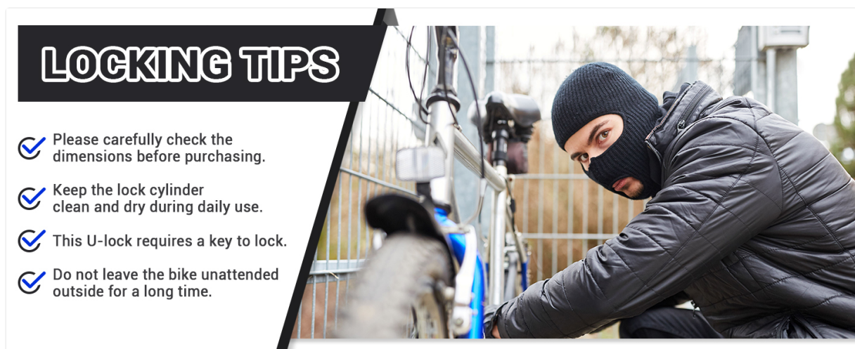
Image 8.1: Important locking tips, including checking dimensions, keeping the lock cylinder clean, using a key to lock, and avoiding leaving the bike unattended for long periods.