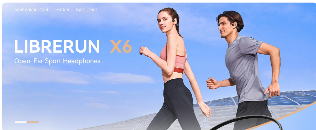
Image 3: A woman running outdoors, demonstrating the comfortable and secure fit of the open-ear headphones.