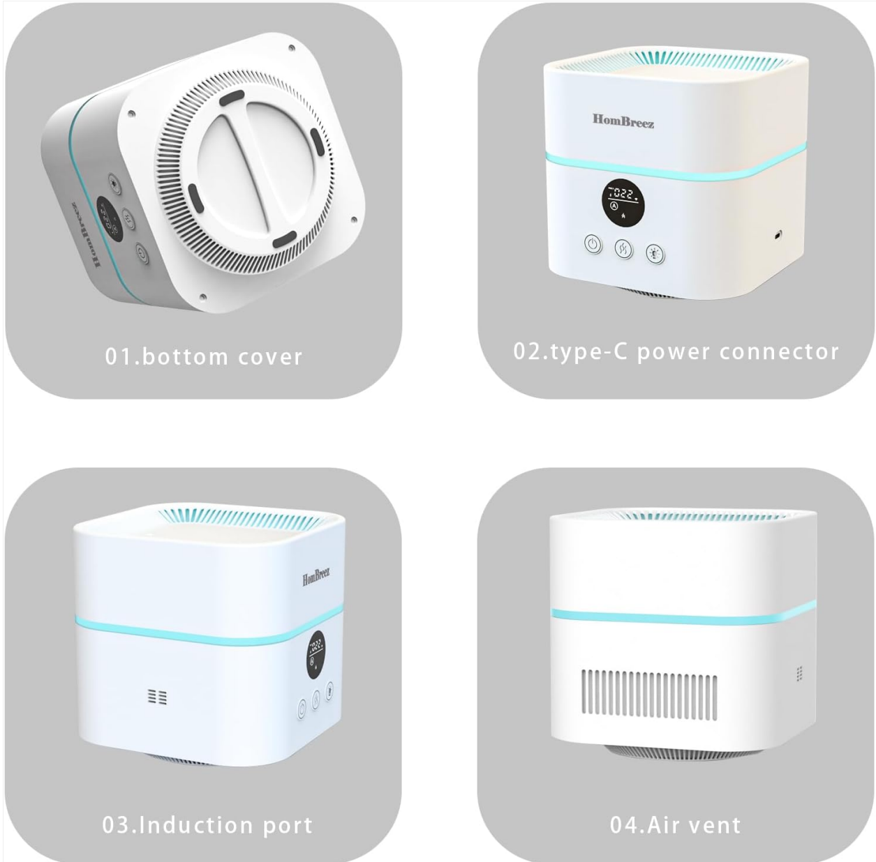
Figure 1: Key components of the HomBreez Air Purifier. This image displays the bottom cover, Type-C power connector, induction port, and air vent locations on the device.