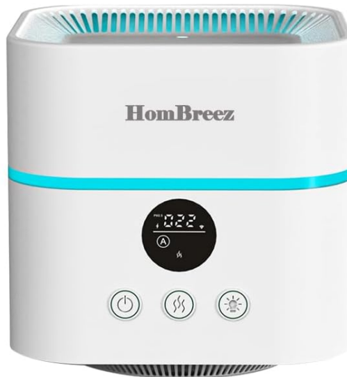
Figure 3: The HomBreez Air Purifier as it appears when first removed from its packaging.