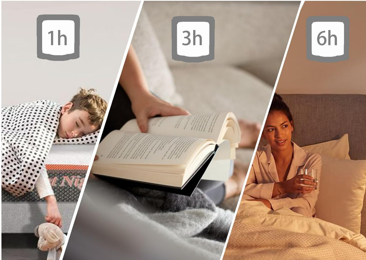
Figure 5: The timer function allows users to set the device to operate for 1, 3, or 6 hours, suitable for various activities like sleeping or reading.