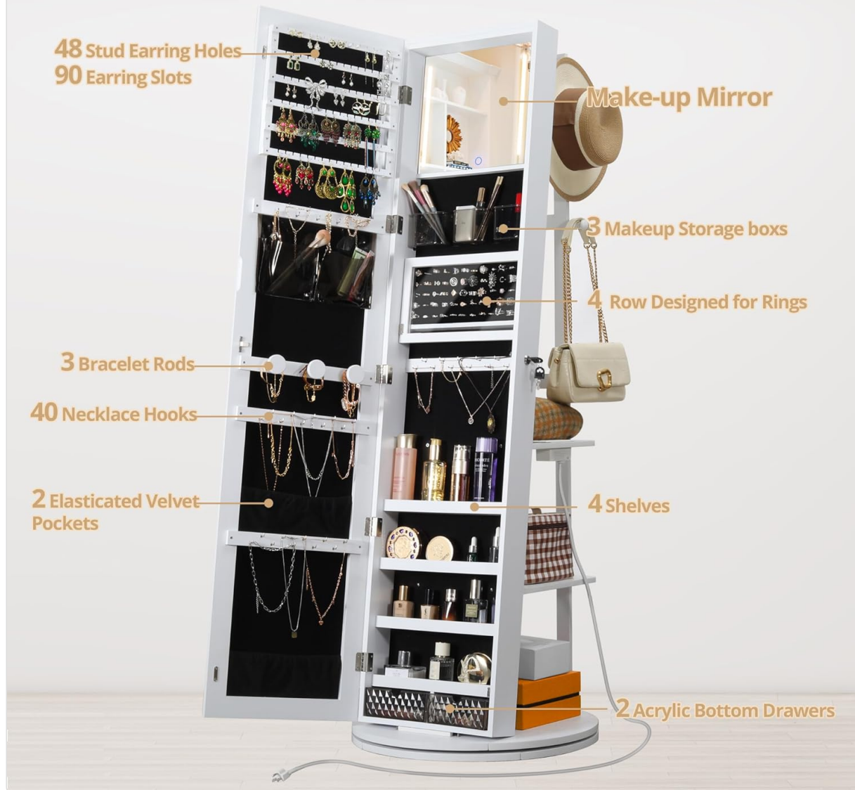
Figure 2: Detailed view of the interior jewelry storage and makeup mirror.