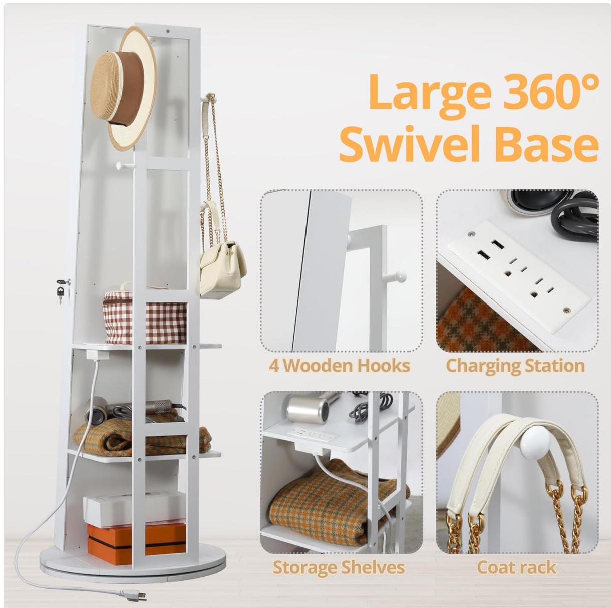
Figure 4: Rear view showcasing the swivel base and charging station.