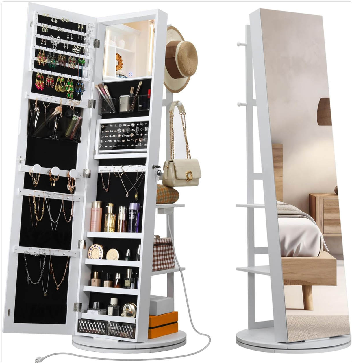
Figure 1: Front view of the IRONCK 360° Swivel Mirrored Jewelry Cabinet.