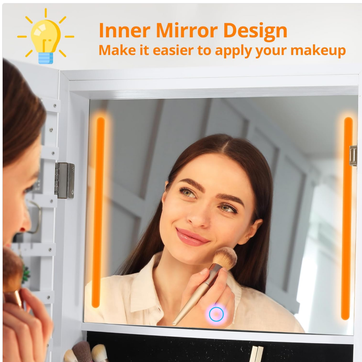
Figure 3: Visual representation of the cabinet's multi-functional design elements.